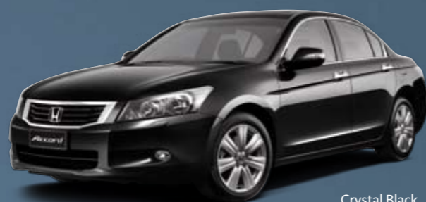
Crystal Black Pearllescent