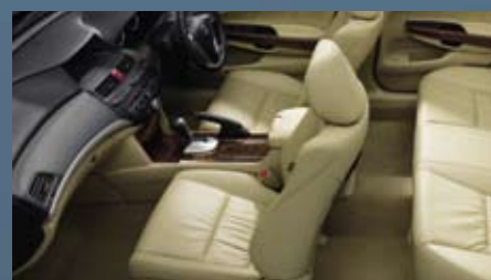
VTi Luxury model shown.