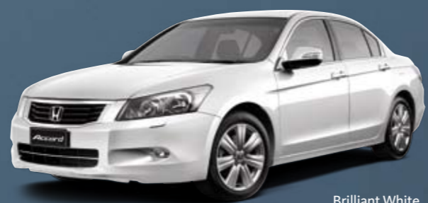
Brilliant White Pearllescent

Every way you look at it, it looks great.