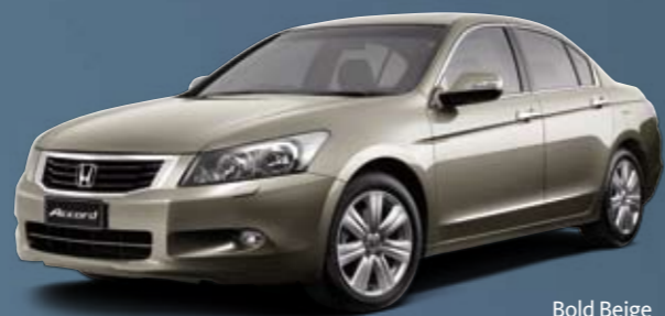
Bold Beige Metallic