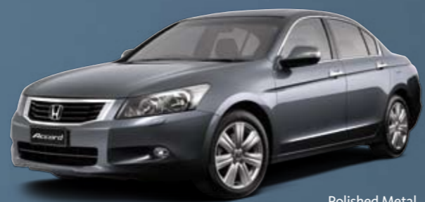
Polished Metal Metallic