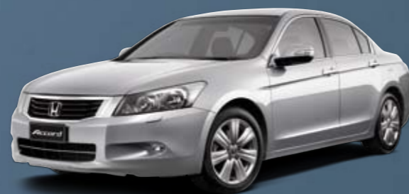
Alabaster Silver Metallic