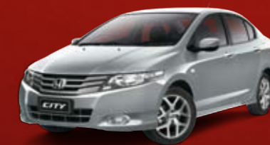
Alabaster Silver Metallic ^