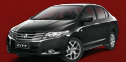
Crystal Black Pearl ^

^ Metallic/Pearlescent paint at extra cost.