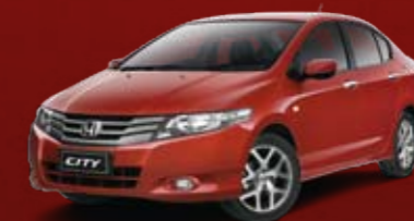
Habanero Red Pearl ^