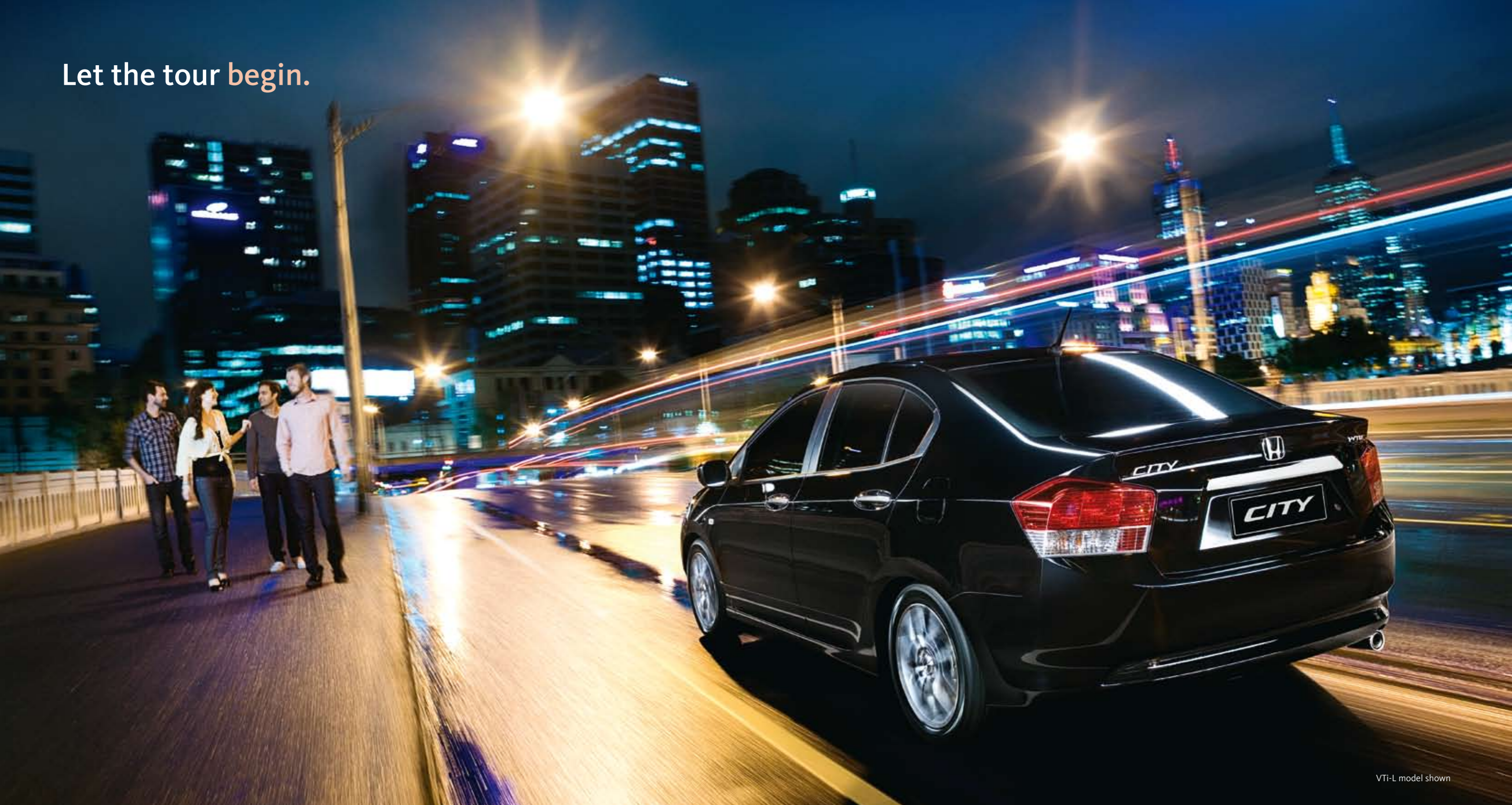
VTi-L model shown

Cities – really great ones, anyway – make you giddy. They cram the best of all worlds together. Energy, excitement, sophistication and style collide. Welcome to the brand-spanking-new Honda City. Whether you choose the VTi or VTi-L model, the 5-speed manual or 5-speed automatic transmission, one thing will become instantly and abundantly clear; this is no ordinary car. It's a smart new way.