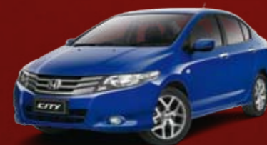
Deep Lapis Blue Metallic ^