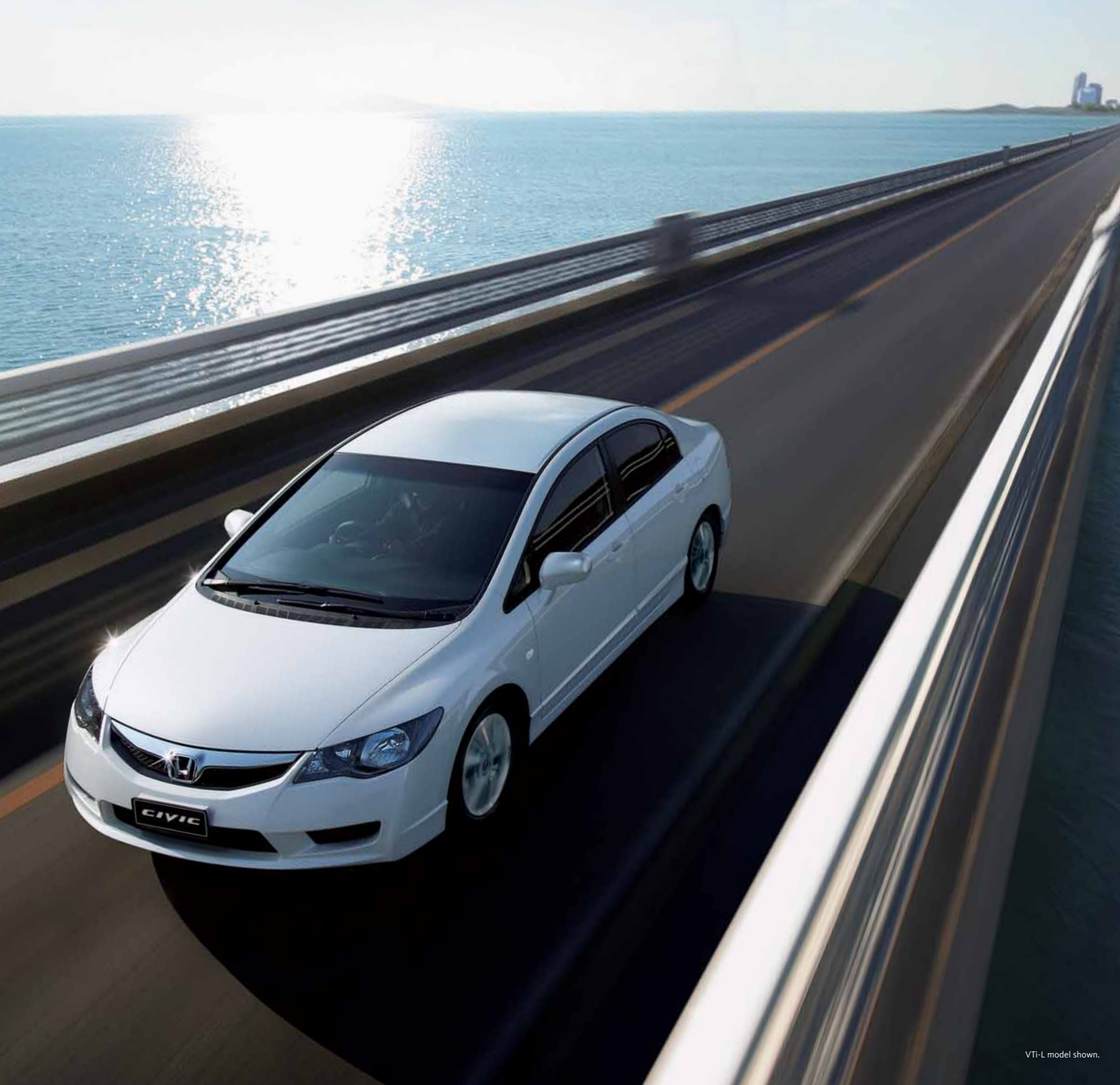
VTi-L model shown.