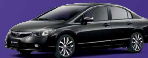
Crystal Black Pearllescent*