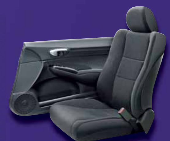
Grey interior (VTi and VTi-L models)