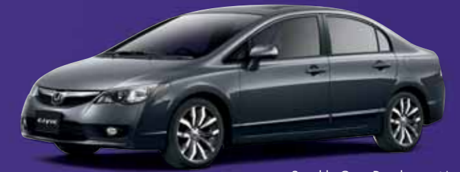
Sparkle Grey Pearllescent*

The Civic comes in a range of colours so, whatever your lifestyle, you can tailor your Civic to be even more perfect.