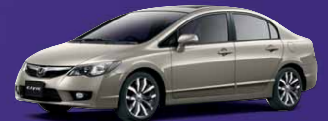
Bold Beige Metallic*