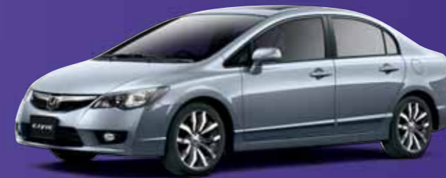
Bluish Silver Metallic*