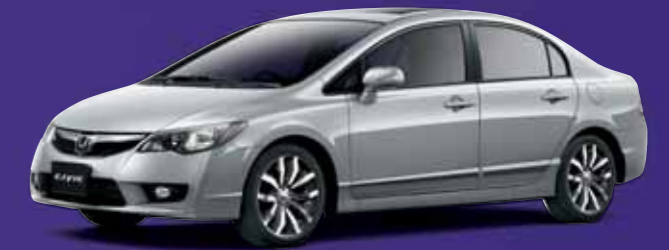
Alabaster Silver Metallic*