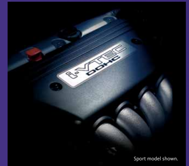
Sport model shown.