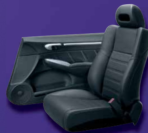
Black interior (Sport model)