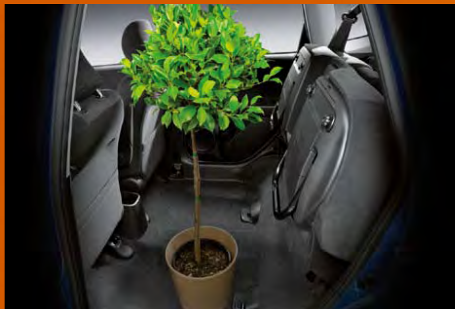
Tall mode Raise her back seat cushions to fit taller objects.