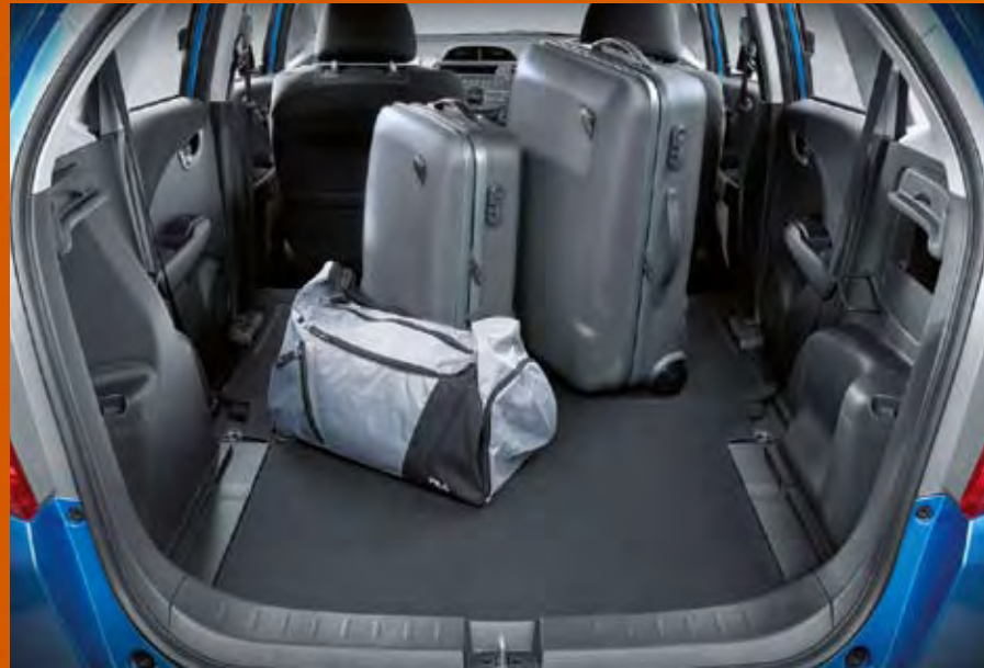
Utility mode With the back seats down, you'll have all the room in the world.

In Tall mode, raise her back seat cushions to fit four large suitcases or perhaps a tall shrub sitting upright. In Utility mode, fully collapse her rear seats to make space for your bicycle or just about anything else. And in Long mode, recline her front and rear seat to create a space long enough to fit a surfboard. If you're not into surfing, try a pair of skis. Or maybe hockey is more your thing. Well, anyway you get the point.