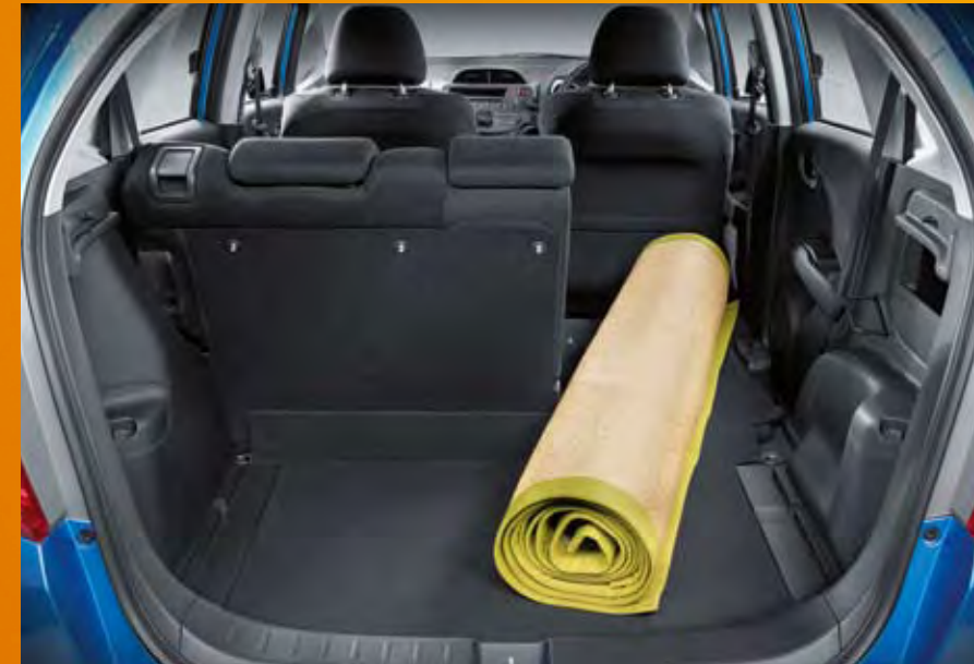
Long mode Recline the right seat to fit long, thin objects.