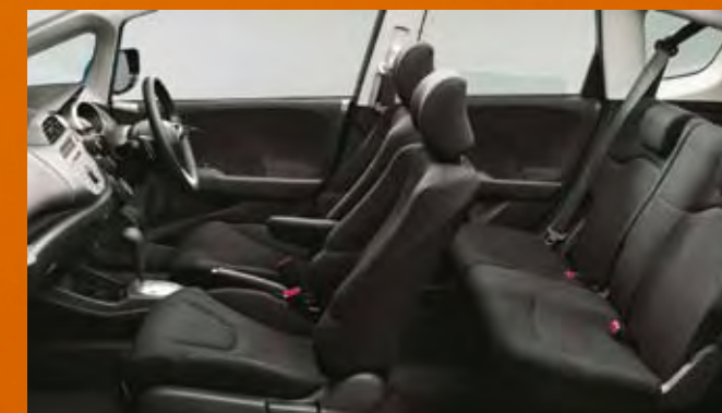
Black interior (VTi-S model)