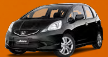
Crystal Black Pearlescent ^

Jazz knows that her colour says a lot about you. That's why she comes in a range of dynamic colours to best suit your individual style.