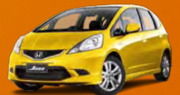
Helios Yellow Pearlescent ^