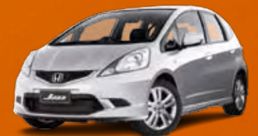
Alabaster Silver Metallic ^