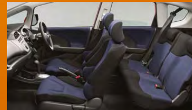
Blue/Black interior (GLi, GLi-SP & VTi models)