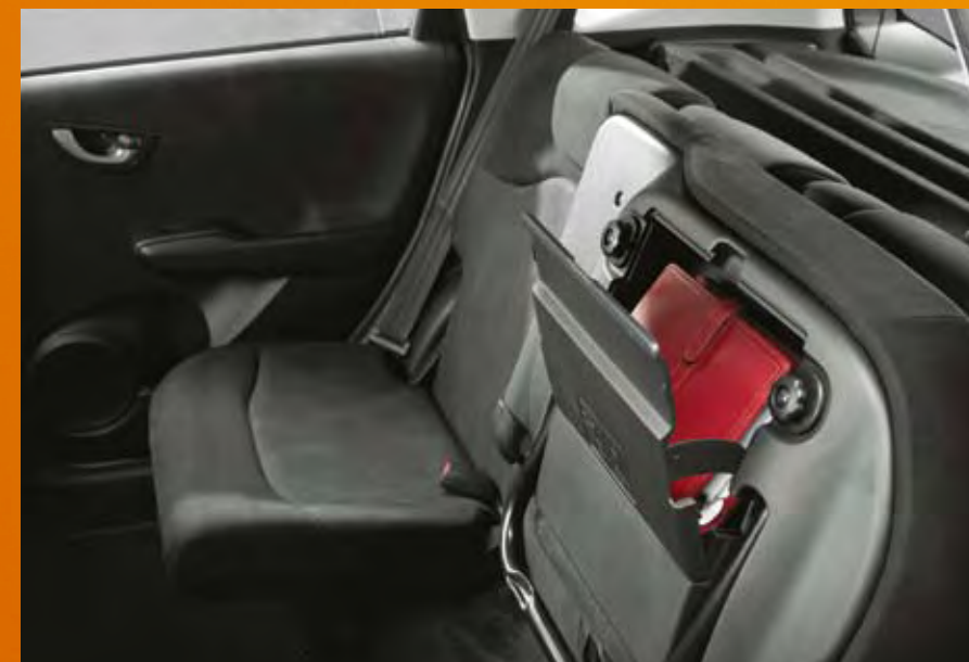
Secret Storage Case You can hide anything and everything from everyone.