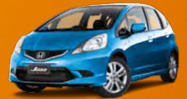
Cerulean Blue Metallic ^