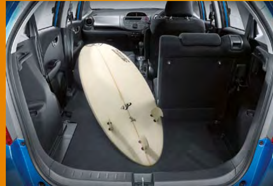
Long mode Recline the left seats to fit long, wide objects.