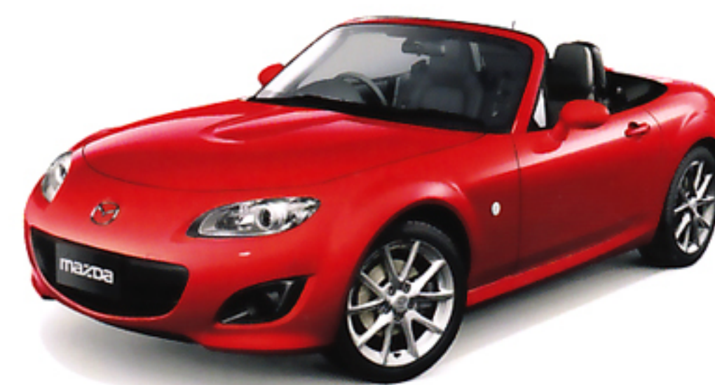
True Red (A4A)