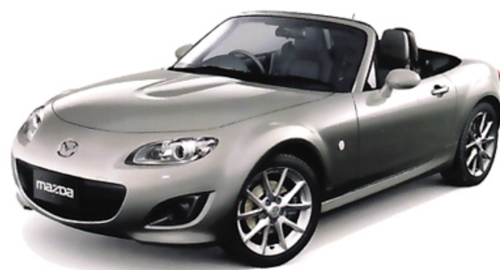
Aluminium Metallic (38P)