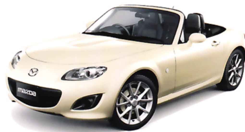
Marble White (A5M)* *Only for soft-top models