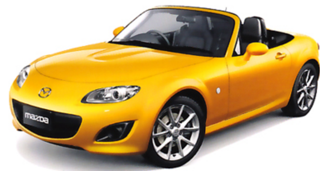
Sunflower Yellow (A6Y)