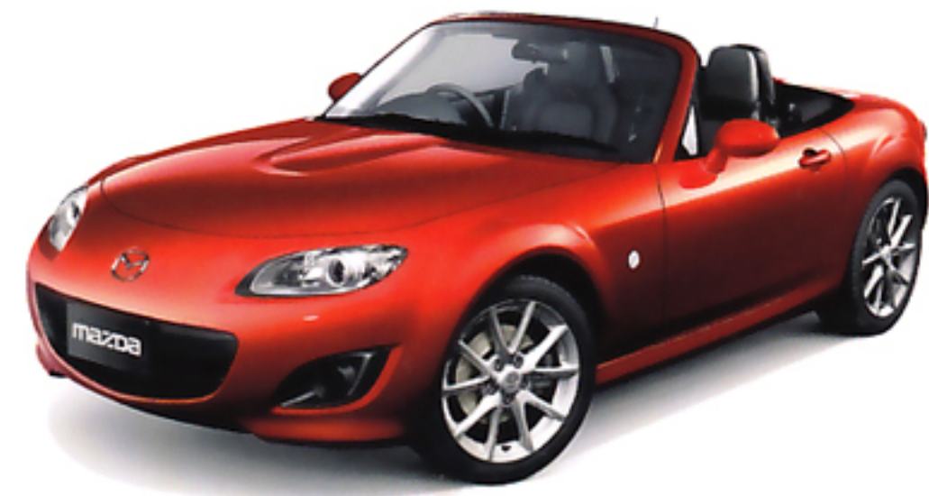
Copper Red Mica (32V)