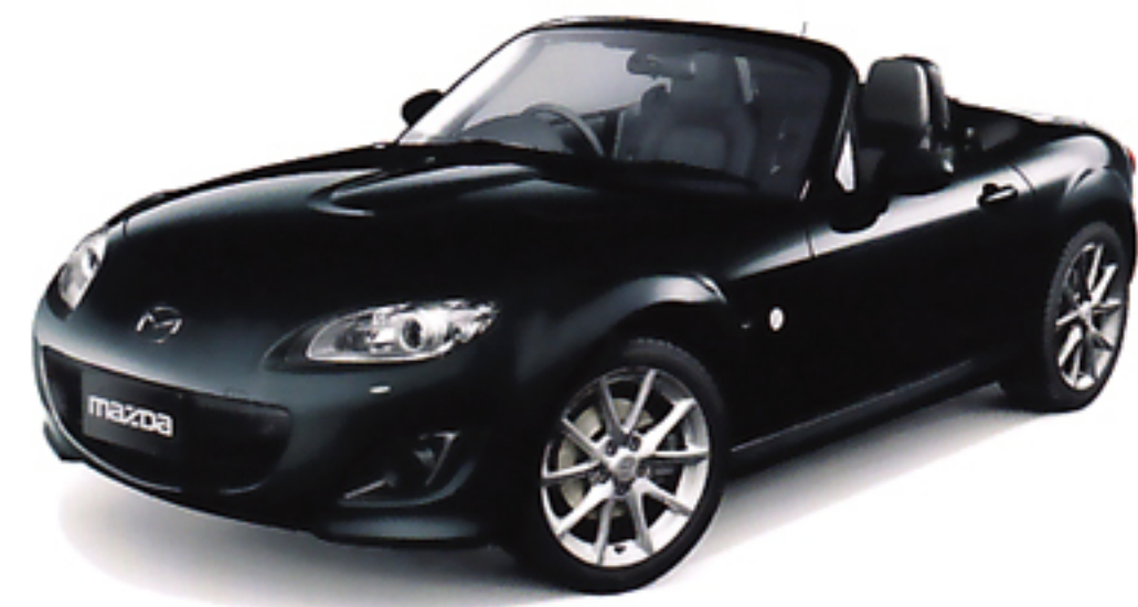
Brilliant Black (A3F)