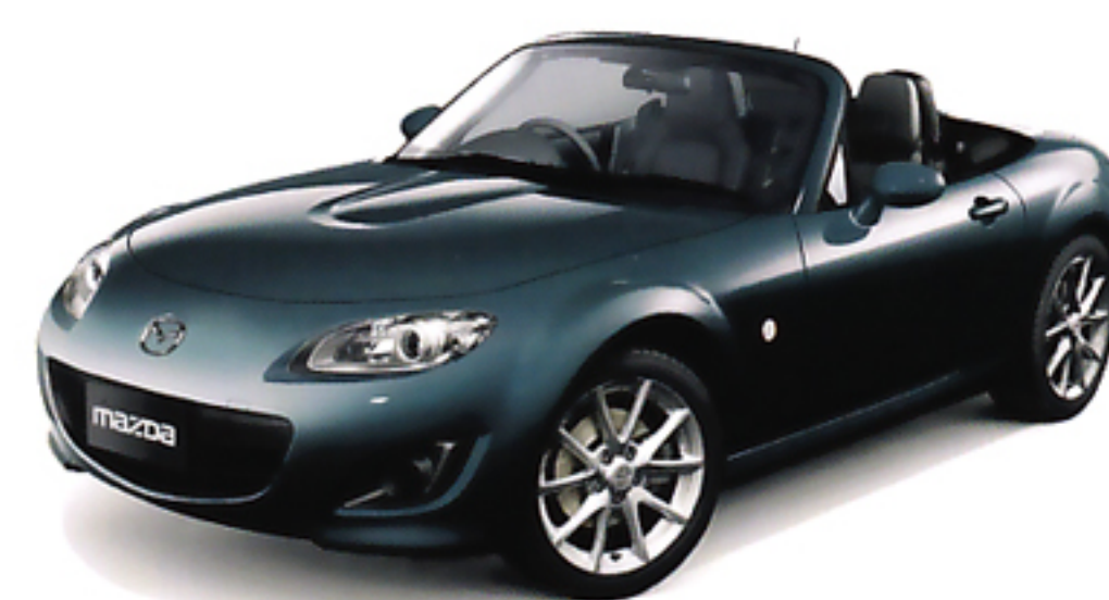
Metropolitan Grey Mica (36C)