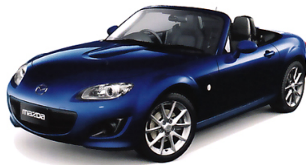
Stormy Blue Mica (35J)