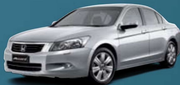
Alabaster Silver Metallic