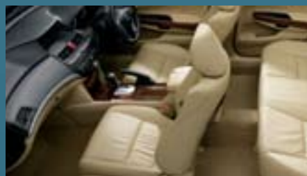
VTi Luxury model shown.