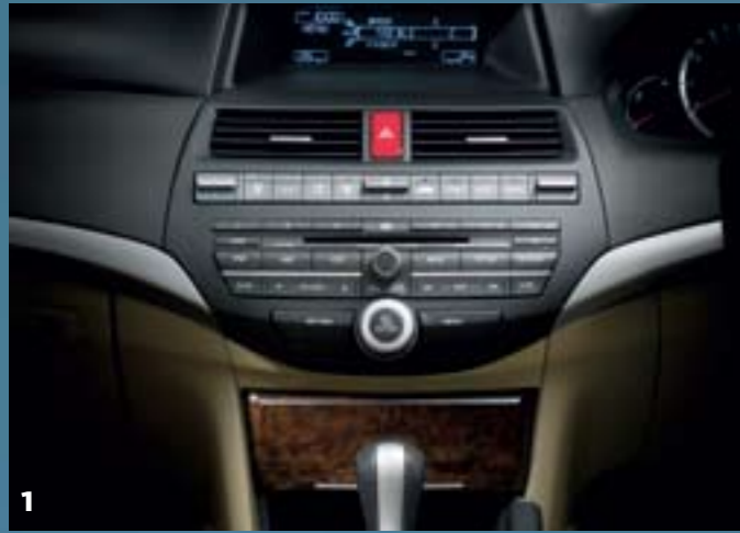
VTi Luxury model shown.