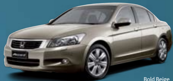
Bold Beige Metallic