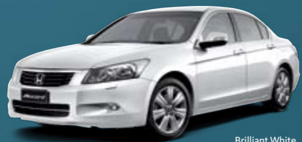
Brilliant White Pearllescent

Every way you look at it, it looks great.