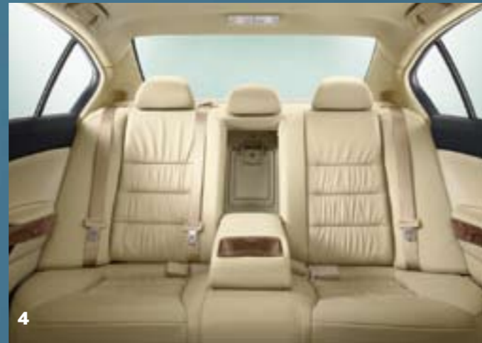
V6 Luxury model shown.