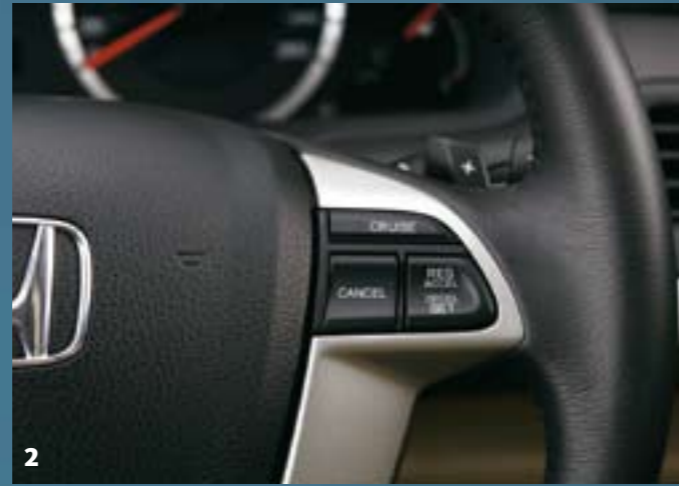
VTi Luxury model shown.