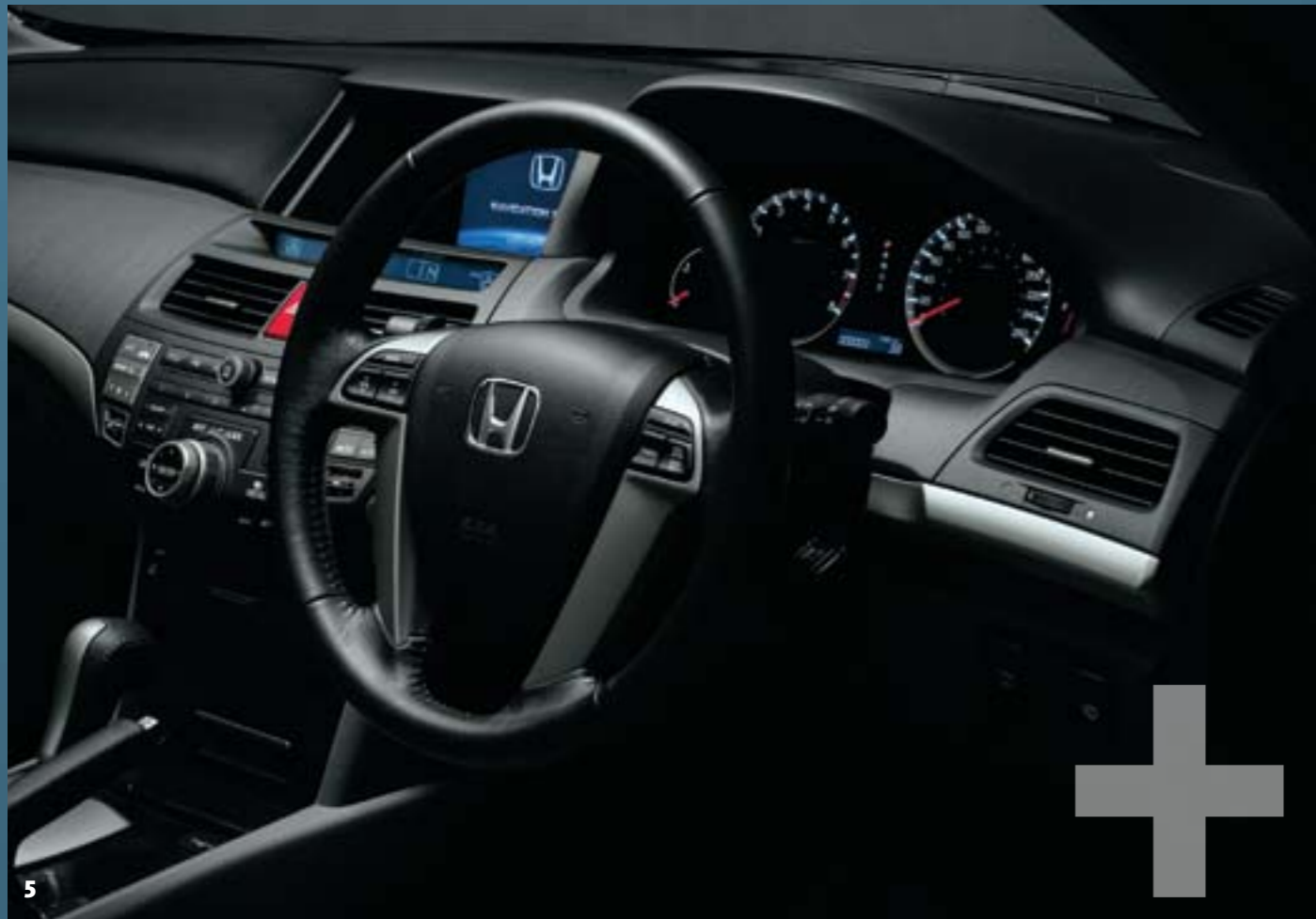
V6 Luxury model shown.