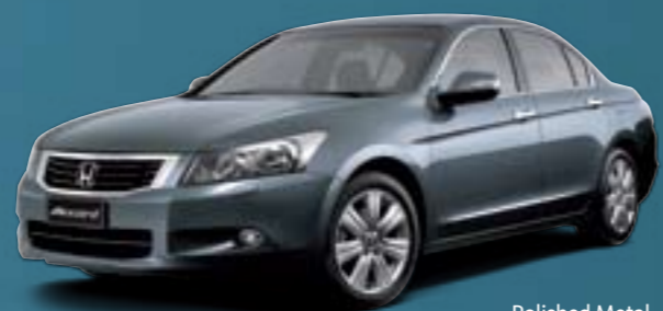
Polished Metal Metallic