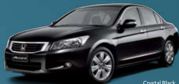
Crystal Black Pearllescent