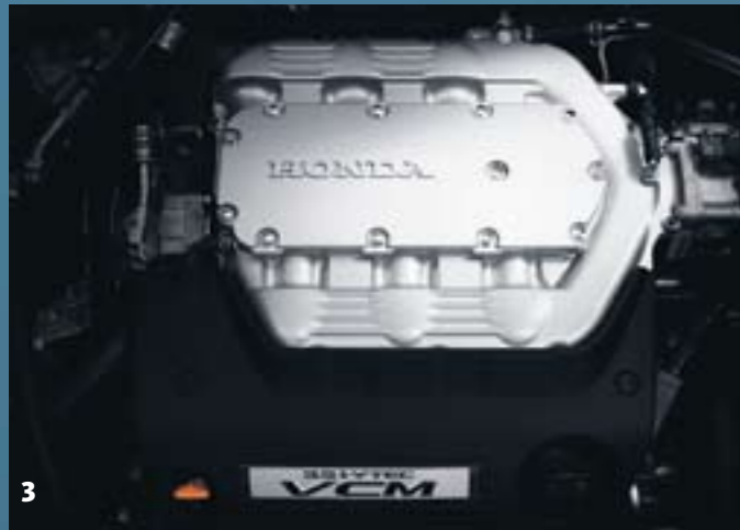
V6 Luxury model shown.