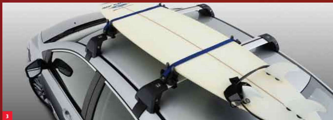
1 Roof Rack Set (50kg weight capacity). Conveniently carry items such as bikes and skis outside the vehicle. The versatile roof rack set is designed to be used with Honda Genuine Cargo Accessories. 2 Bike Carrier Attachment. 3 Surfboard Attachment.