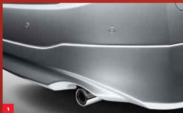
Honda Genuine Rear Park Assist – A virtual sixth sense.

Wear and tear on your vehicle may lead to premature depreciation, and hit your hip pocket when it comes time to sell. Keeping your Honda in showroom condition may help promote higher resale value and is now simple to do with Honda Genuine Protection Accessories.