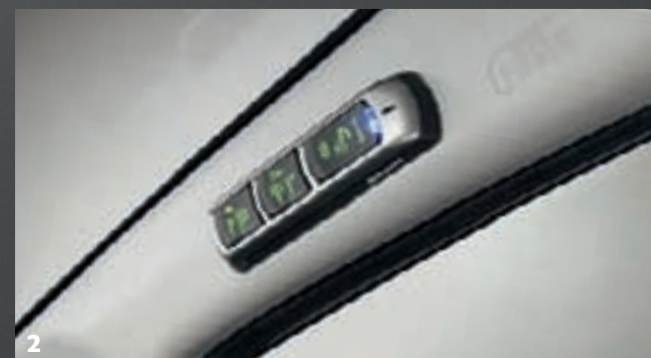
VTi model shown.