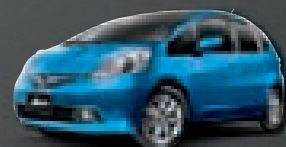
Cerulean Blue Metallic ^