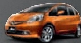
Brilliant Orange Metallic ^*