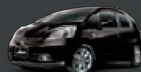
Crystal Black Pearlescent ^