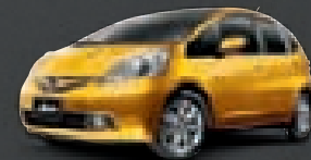
Helios Yellow Pearlescent ^