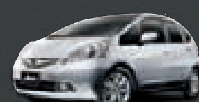
Alabaster Silver Metallic ^