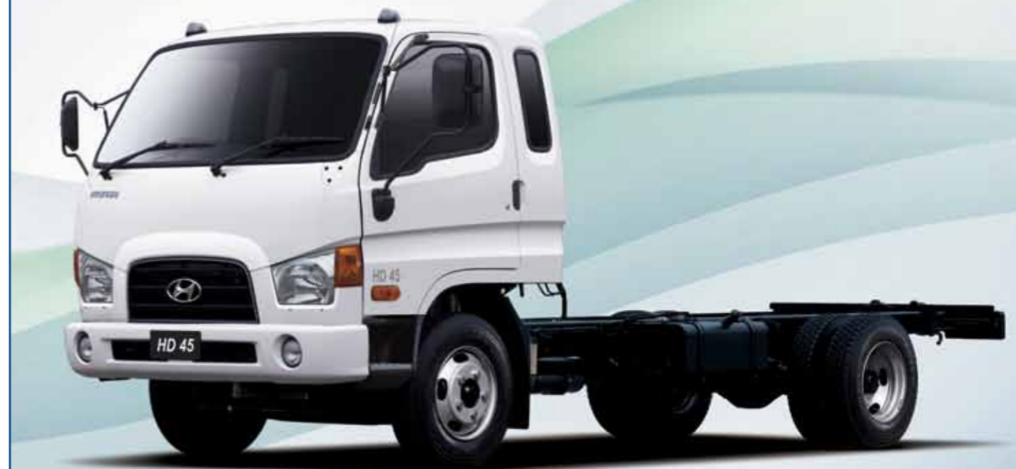
Photo of HD45 Super Cab