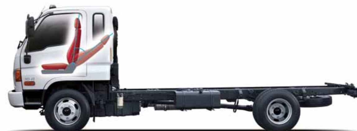
*Optional Super Cab