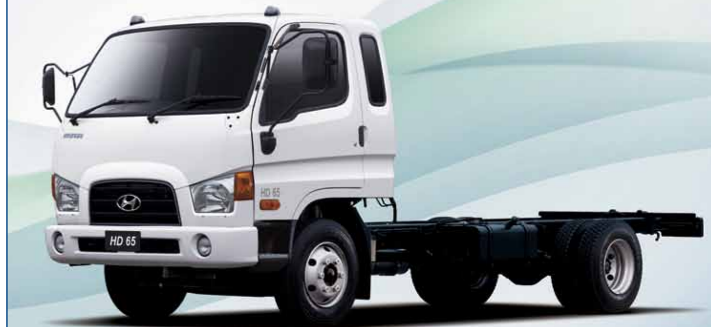
Photo of HD65 Super Cab