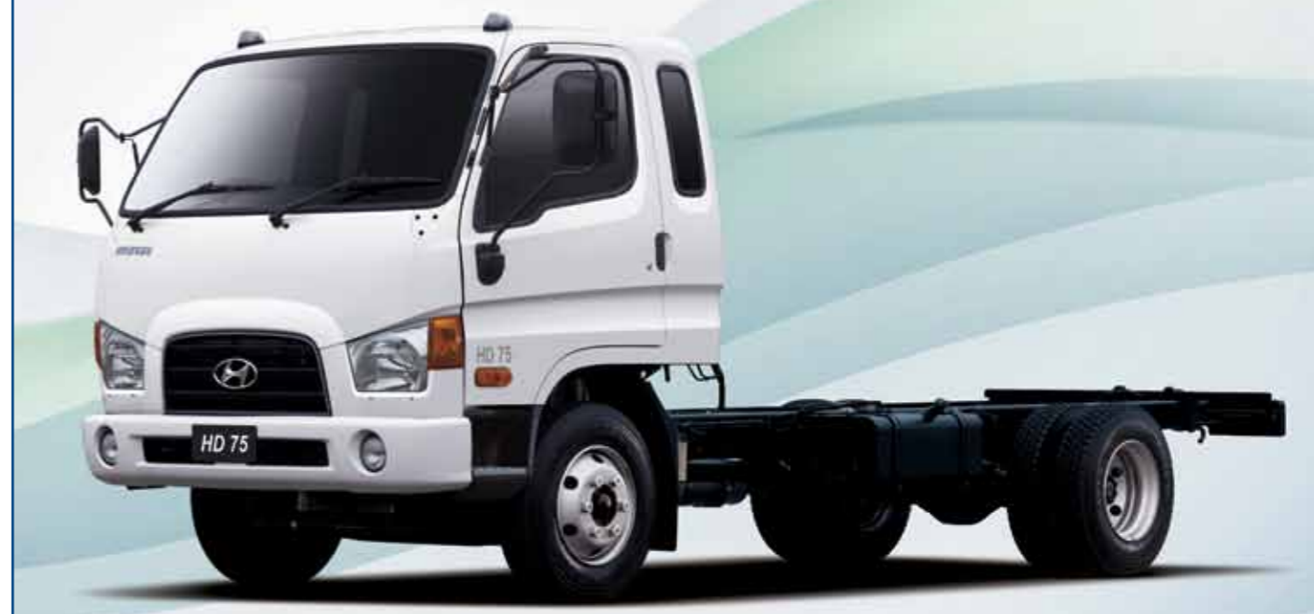
Photo of HD75 Super Cab