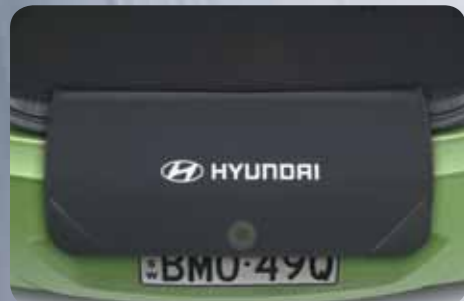
Fabric Rear Bumper Protector