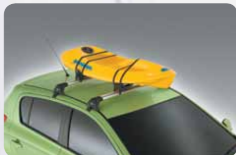
Roof Mounted Kayak Holder