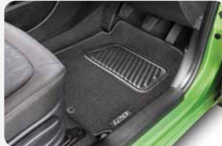
Tailored Carpet Floor Mats