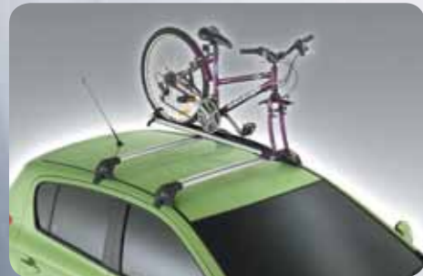
Roof Mounted Bike Carrier