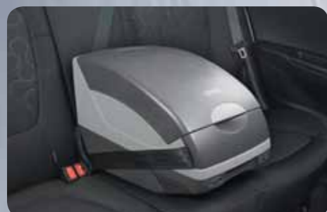
Portable Cooler 3 - 12 volt 15 Litre