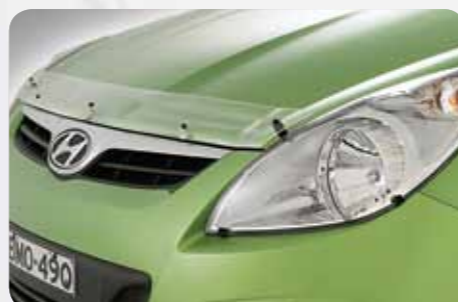
Bonnet Protector & Headlight Protector