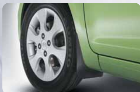
15" Alloy Wheels (Sold singulary)