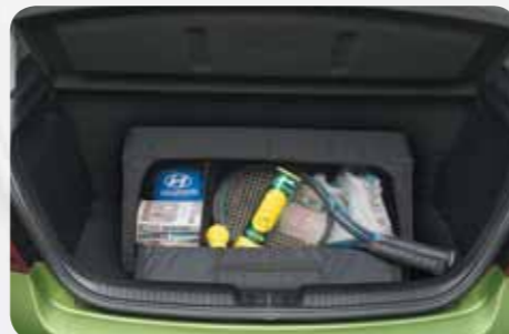
Fold Down Cargo Box