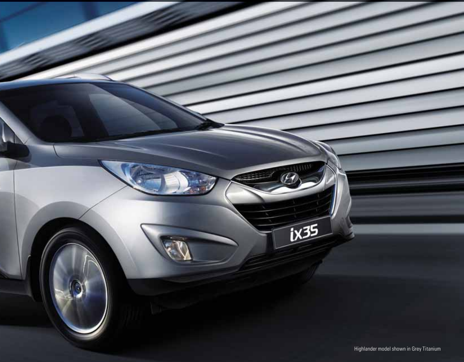
Highlander model shown in Grey Titanium

The standard easy-to-use manual temperature control air conditioning has separate vents for back seat passengers. Highlander models feature automatic dual-zone climate control with cluster ionizer that automatically cleans the air when the air conditioner or heater is running.