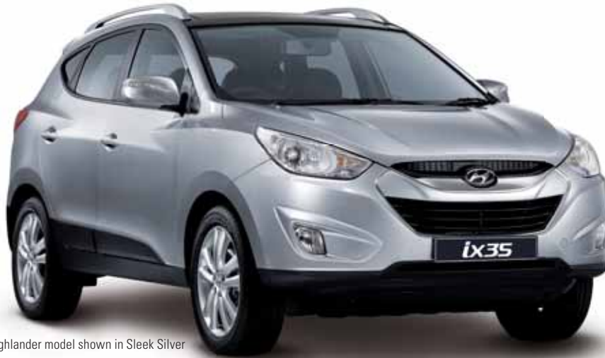
Highlander model shown in Sleek Silver