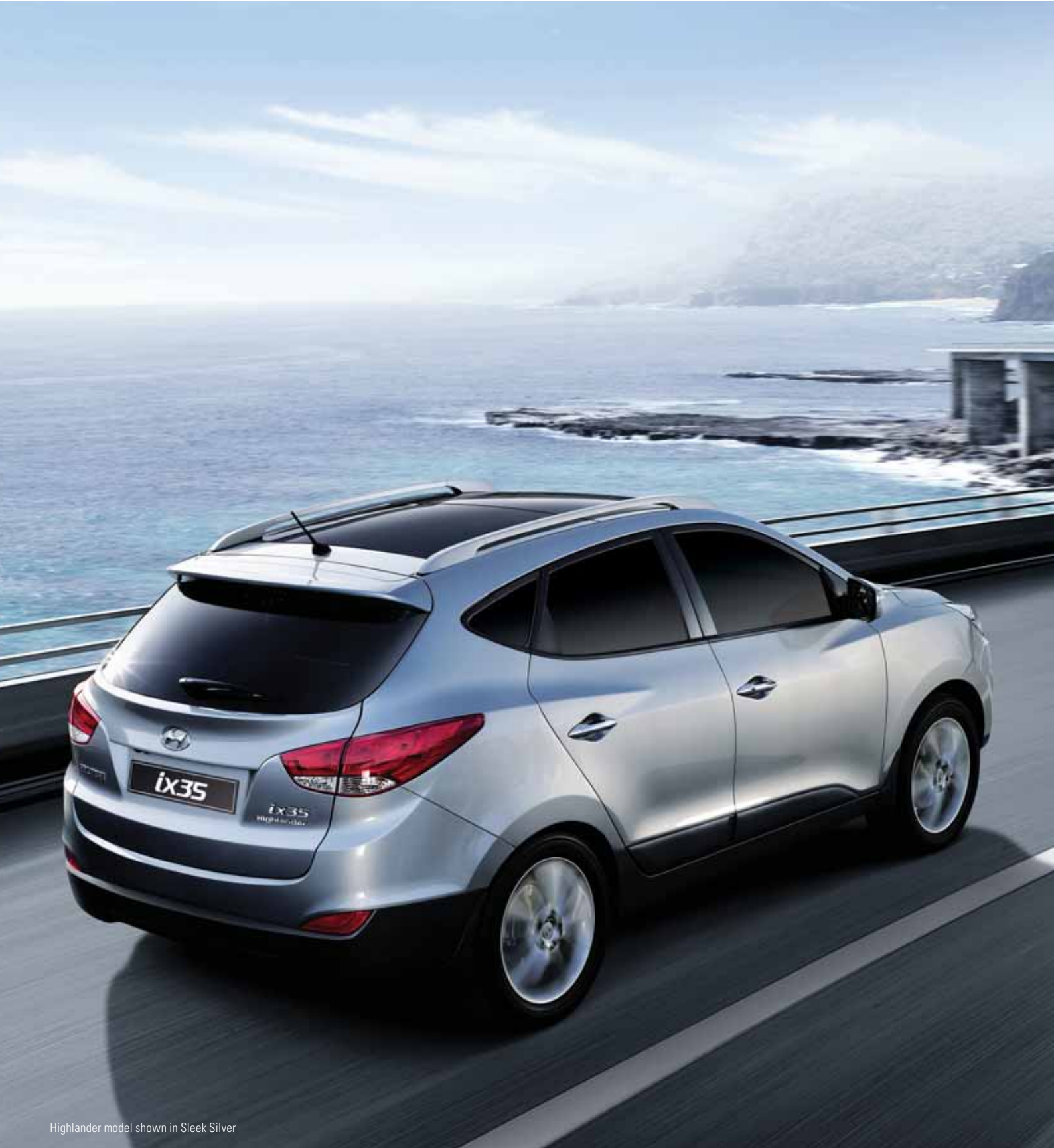
Highlander model shown in Sleek Silver

All ix35's are equipped with a comprehensive array of advanced safety features that help you control the vehicle in challenging conditions. With so much attention to safety and occupant protection, no matter where you go in the ix35 you'll find peace-of-mind.