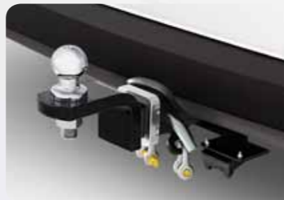
Towbar, Towball and Trailer Wiring Harness