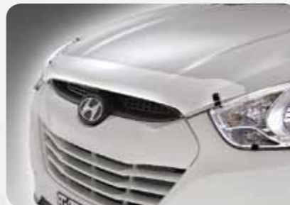
Headlight and Bonnet Protectors (sold separately)