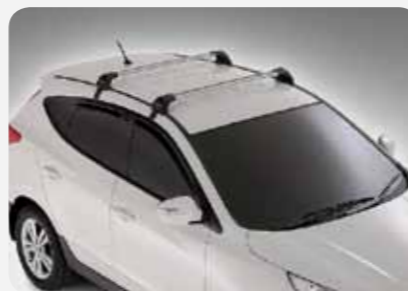
Whisbar™ Quiet Roof Racks