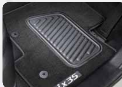
Tailored carpet Floor Mats (set of 4)