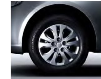
195 / 65R 15" Steel Wheel

Designed from the ground up. The Cerato comes with 15-inch steel wheels with a single 5 split-spoke cap style. While the Cerato SLi model is equipped with the ultimate 5 split-spoke 17-inch alloy wheels.