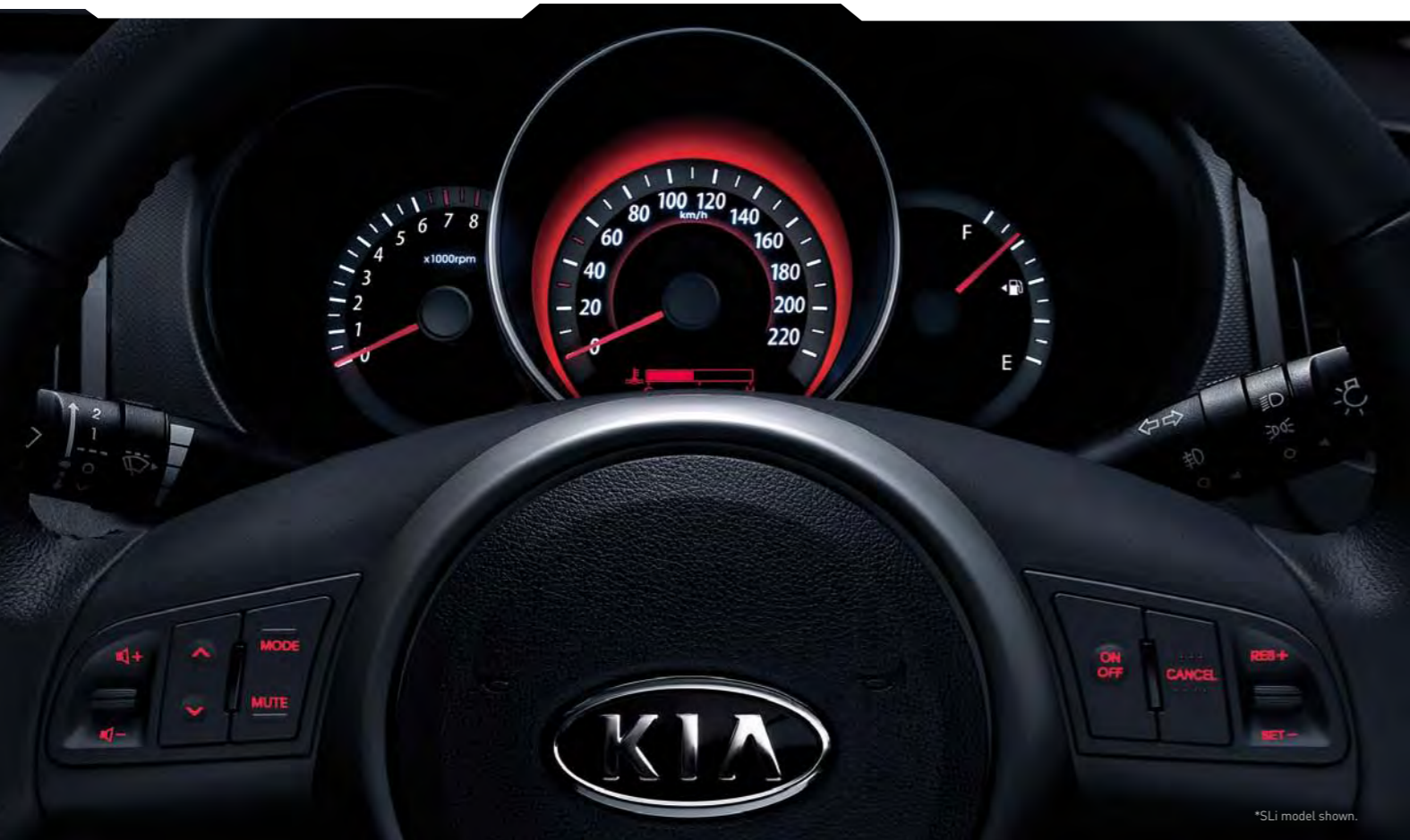
*SLi model shown.