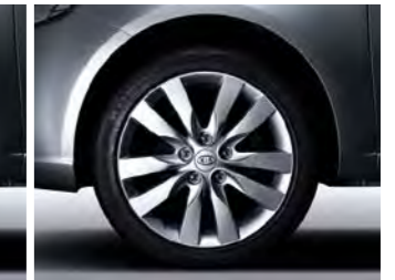
215 / 45R 17" Alloy Wheel