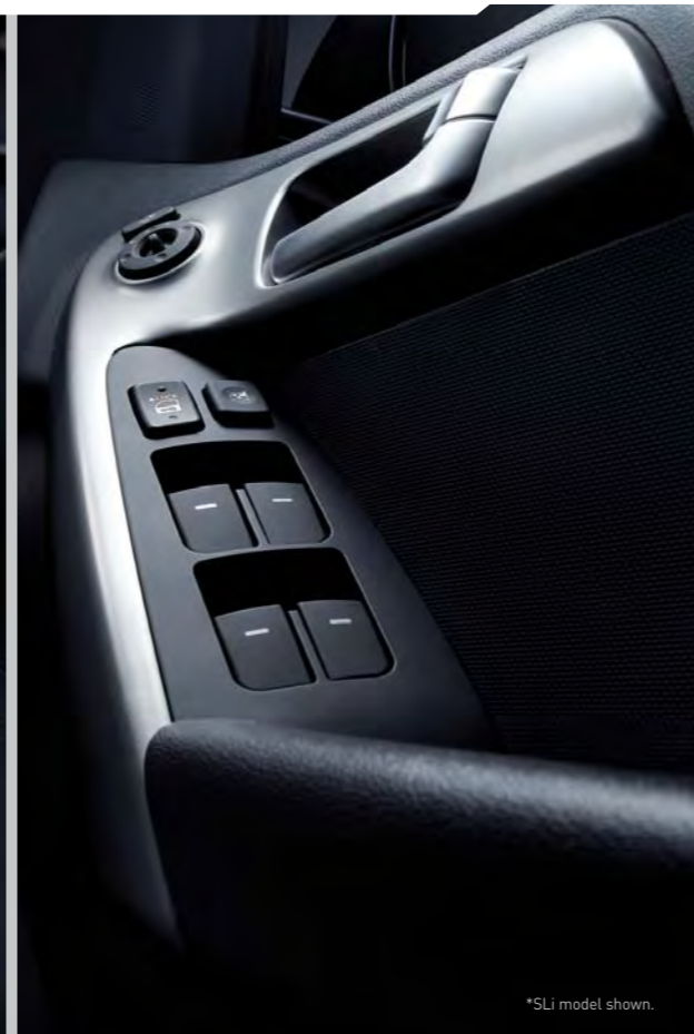
*SLi model shown.

◀◀ Supervision cluster, Message centre, Audio remote control* and Cruise control* The Cerato features the Kia trio-gauge cluster with a message centre that prompts important data, such as when a door is open, average speed, fuel consumption*, trip data, coolant temperature and rear parking obstructions*. Steering wheel mounted controls put the audio system and cruise control settings at your fingertips. ◀ Sporty user-friendly door control A suite of controls are located within the door armrest to give you convenient control of power windows, central locking and side mirrors. ▼◀ Full auto climate control* The interior climate can be automatically controlled and a mood ring outlines the air-conditioning dial-knob to give an aura of sophistication. ▼ USB, AUX and iPod* connections The Cerato's audio system enables you to take your media with you. It has CD, iPod and MP3 compatibility, and a USB port for complete audio entertainment.