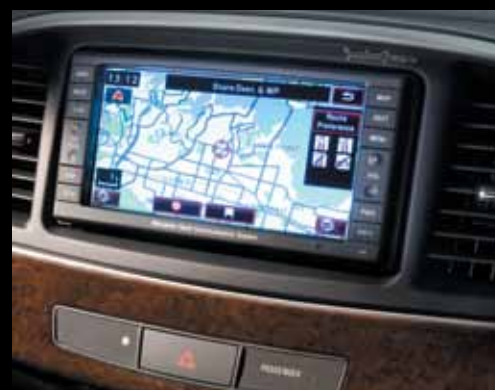
MITSUBISHI MULTI COMMUNICATION SYSTEM (MMCS)

Other features that do the thinking for you include Smart Key which provides key-less entry and operation, Dusk Sensing Headlamps and Rain Sensing Wipers.