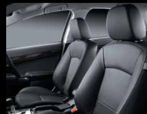
LEATHER TRIMMED SEATS