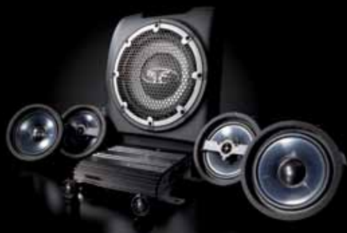
ROCKFORD FOSGATE® PREMIUM AUDIO SYSTEM