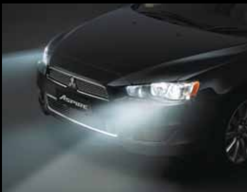
HID HEADLAMPS WITH AFS