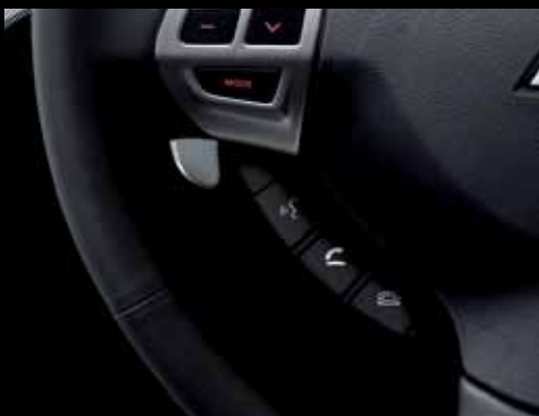
BLUETOOTH® PHONE CONNECTIVITY