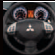
Steering wheel controls