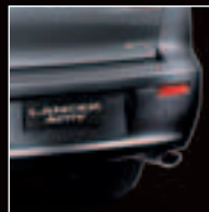
Chrome exhaust tip