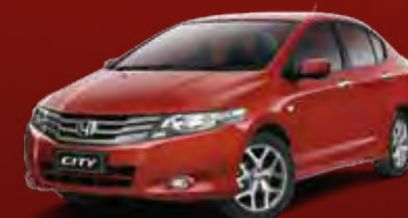
Habanero Red Pearlescent ^