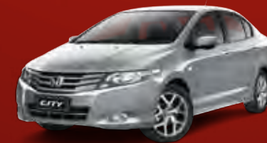
Alabaster Silver Metallic ^