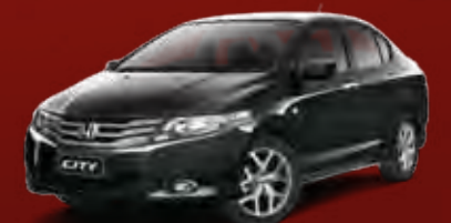
Crystal Black Pearlescent ^

^ Metallic/Pearlescent paint at extra cost.