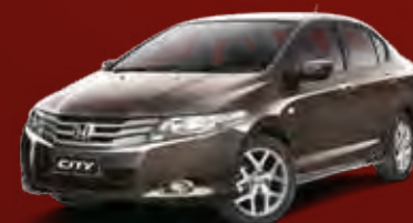
Urban Titanium Metallic ^