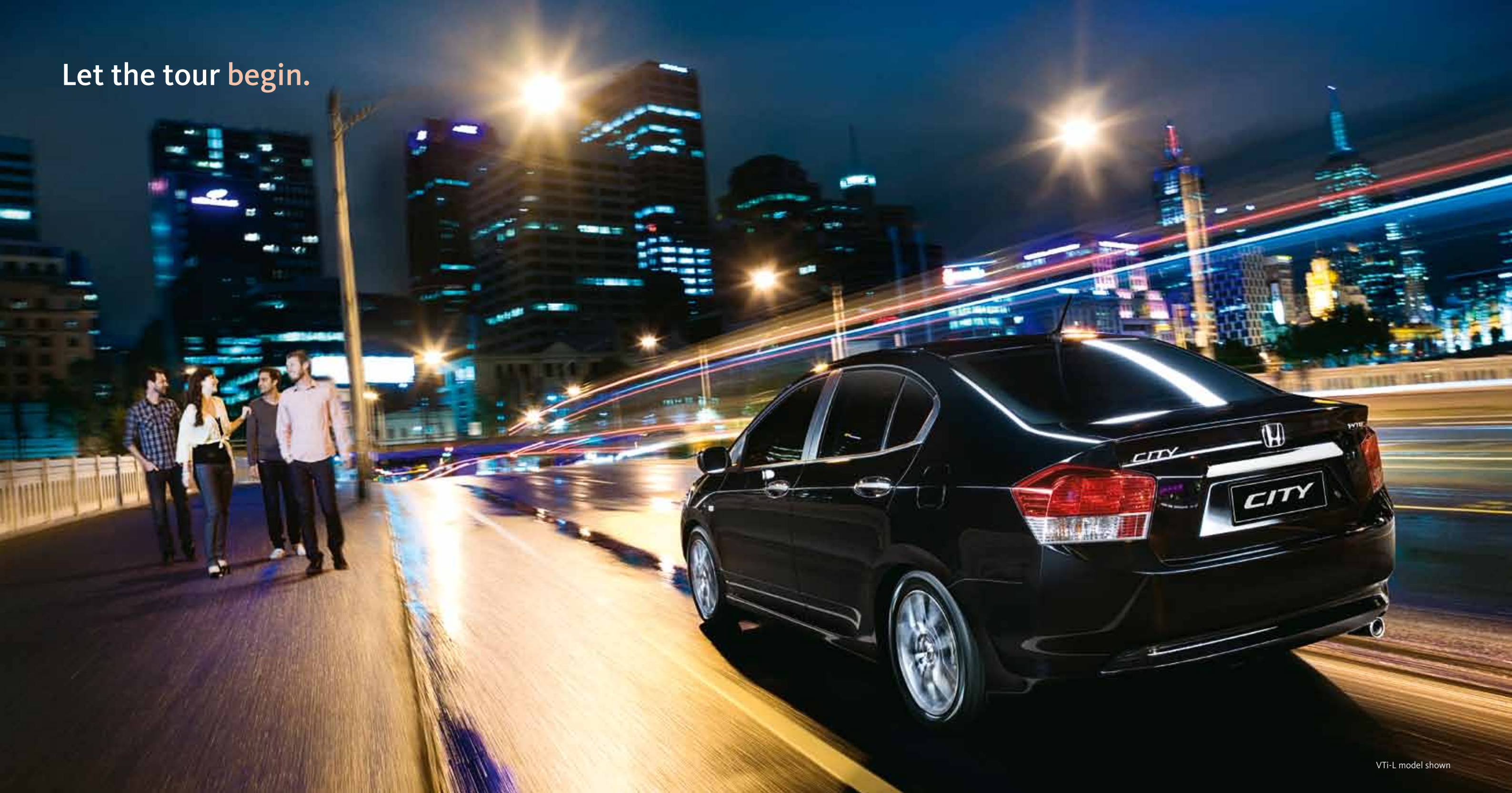
VTi-L model shown

Cities – really great ones, anyway – make you giddy. They cram the best of all worlds together. Energy, excitement, sophistication and style collide. Welcome to the Honda City. Whether you choose the VTi or VTi-L model, the 5-speed manual or 5-speed automatic transmission, one thing will become instantly and abundantly clear; this is no ordinary car. It's a smart new way.