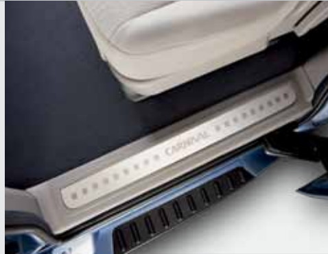
Door scuff plate set