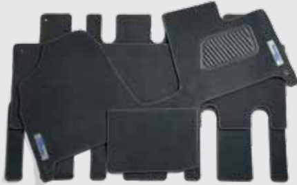
Tailored mat set