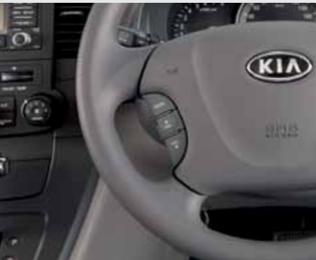
Steering wheel audio controls