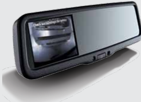
Reverse camera with ECM rear view display