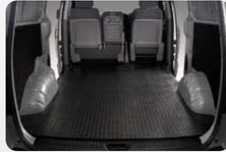
Rubber Cargo Mat