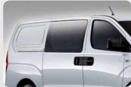
Sliding Door Windows