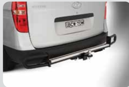
Rear Step with Corner Protectors 2