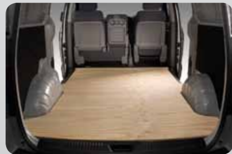
Courier's Wooden Floor