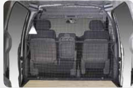
Cargo Barrier (60kg rating)

Importantly, Hyundai Genuine Accessories are an astute way to help keep your new iLoad in original showroom condition and further enhance its already high levels of built-in occupant safety.