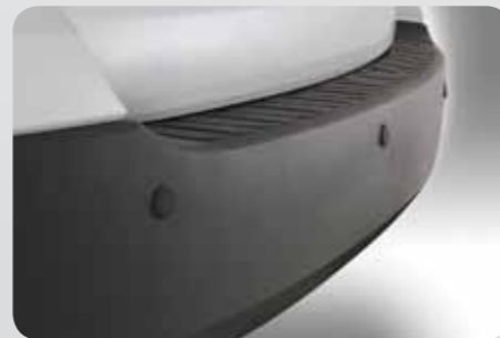
Rear Park Assist (4 head) 3