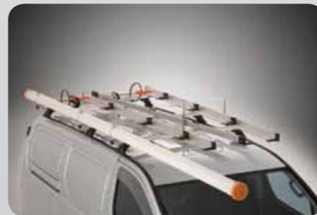
Full Technician Kit

Some images featured are included for illustration purposes only.