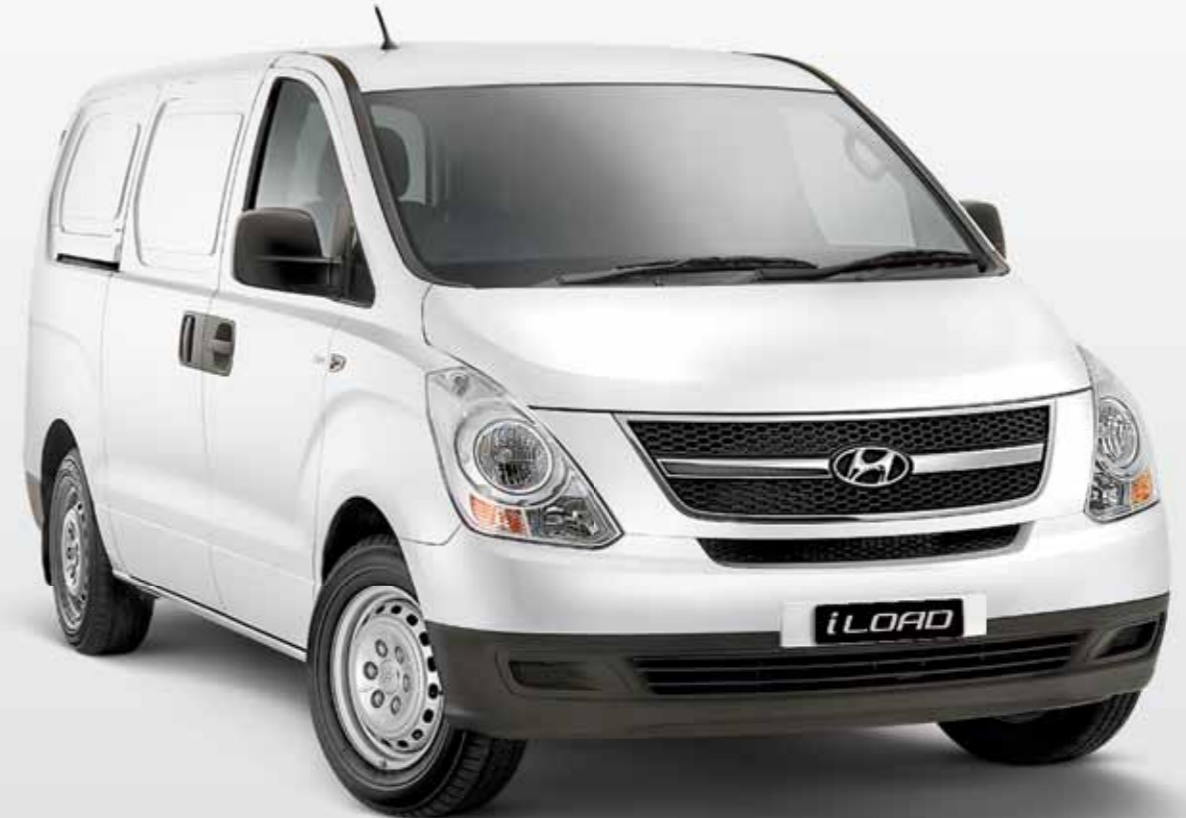
iLoad 3 seat 2.4 litre petrol van featured above in Ceramic White.