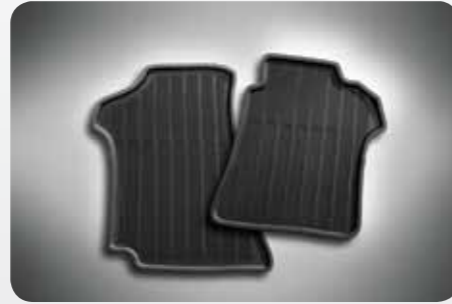
Tailored Rubber Floor Mats