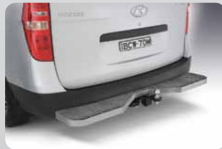
Technician Step (Towbar compatible) 2