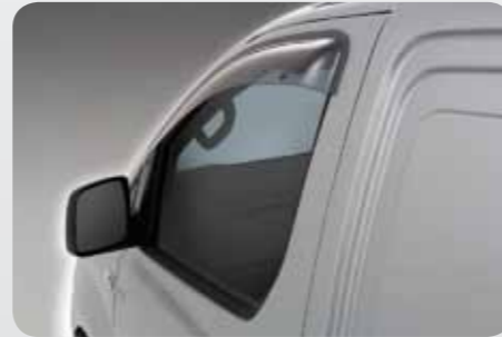
Tinted Stylevisors (front pair only)