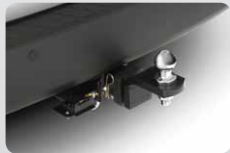
Towbar, Towball & Trailer Wiring Harness 1