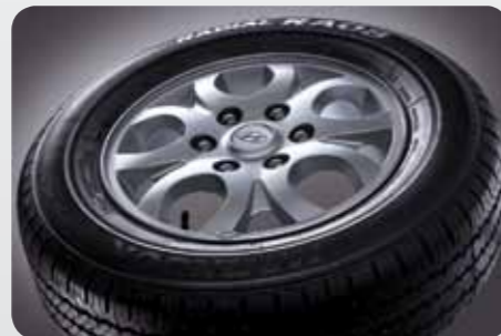
16" Alloy Wheels (sold singularly)