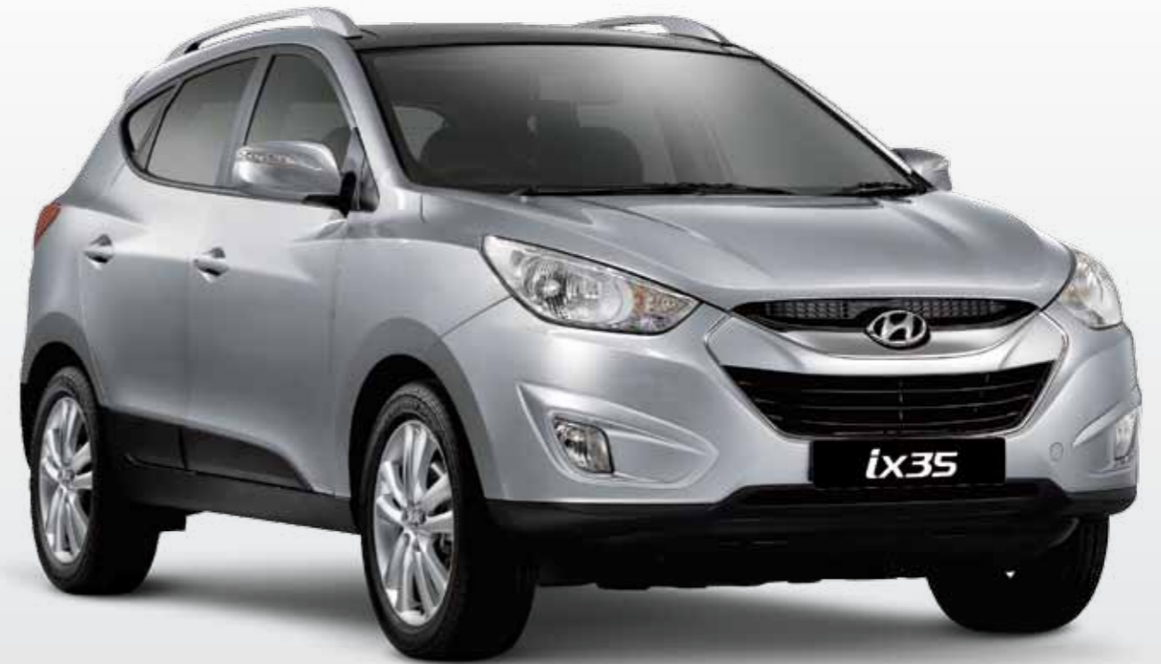
Highlander model shown in Sleek Silver.

Hyundai ix35 Active featured above in Vanilla White is accessorised with Hyundai Genuine Whipbar™ Quiet Roof Racks, Surfboard Carrier, Tinted Stylevisors (set of 4), Headlight Protectors (set of 2), Bonnet Protector, Front Park Assist 1 (2 head or 4 head), Alloy Nudge Bar (with Driving Light Mounting Brackets) Side Steps and 17" Alloy Wheels (sold singularly, rubber not included). All sold separately at additional cost. Surfboard not included.