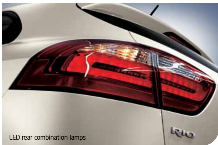
LED rear combination lamps