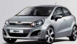
Bright Silver (Premium)