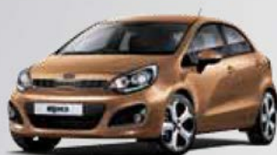
Rich Caramel (Premium)