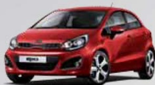
Signal Red (Premium)