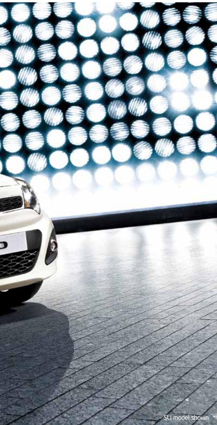
SLi model shown