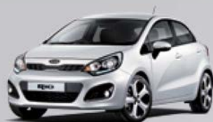
Clear White (Solid)