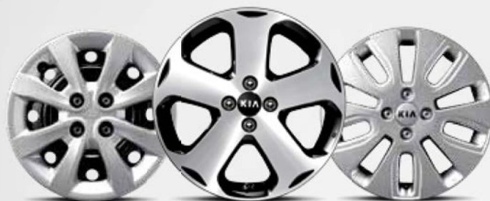
15-inch Steel Wheel (S model)