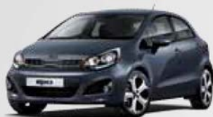
Deep Blue (Premium)