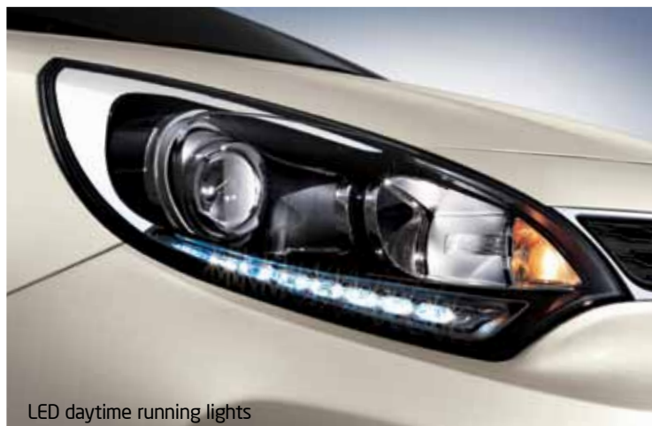
LED daytime running lights