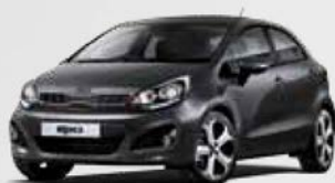
Midnight Black (Premium)