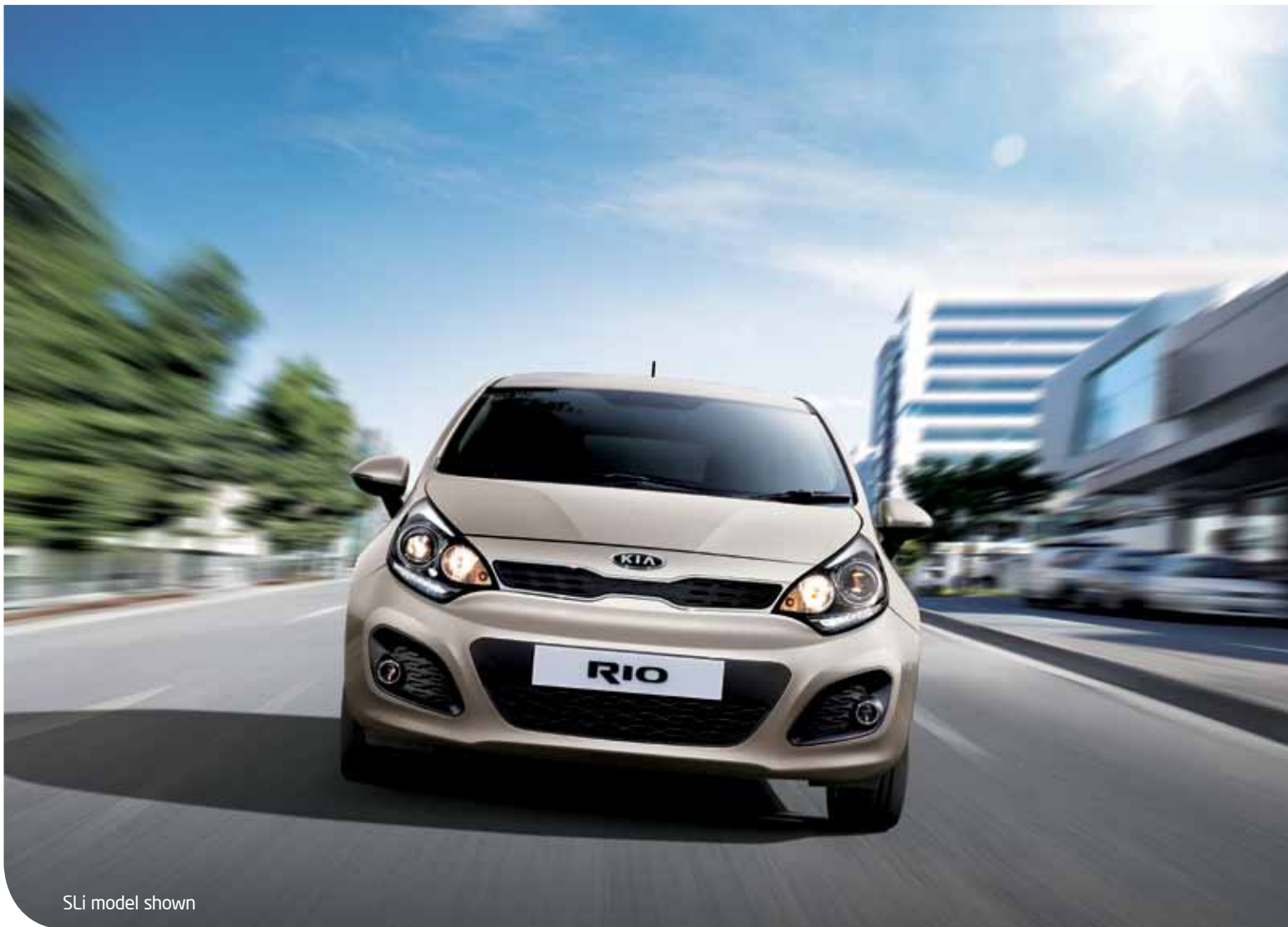
SLi model shown

As you see, what you do on a small scale with your household recycling, we at Kia Motors do on a large scale around the world.