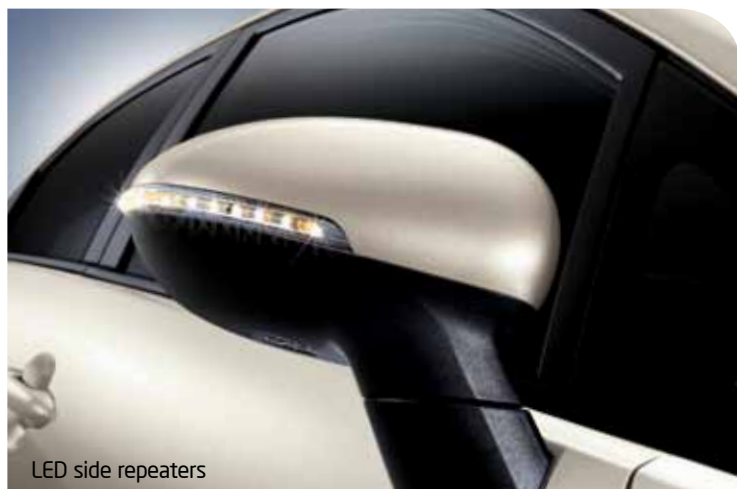
LED side repeaters