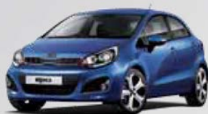
Electric Blue (Premium)