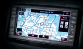
Mitsubishi Multi Communication System