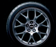
18" BBS forged aluminium wheels