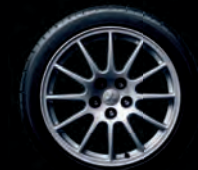
18" ENKEI alloy wheels