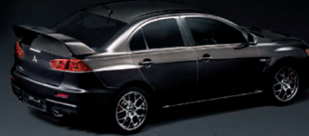
Phantom Black (M)