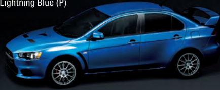
Lightning Blue (P)