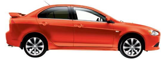
ORANGE BURST (M)