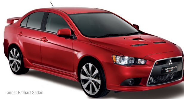
Lancer Ralliart Sedan