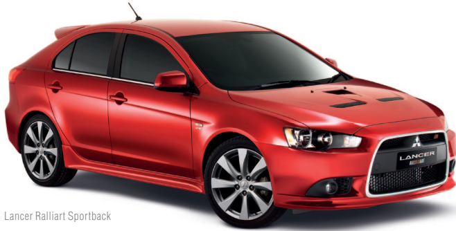
Lancer Ralliart Sportback