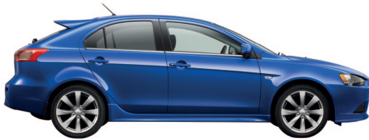
LIGHTNING BLUE (P)

A range of fashionable and sporty colours to allow you to personalise your Ralliart sportback or sedan.