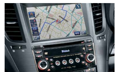
MCINTOSH ENTERTAINMENT SYSTEM: Liberty 2.5i Sports Premium, Liberty 2.5 GT Premium and Liberty 3.6R Premium