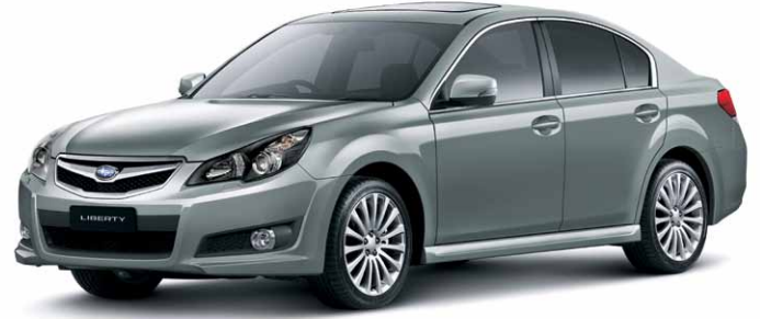
SAGE GREEN METALLIC