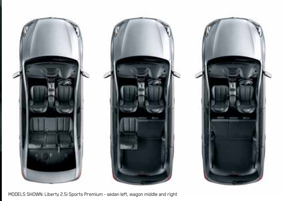
MODELS SHOWN: Liberty 2.5i Sports Premium - sedan left, wagon middle and right

CLOCKWISE: →REAR SEAT ARMREST WITH BOOT ACCESS - SEDAN MODELS. →SEAT BACK NETS. →REAR ARMREST WITH CUPS HOLDERS. →WAGON FEATURES 60:40 SPLIT REAR SEATS FOR A RANGE OF PASSENGER AND CARGO CONFIGURATIONS. FOLD DOWN ONE SEAT OR THE ENTIRE SECOND ROW.