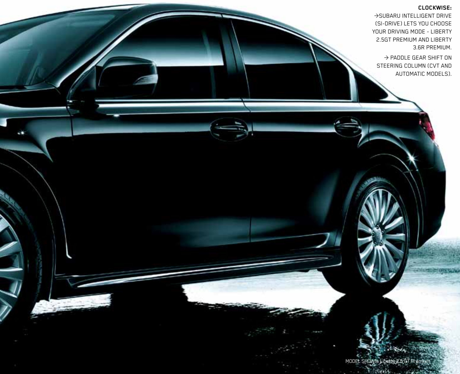
MODEL SHOWN: Liberty 2.5GT Premium