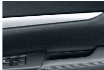
SILVER: Liberty 2.5i and Liberty 2.5i Premium