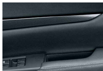
CARBON FIBRE: Liberty 2.5i Sports Premium and Liberty 2.5 GT Premium