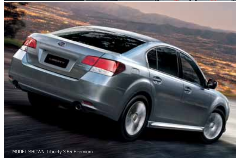
MODEL SHOWN: Liberty 3.6R Premium

To drive Liberty is to rediscover the joy of driving and understand why the open road never closes. The confidence comes from Subaru's superior driving technologies, which deliver a balanced drive and solid footing in a range of conditions.