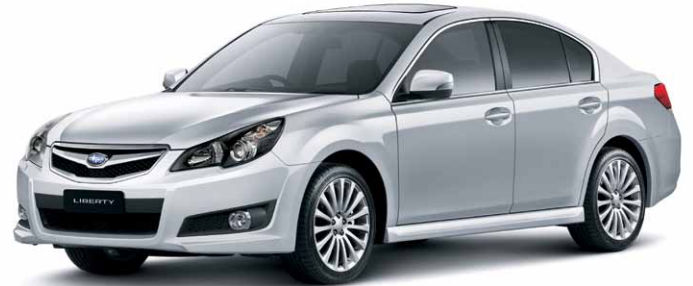
ICE SILVER METALLIC