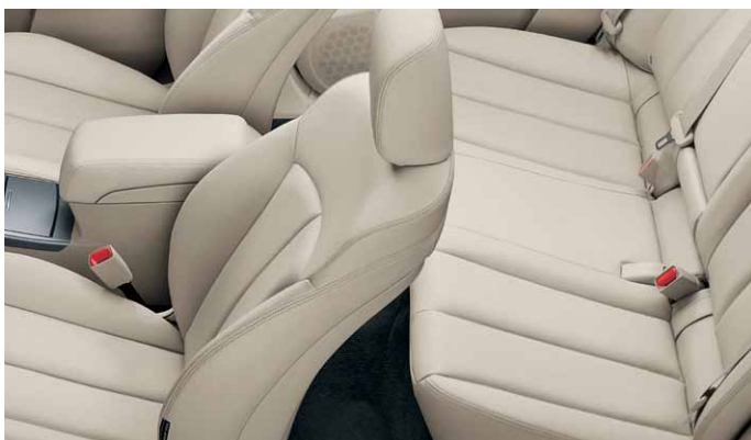
IVORY 1 : Liberty 3.6R Premium models only 1. Leather seats: Standard on all Liberty models.