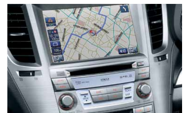
MULTI-INFORMATION IN-DASH SATELLITE NAVIGATION SYSTEM: Liberty 2.5i Premium