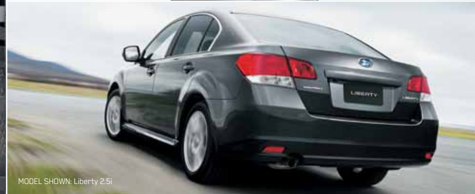
MODEL SHOWN: Liberty 2.5i

Contemporary style and quality design come together in the Liberty sedan. Its bold appearance is enhanced by flared wheel arches, sporty side spoilers, eye-catching alloy wheels, sporty tail pipe cover and a deeply sculpted bonnet. While the rear doors with privacy glass let you make your escape incognito.