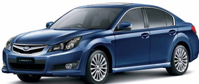
GALAXY BLUE SILICA