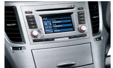
SINGLE IN-DASH CD AUDIO UNIT: Liberty 2.5i