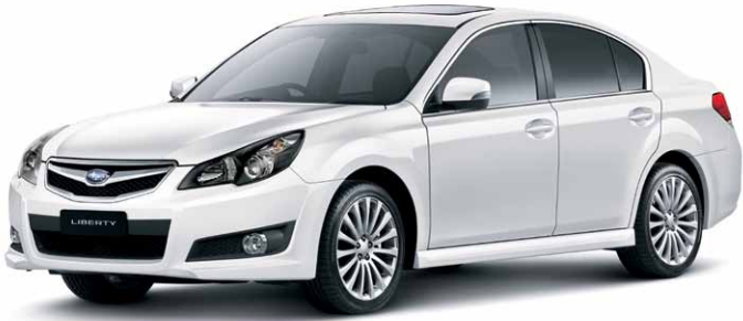
SATIN WHITE PEARL

All colours available in sedan and wagon models.