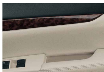
WOODGRAIN: Liberty 3.6R Premium