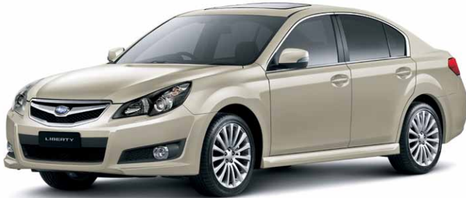
SUNLIGHT GOLD OPAL