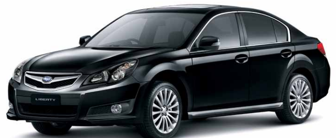
CRYSTAL BLACK SILICA