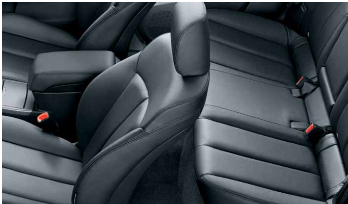
BLACK 1 : All Liberty models