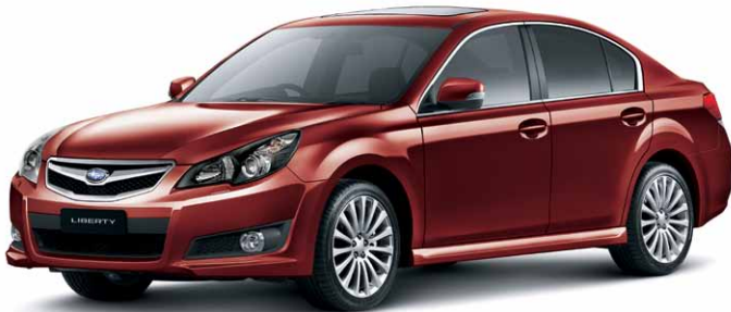
CAMELLIA RED PEARL