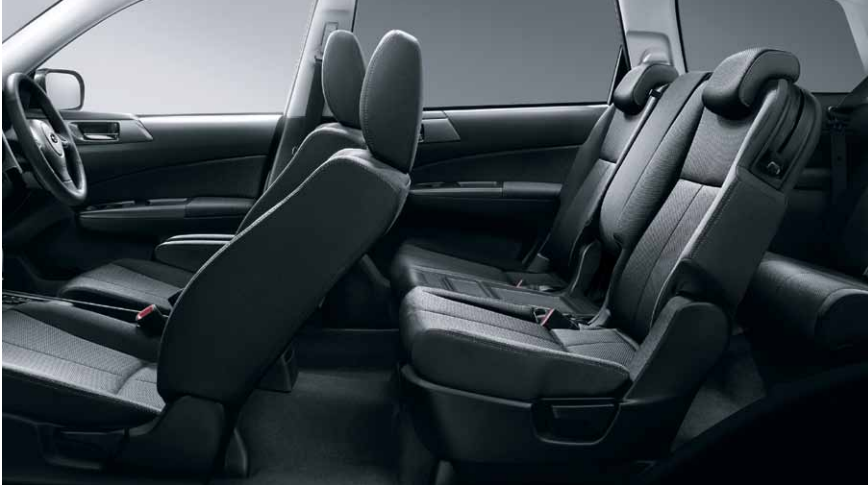
BLACK: CLOTH - Liberty Exiga 2.5i