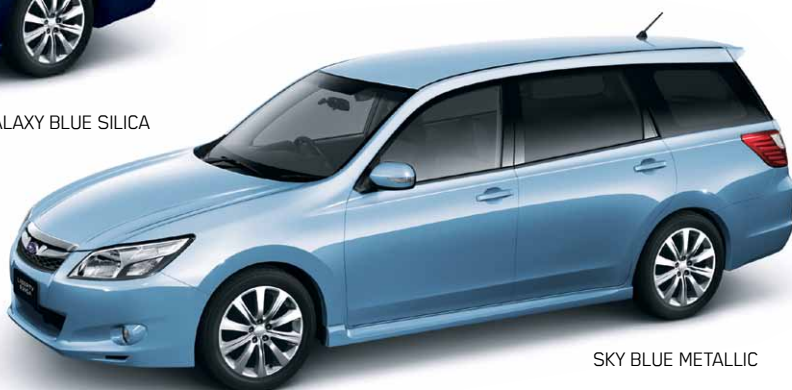
SKY BLUE METALLIC