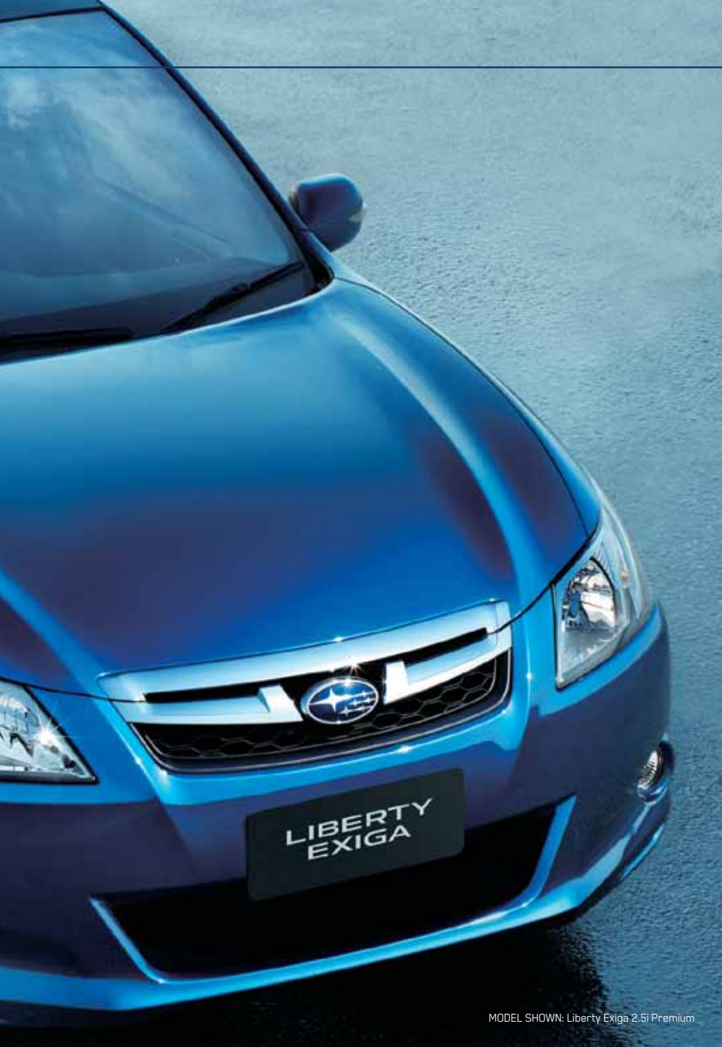
MODEL SHOWN: Liberty Exiga 2.5i Premium