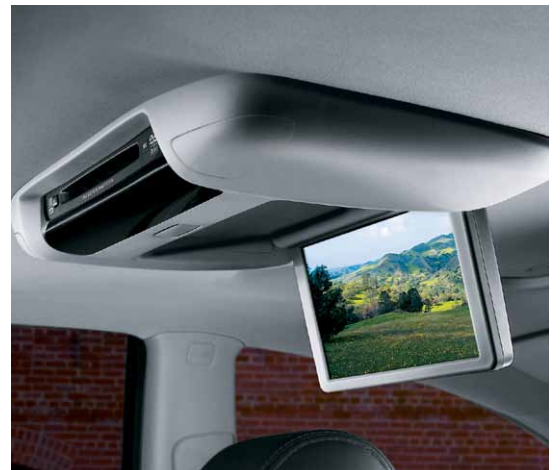
REAR DVD ENTERTAINMENT SYSTEM: Liberty Exiga 2.5i and Liberty Exiga 2.5i Premium