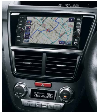
MULTI-INFORMATION IN-DASH SATELLITE NAVIGATION SYSTEM: Liberty Exiga 2.5i Premium