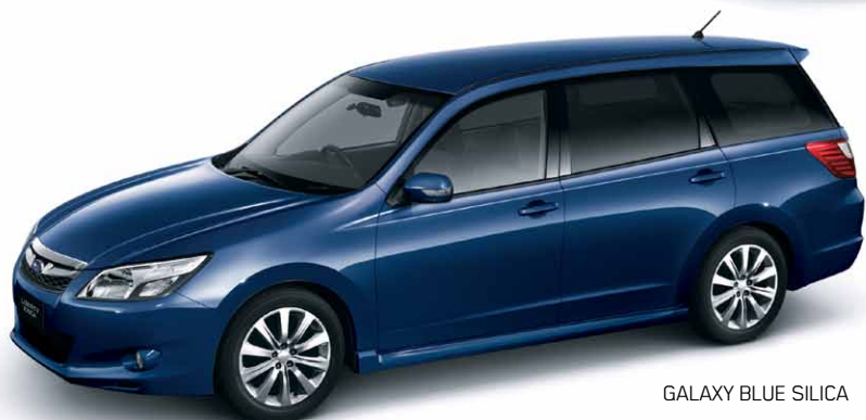
GALAXY BLUE SILICA