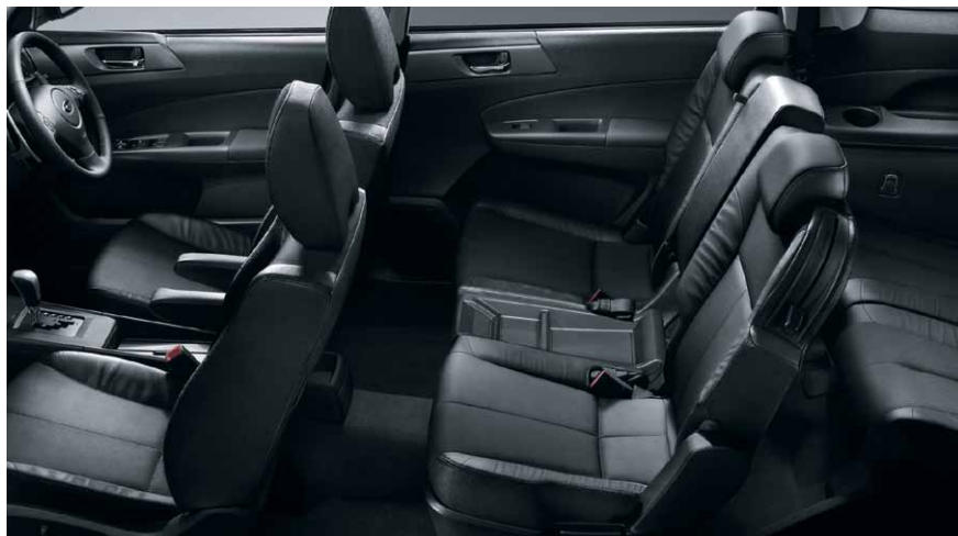
BLACK: LEATHER - Liberty Exiga 2.5i Premium