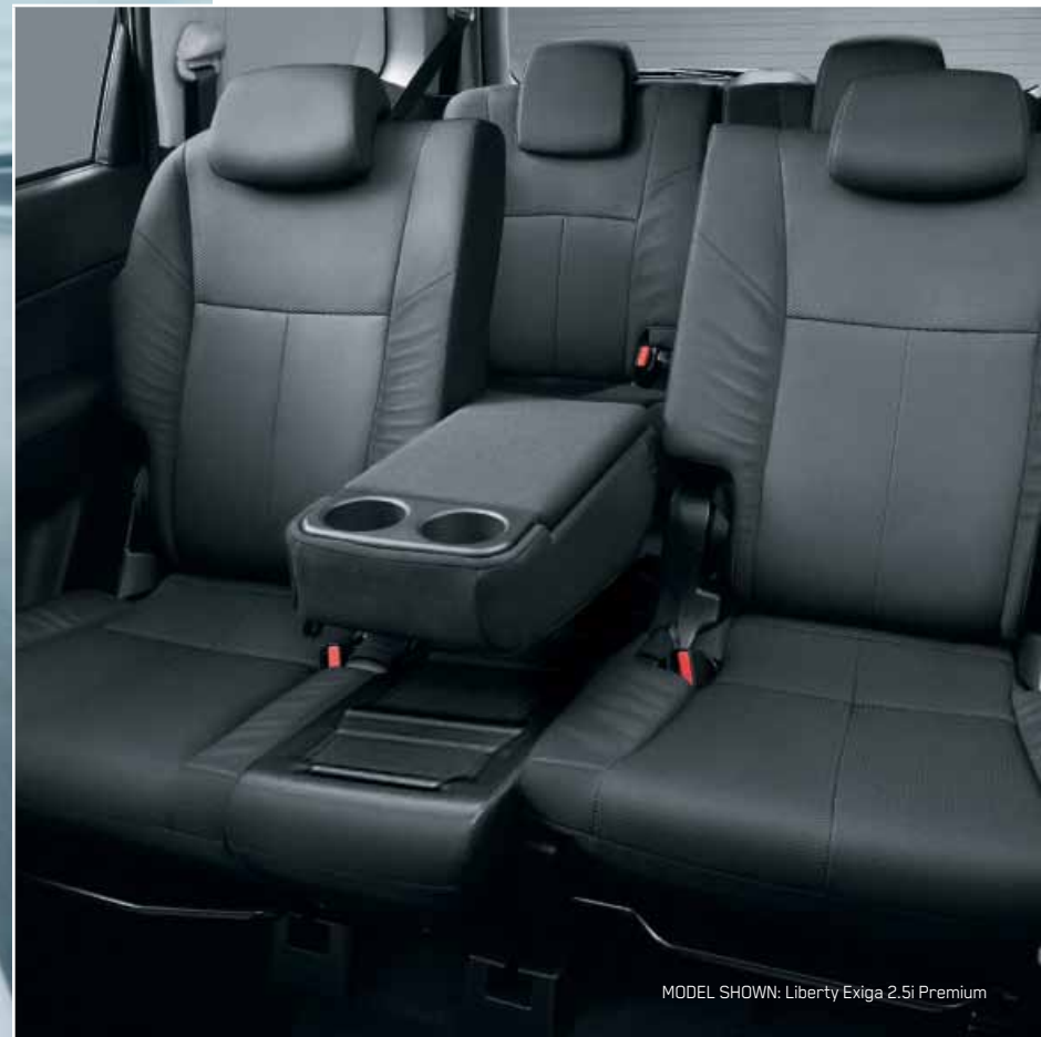
MODEL SHOWN: Liberty Exiga 2.5i Premium

HIT THE ROAD. YOU DON'T NEED AN ITINERARY. YOU DON'T NEED A MAP. THE ESCAPE VEHICLE OF CHOICE IS THE SUBARU LIBERTY EXIGA. A LUXURIOUS SIX SEAT CAR COMBINING STYLE, LUXURY AND THE SPACE YOU NEED TO SET YOUR OWN SCHEDULE.