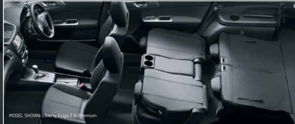
MODEL SHOWN: Liberty Exiga 2.5i Premium