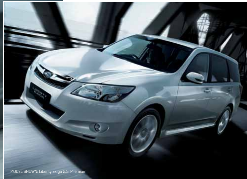
MODEL SHOWN: Liberty Exiga 2.5i Premium

THE LIBERTY EXIGA'S OUTSTANDING PERFORMANCE AND SAFETY CREDENTIALS ARE UNDERPINNED BY OUR RENOWNED SYMMETRICAL ALL-WHEEL DRIVE, SIGNATURE HORIZONTALLY-OPOSED BOXER ENGINE AND VEHICLE DYNAMICS CONTROL SYSTEM.