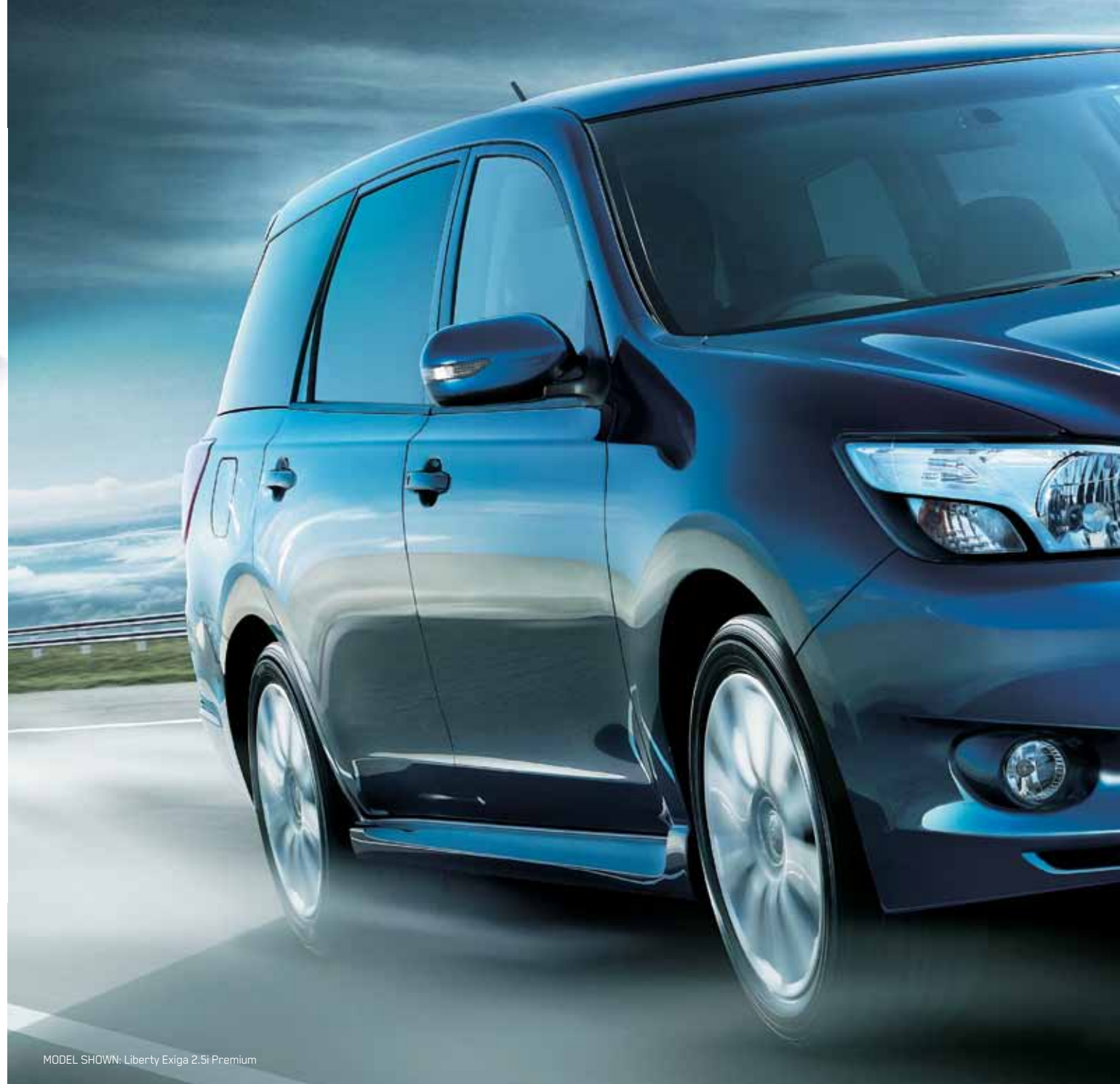
MODEL SHOWN: Liberty Exiga 2.5i Premium

For you, the driver, it all adds up to an agile and responsive vehicle with optimum balance, control and confidence in a variety of driving conditions.