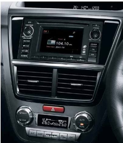
SINGLE IN-DASH CD PLAYER: Liberty Exiga 2.5i