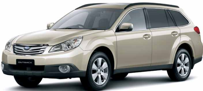
SUNLIGHT GOLD OPAL