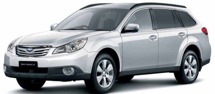
ICE SILVER METALLIC