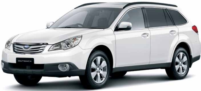
SATIN WHITE PEARL

One of the final choices - but one of the most important! The colour you choose for your Outback makes a bold statement about who you are. So we've made sure you've got lots of ways to express yourself - with a wide range of colours to make your Outback more... you.