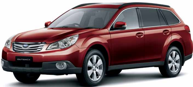
CAMELLIA RED PEARL