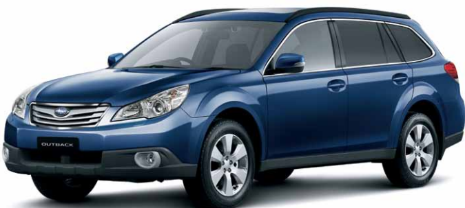
GALAXY BLUE SILICA