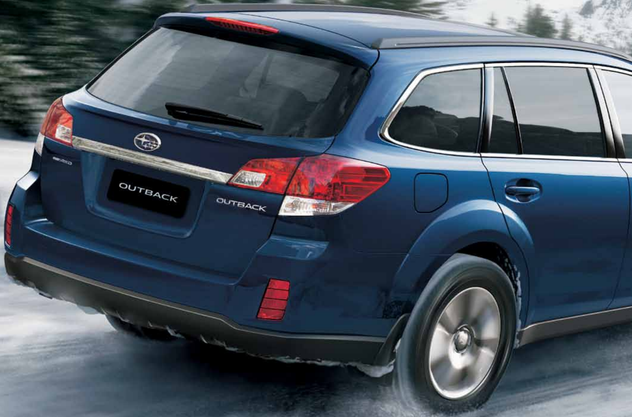
MODEL SHOWN: Outback 2.5i Premium