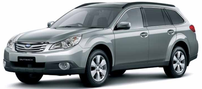
SAGE GREEN METALLIC