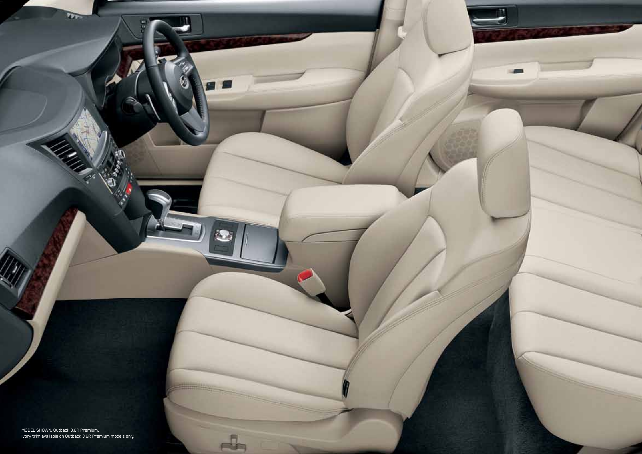
MODEL SHOWN: Outback 3.6R Premium. Ivory trim available on Outback 3.6R Premium models only.