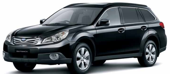
CRYSTAL BLACK SILICA