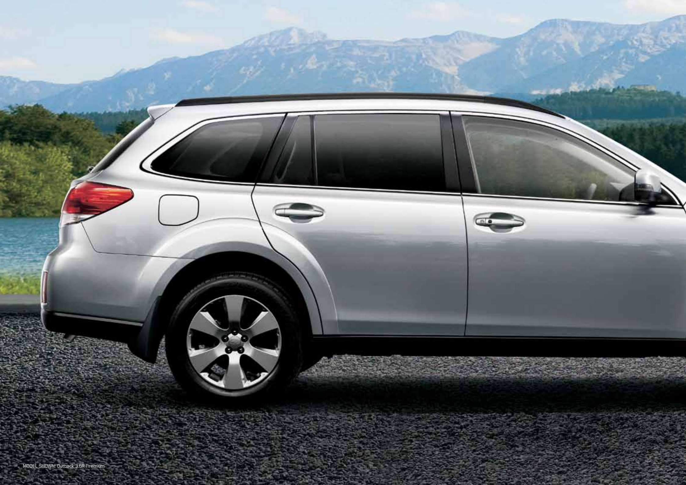
MODEL SHOWN: Outback 3.6R Premium