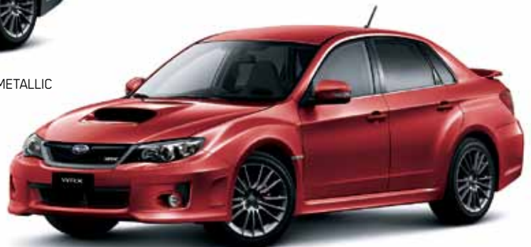
LIGHTNING RED 1