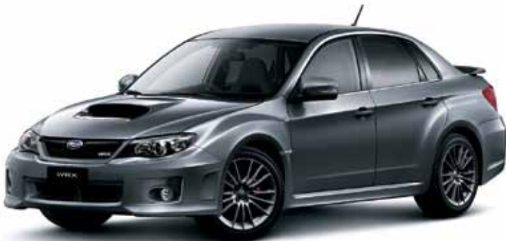
DARK GREY METALLIC