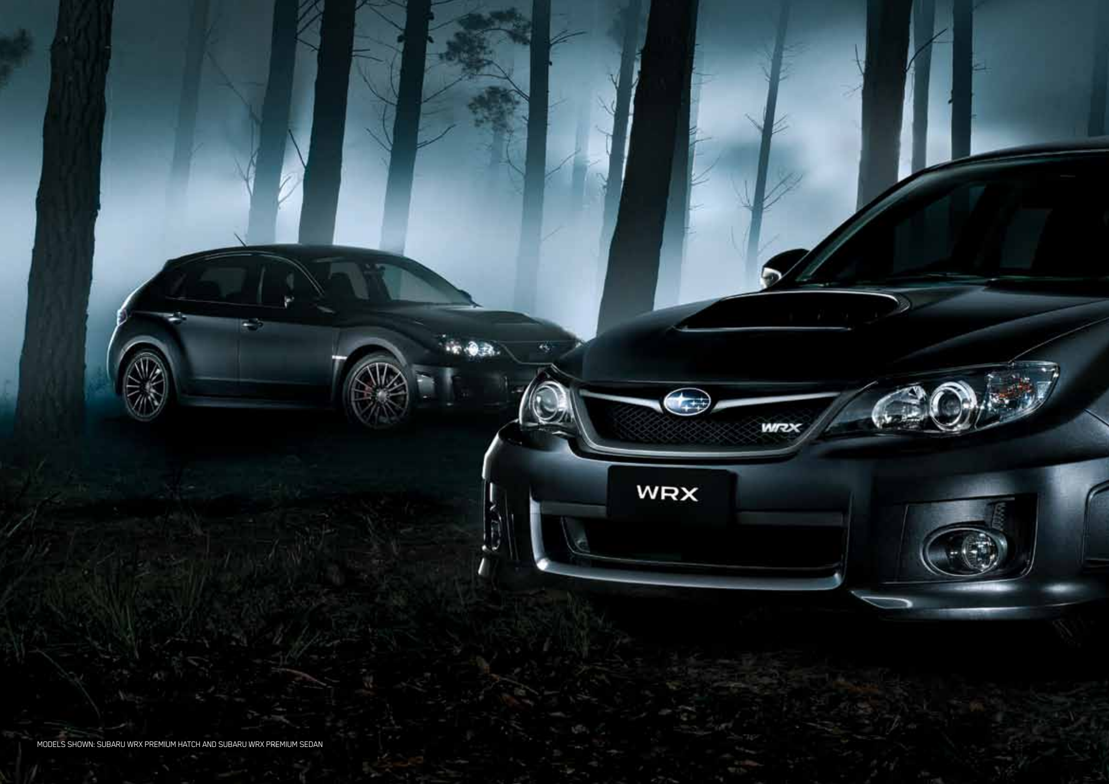
MODELS SHOWN: SUBARU WRX PREMIUM HATCH AND SUBARU WRX PREMIUM SEDAN