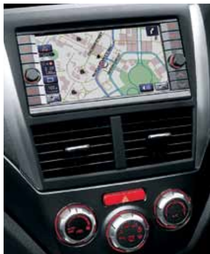
MULTI-INFORMATION IN-DASH SATELLITE NAVIGATION SYSTEM: SUBARU WRX PREMIUM