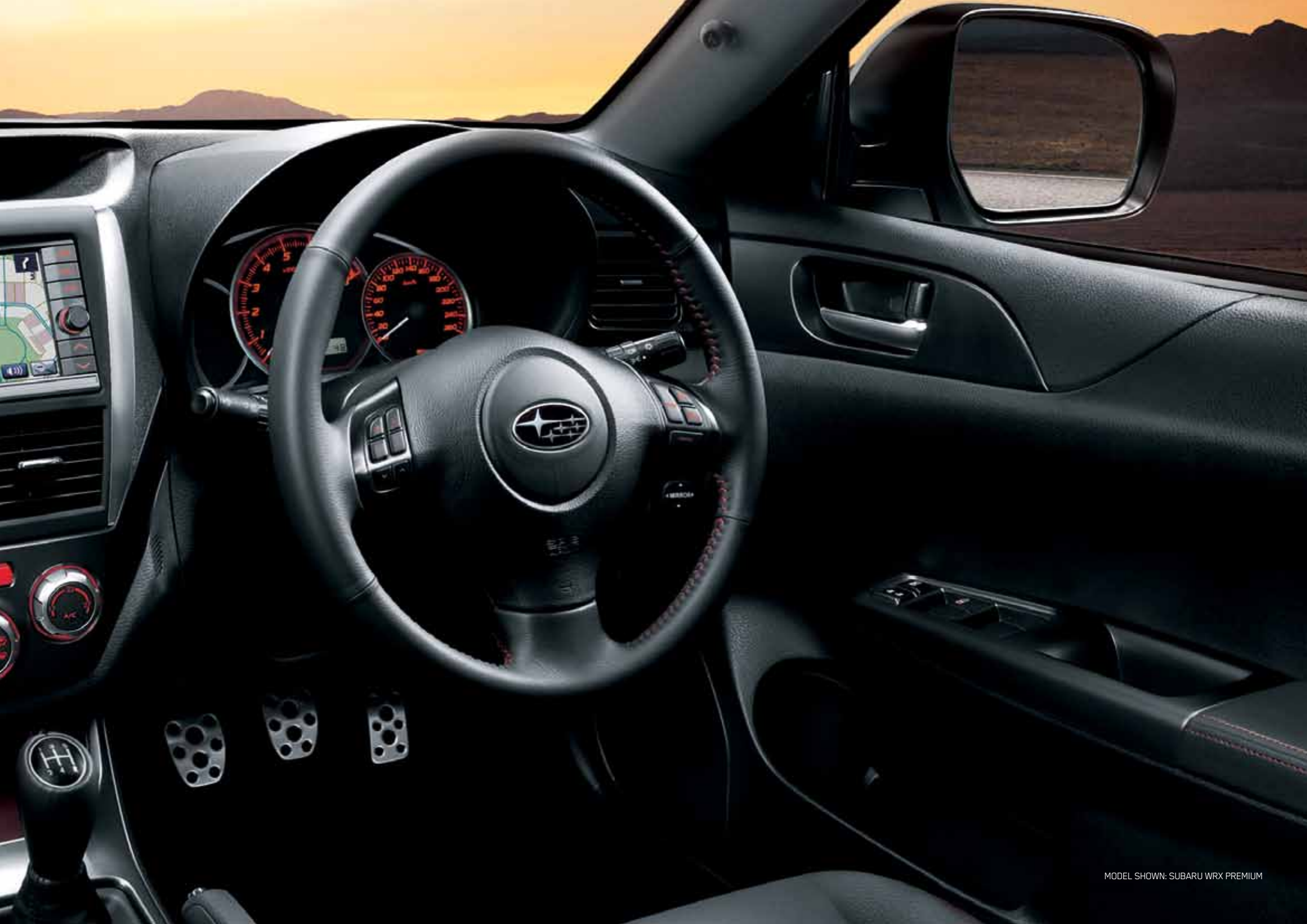
MODEL SHOWN: SUBARU WRX PREMIUM