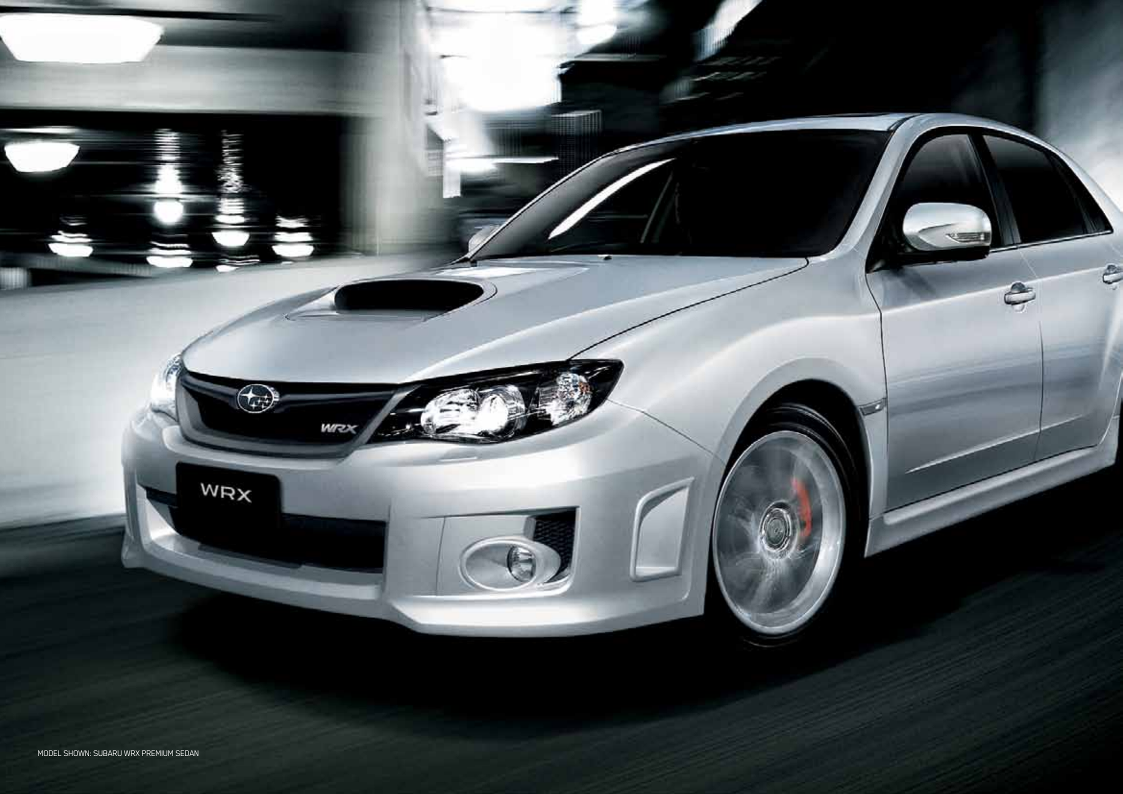
MODEL SHOWN: SUBARU WRX PREMIUM SEDAN