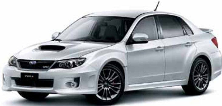
ICE SILVER METALLIC

Below colours are available as at February 2012, however available colours may change in the future. Always check with your authorised Subaru Retailer regarding colour availability of your selected model before purchase.