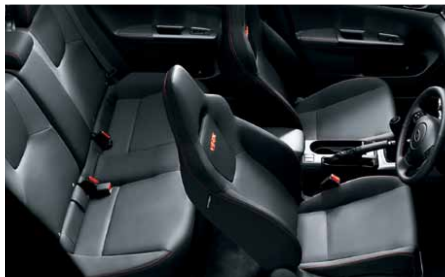
BLACK LEATHER: SUBARU WRX PREMIUM