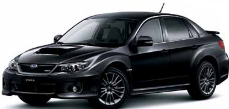
OBSIDIAN BLACK PEARL