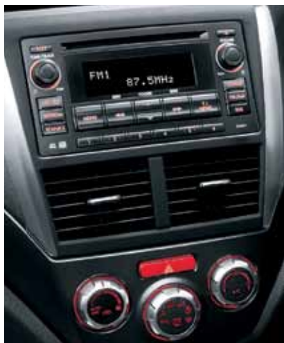
SINGLE IN-DASH CD PLAYER: SUBARU WRX