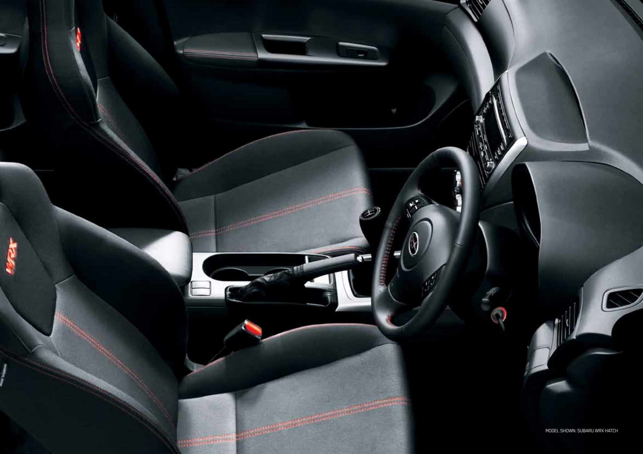
MODEL SHOWN: SUBARU WRX HATCH