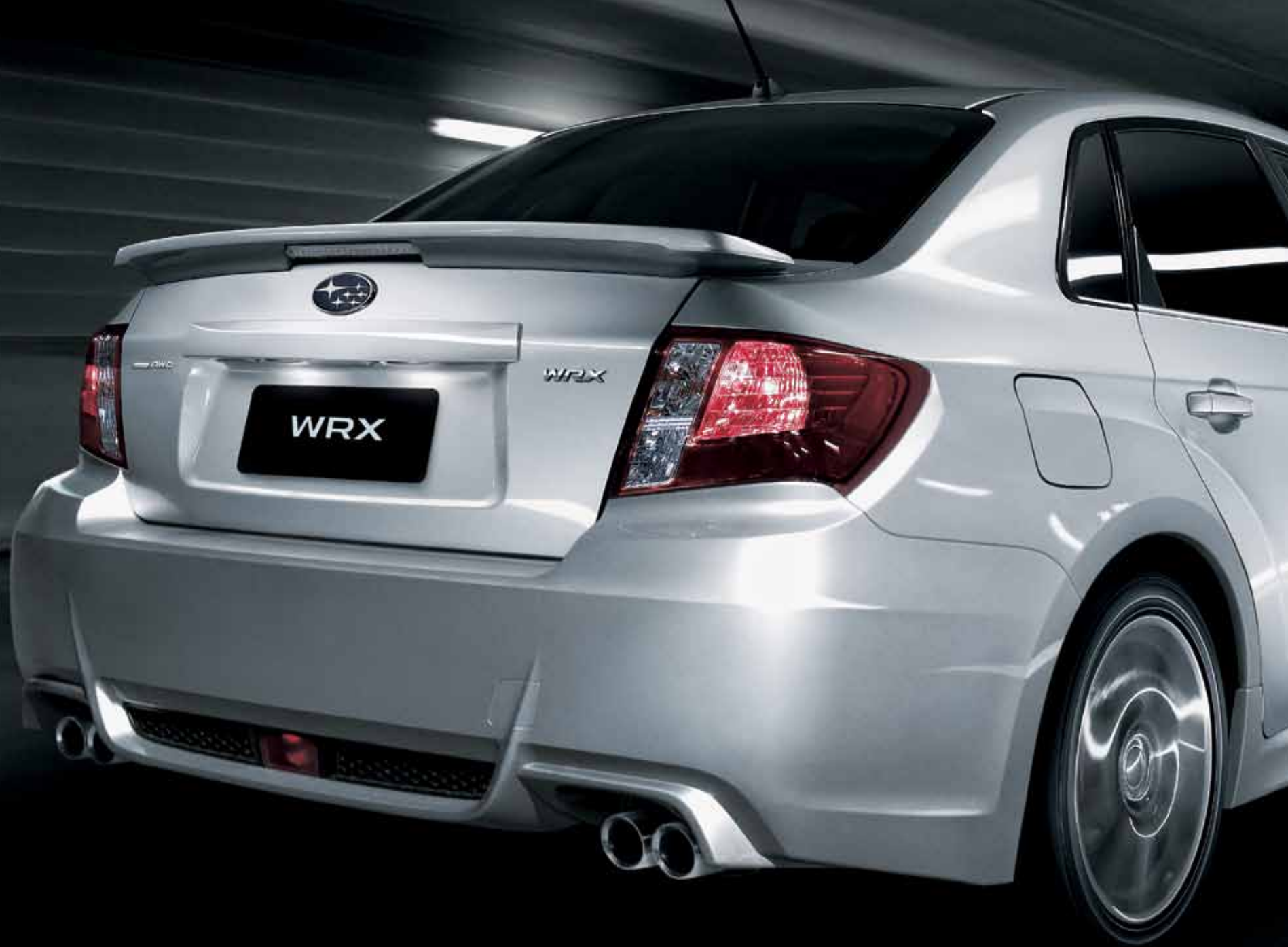
MODEL SHOWN: SUBARU WRX PREMIUM SEDAN