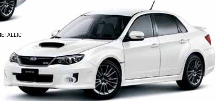
SATIN WHITE PEARL