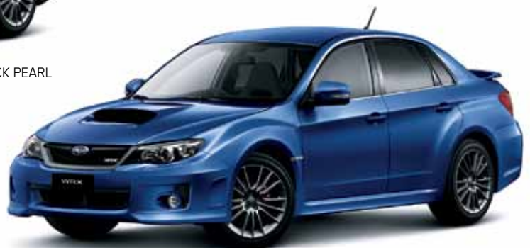
WR BLUE MICA