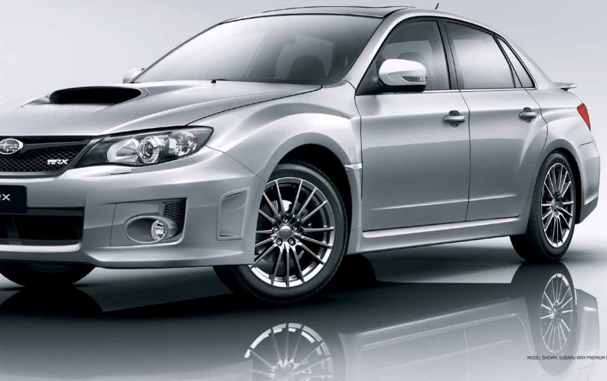
MODEL SHOWN: SUBARU WRX PREMIUM SEDAN