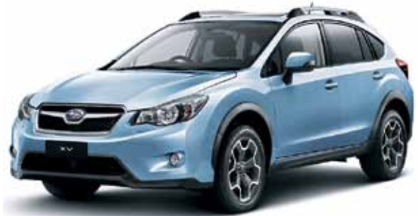
SKY BLUE METALLIC 1