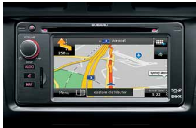
MULTI-INFORMATION IN-DASH SATELLITE NAVIGATION SYSTEM: SUBARU XV 2.0i-L AND SUBARU XV 2.0i-S