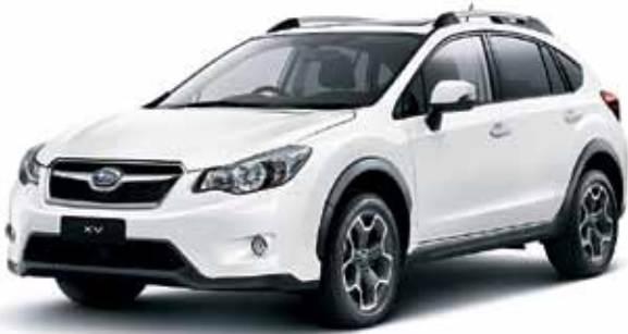
SATIN WHITE PEARL

Below colours are available as at February 2012, however available colours may change in the future. Always check with your authorised Subaru Retailer regarding colour availability of your selected model before purchase.