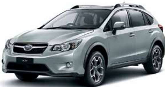
SAGE GREEN METALLIC