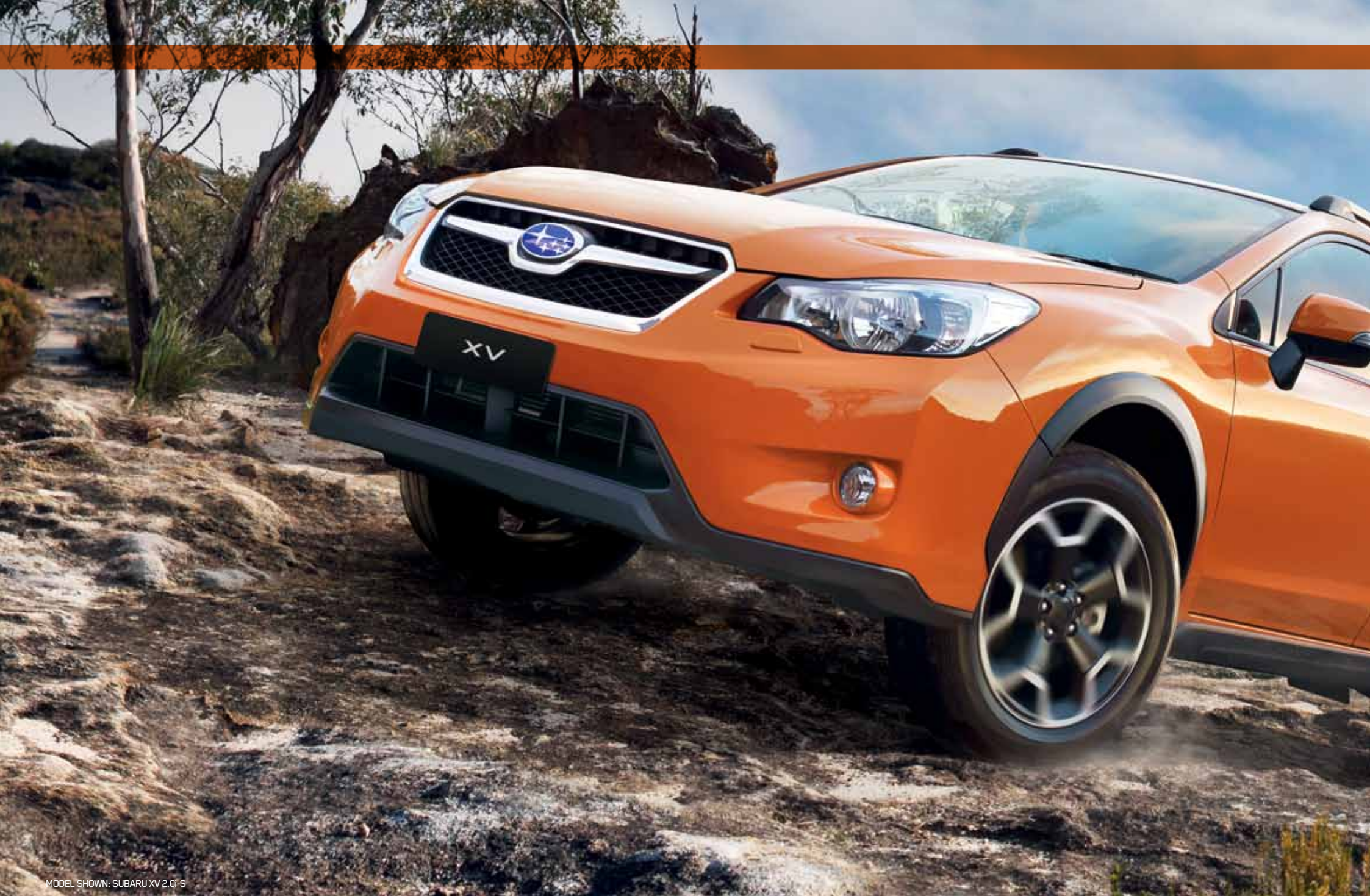
MODEL SHOWN: SUBARU XV 2.0i-S