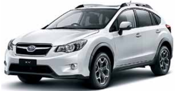
ICE SILVER METALLIC