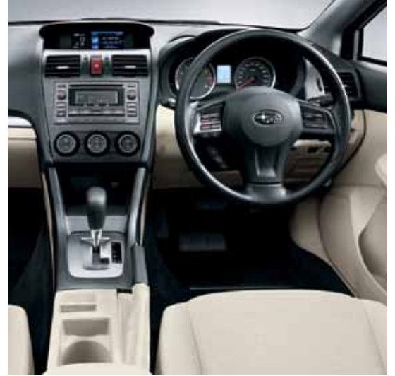
CLOTH: CHOICE OF BLACK OR IVORY: SUBARU XV 2.0i AND SUBARU XV 2.0i-L