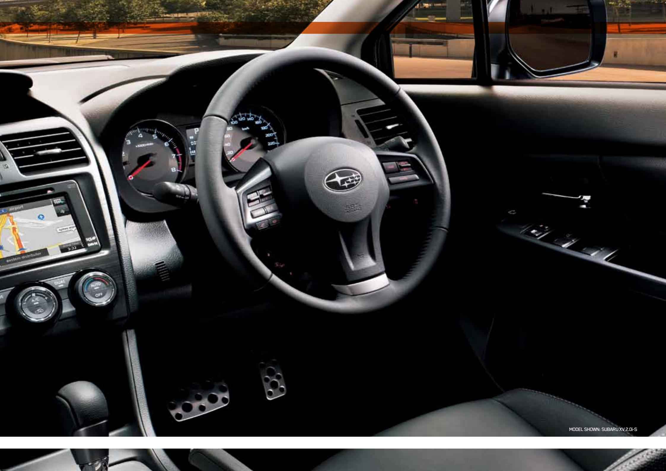
MODEL SHOWN: SUBARU XV 2.0i-S