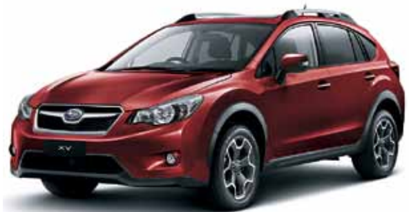
CAMELLIA RED PEARL