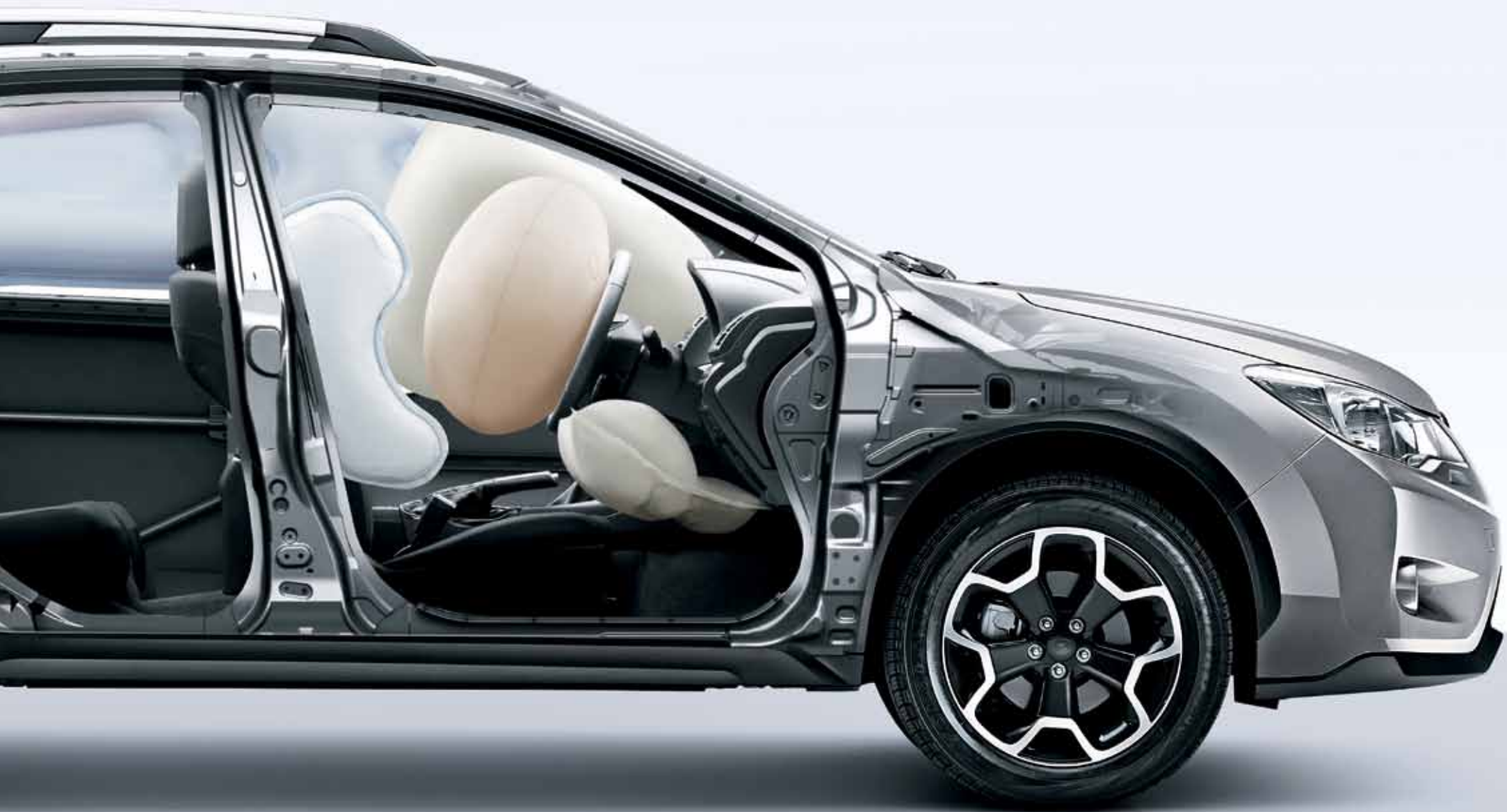
MODEL SHOWN: SUBARU XV 2.0i-S