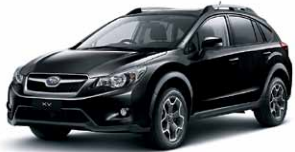
OBSIDIAN BLACK PEARL