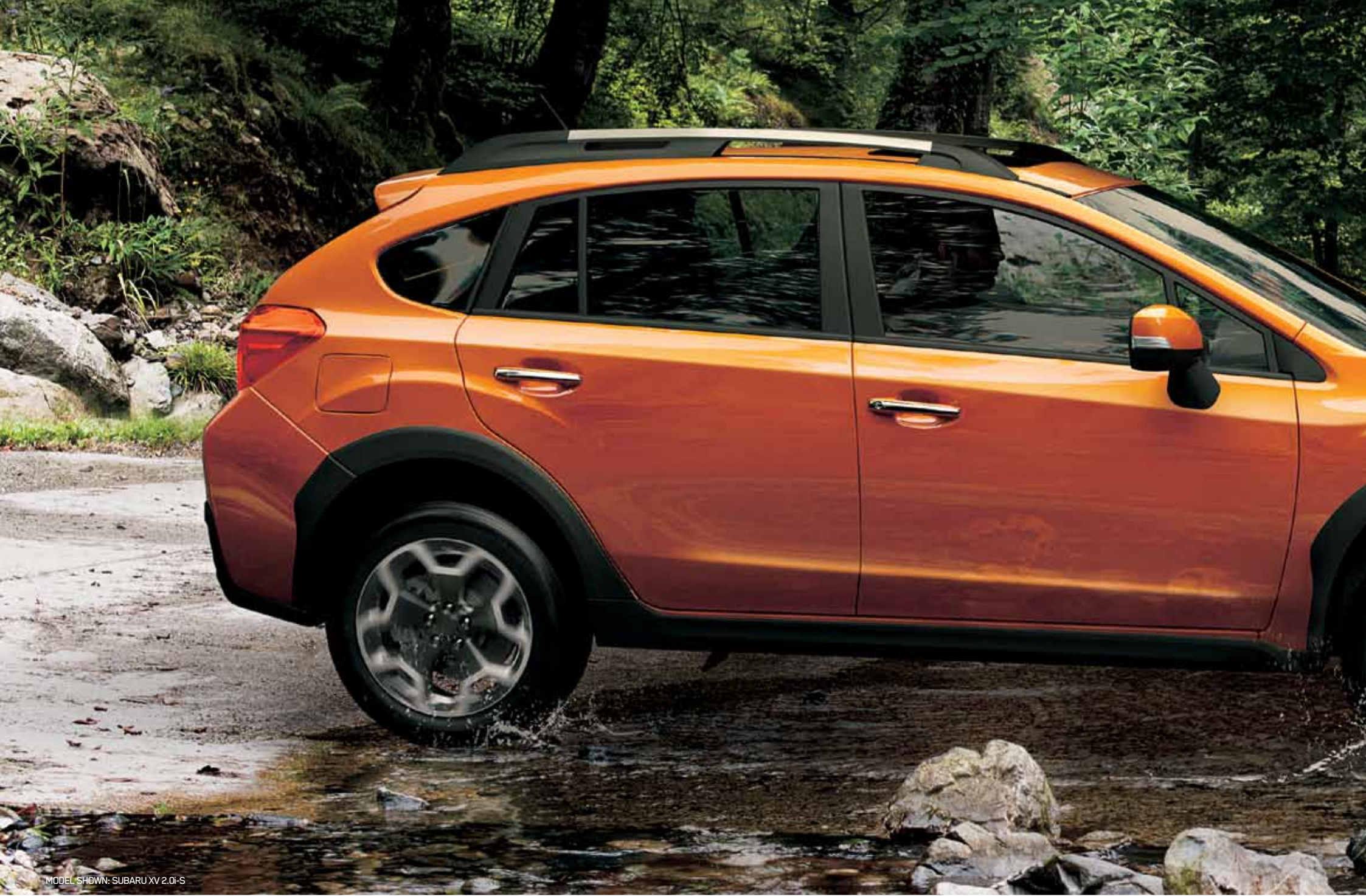
MODEL SHOWN: SUBARU XV 2.0i-S