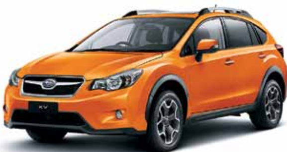
TANGERINE ORANGE PEARL