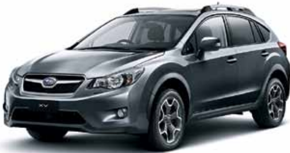
DARK GREY METALLIC