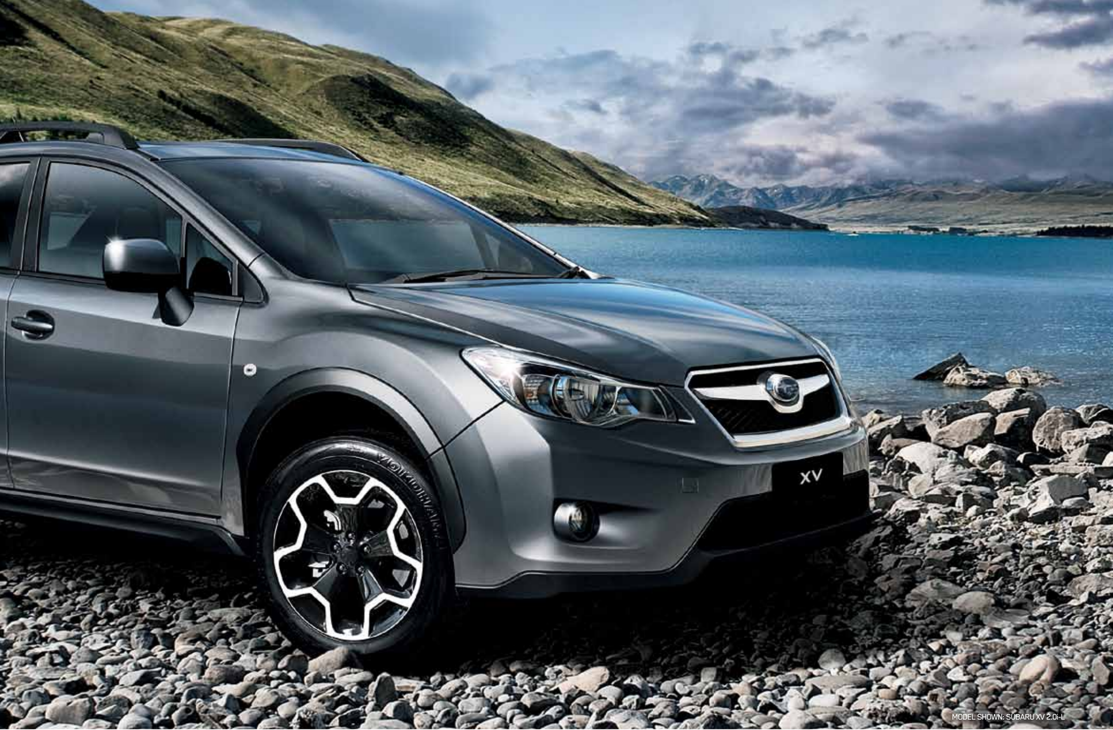
MODEL SHOWN: SUBARU XV 2.0i-L