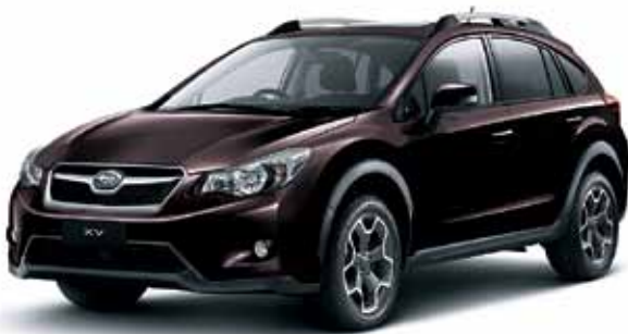
DEEP CHERRY PEARL