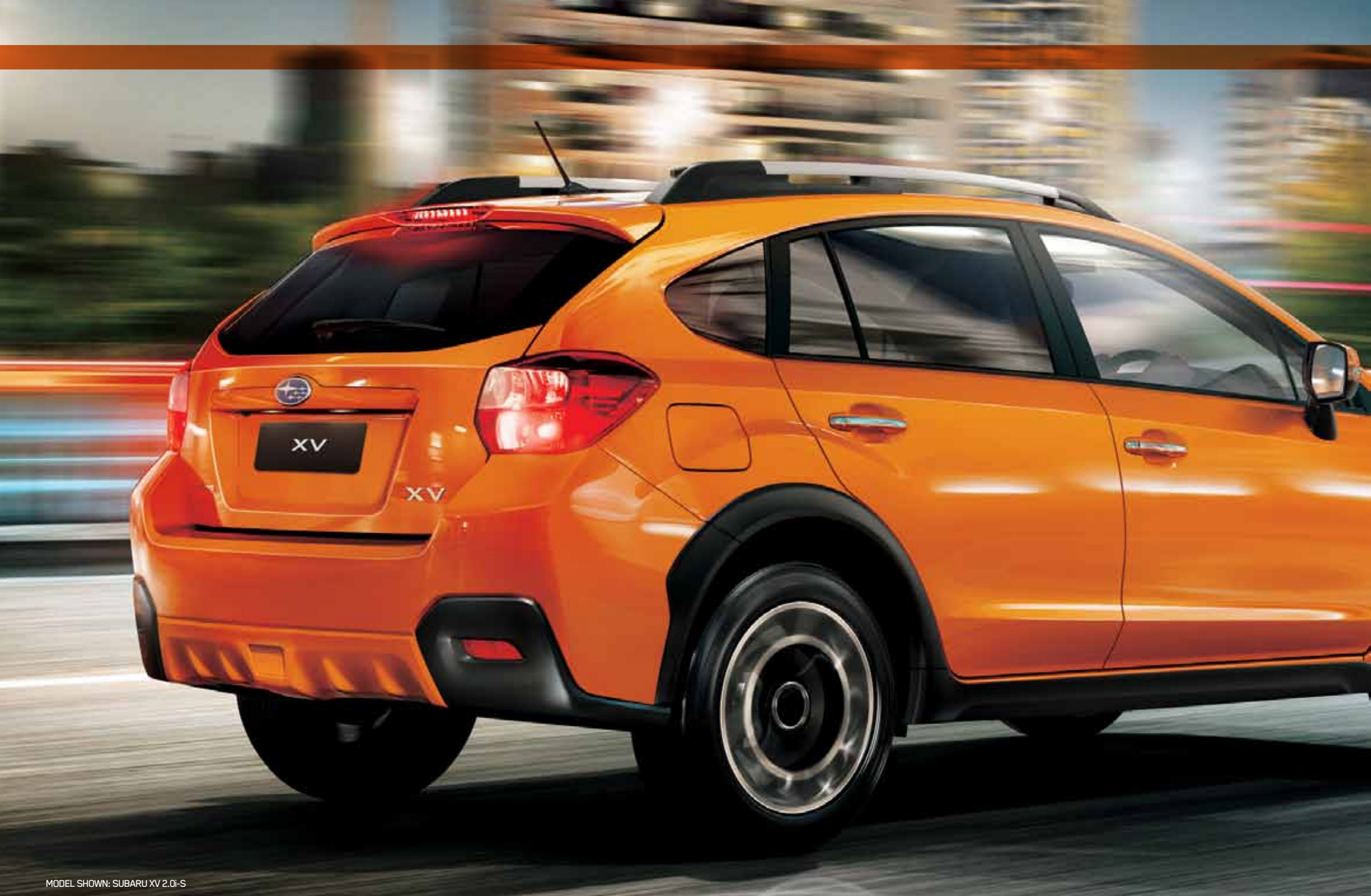
MODEL SHOWN: SUBARU XV 2.0i-S