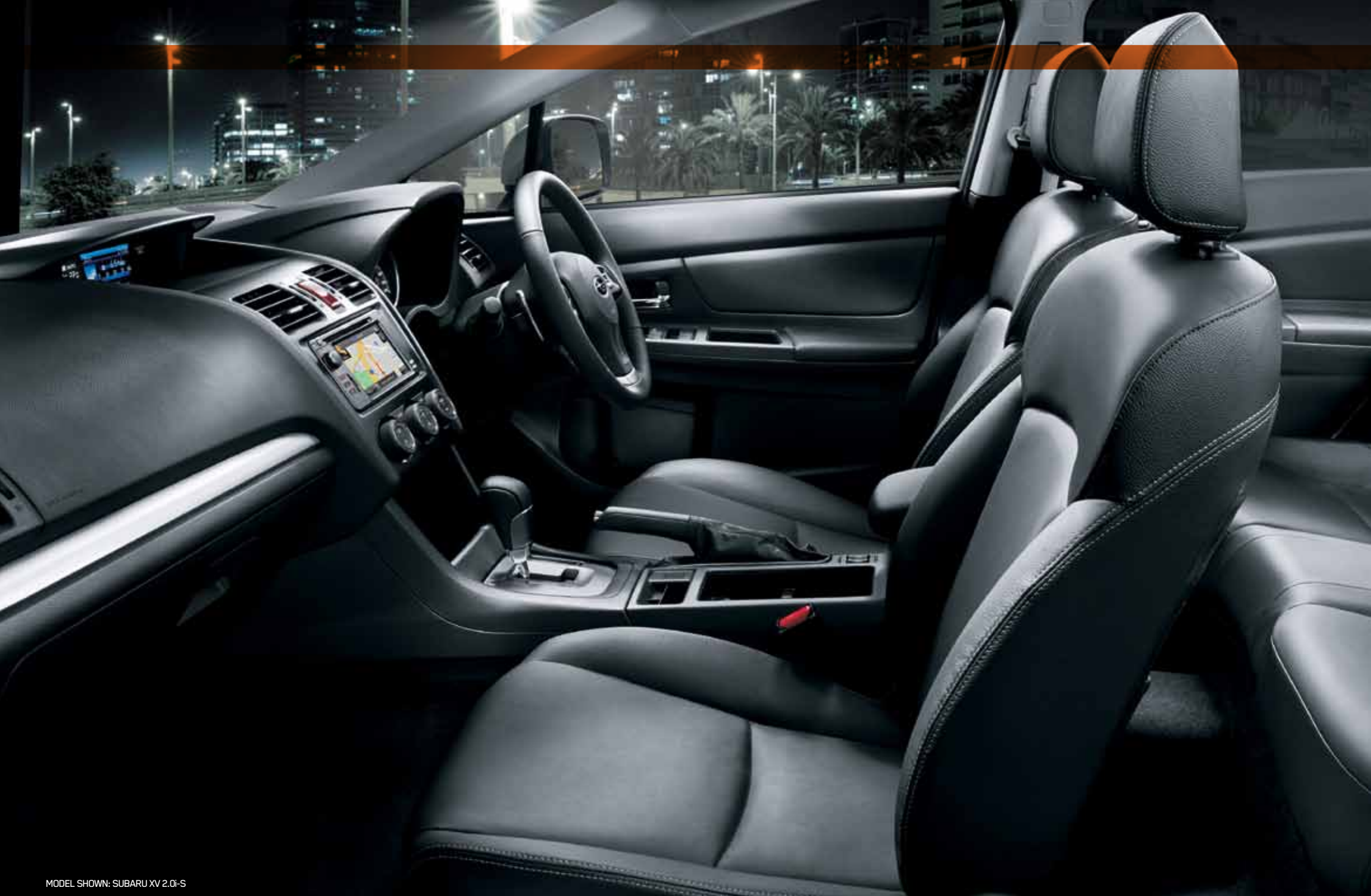
MODEL SHOWN: SUBARU XV 2.0i-S