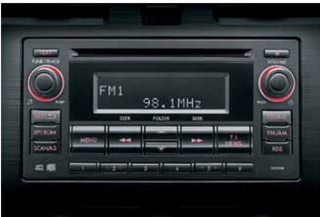
SINGLE IN-DASH CD PLAYER: SUBARU XV 2.0i