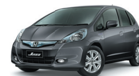
Polished Metal Metallic 1