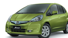
Fresh Lime Metallic 1