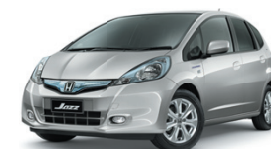
Alabaster Silver Metallic 1