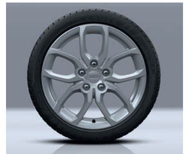
17" TIBOR ALLOYS*

*Available on the Sport and Sport Trophy ^Available on the Cup and Cup Trophy