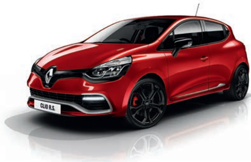
FLAME RED (NNP) M