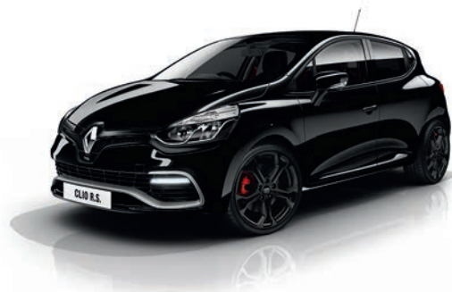
DEEP BLACK (GNA) M