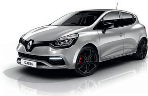
MERCURY GREY (D69) M