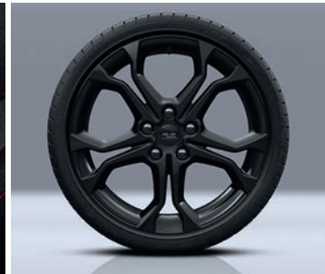
18" RADICALE ALLOYS*