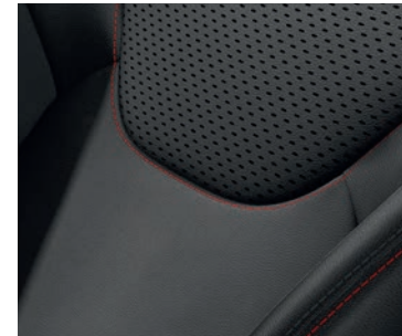
DARK CARBON LEATHER SEATS