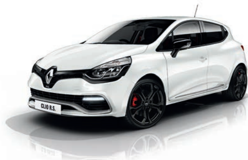
GLACIER WHITE (369) S