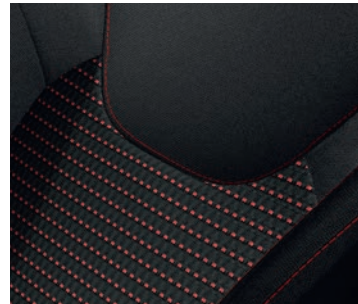
DARK CARBON UPHOLSTERY