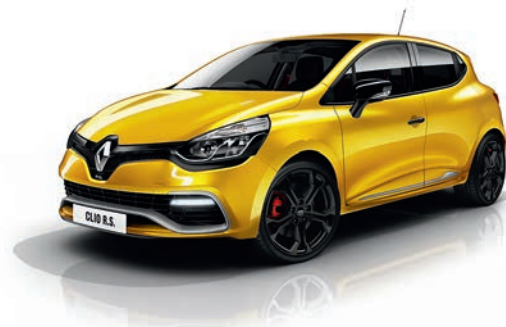
LIQUID YELLOW (J37) R