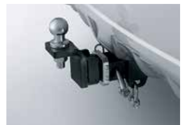
TOW BAR KIT