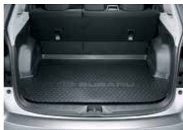
CARGO TRAY (LOW DISH)