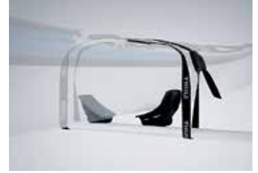
WATER CRAFT HOLDER