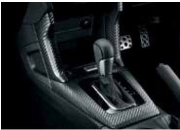
CARBON PANEL INTERIOR TRIM - CVT