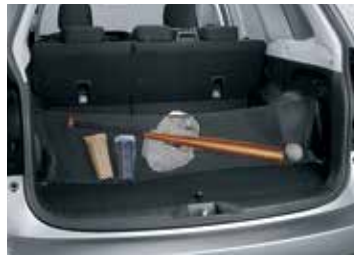
CARGO ROOM NET (REAR TAILGATE)