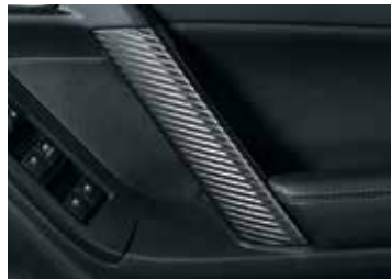
CARBON PANEL INTERIOR TRIM - MT