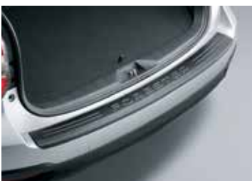
CARGO STEP PANEL (RESIN)