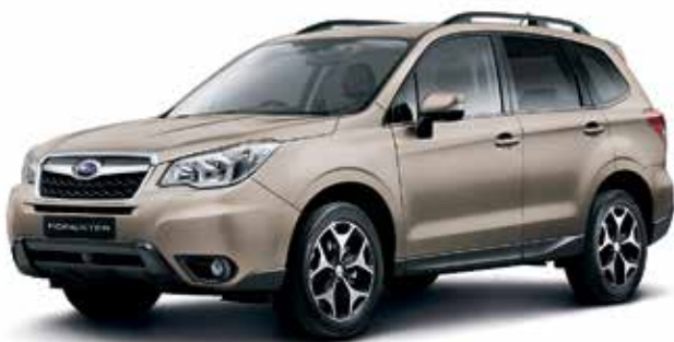
BURNISHED BRONZE METALLIC