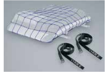
LUGGAGE RACK - NET AND STRAPS