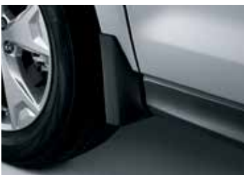
MUD FLAP SET (FRONT) (N/A SIDE SKIRTS)