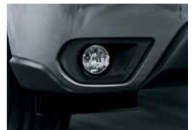
FOG LAMP KIT - NON-AUTO LIGHT