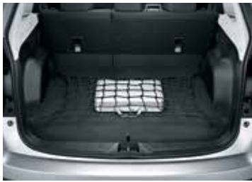
CARGO ROOM NET (FLOOR)