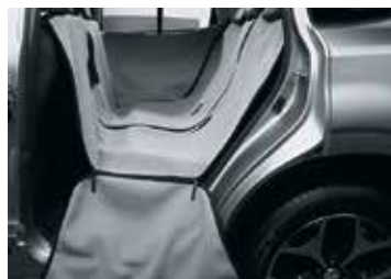
PET PROTECTION SEAT COVER