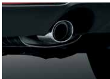
TAIL PIPE COVER