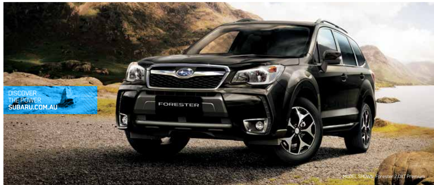
MODEL SHOWN: Forester 2.0XT Premium