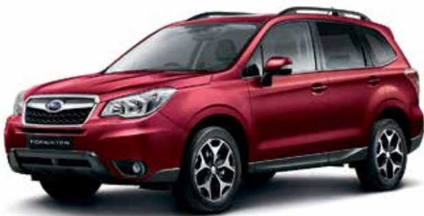
VENETIAN RED PEARL