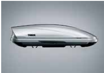
LUGGAGE POD MOTION 200 (SILVER)