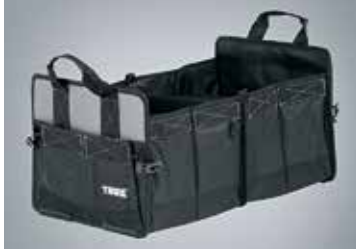
THULE GO BOX