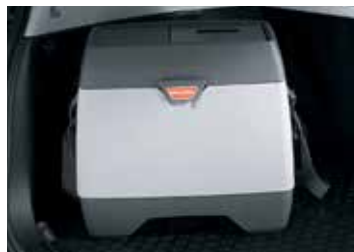
ADVENTURE PORTABLE FRIDGE (14 LITRE) 12V ONLY