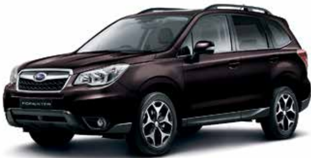
DEEP CHERRY PEARL