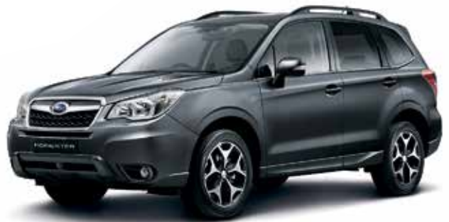
DARK GREY METALLIC