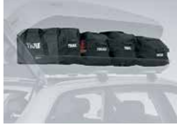
THULE GO PACK SET (4 BAGS)