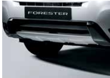
BUMPER UNDER GUARD (FRONT)