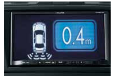
MULTI FUNCTION DISPLAY SENSORS - AVAILABLE IN WHITE/BLACK/SILVER/RED ONLY