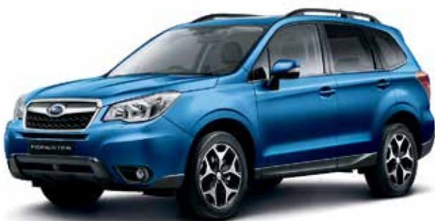
MARINE BLUE PEARL