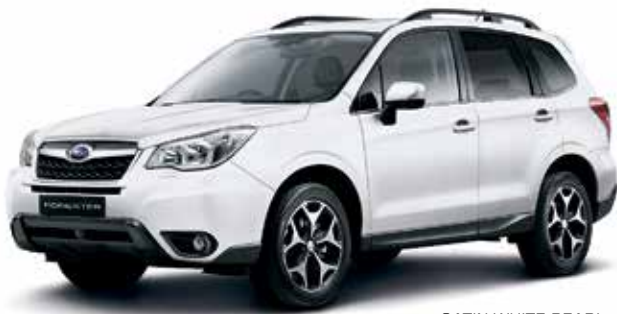
SATIN WHITE PEARL