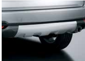
BUMPER UNDER GUARD (REAR) (N/A TOWBAR & REVERSE PARK ASSIST)