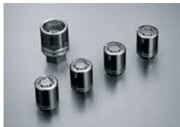
WHEEL LOCK NUTS