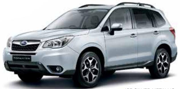
ICE SILVER METALLIC