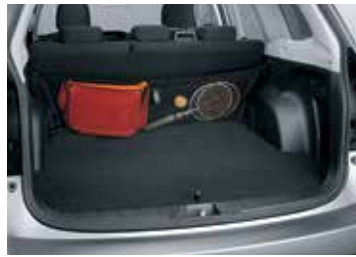
CARGO ROOM NET (REAR SEAT BACK)