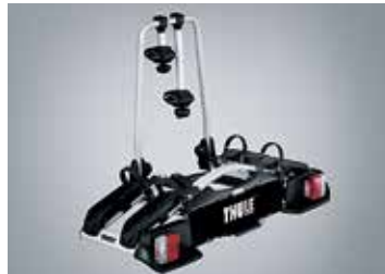
TOW BAR MOUNTED BIKE CARRIER (TWO BIKES)