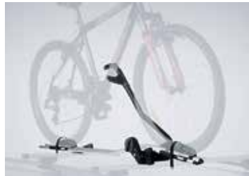
BICYCLE HOLDER (UPRIGHT)