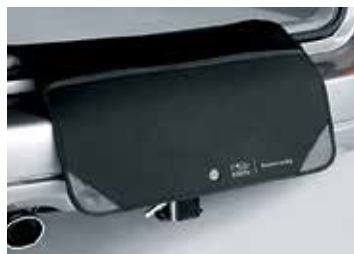
BOOTLIP & BUMPER PROTECTOR