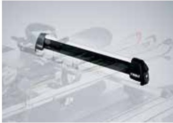
UNIVERSAL LOCKING ARMS