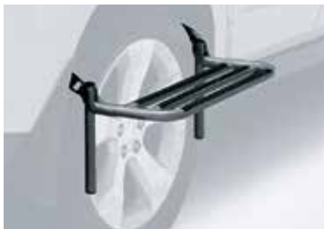
SIDE STEP - STEP UP