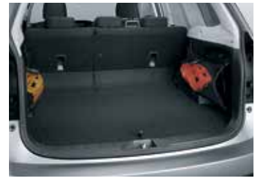
CARGO ROOM NET (SIDE X2)