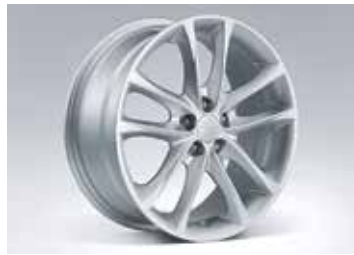
17" ALLOY SET - ACCESSORY