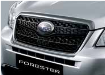
FRONT GRILLE (BLACK)

SUBARU.COM.AU FOR FULL DETAILS ON THE TAILOR-MADE ACCESSORIES AVAILABLE FOR YOUR SUBARU MODEL.