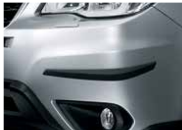
BUMPER CORNER GUARDS