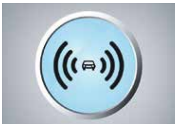
SECURITY ALARM SYSTEM