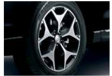
17" ALLOY SET