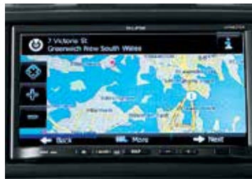
AVN NAVIGATION SYSTEM