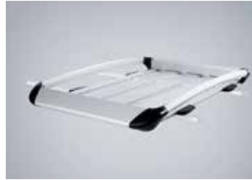
LUGGAGE RACK (SMALL & LARGE)