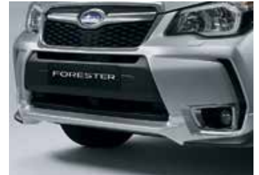
FRONT UNDER SPOILER - AVAILABLE ON FORESTER 2.0XT & 2.0XT PREMIUM