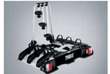
TOW BAR MOUNTED BIKE CARRIER (THREE BIKES)