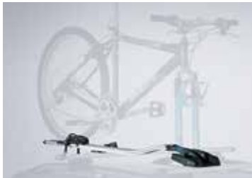
BICYCLE HOLDER (FORK MOUNT)