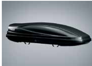
LUGGAGE POD ATLANTIS 780 (GLOSS BLACK) (LARGE)