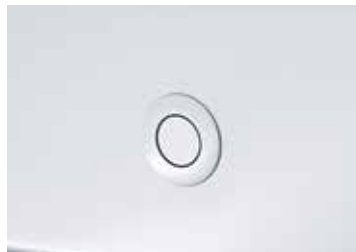
REAR PARKING ASSIST