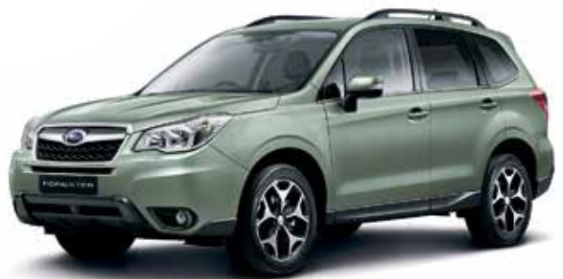
JASMINE GREEN METALLIC