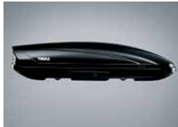
LUGGAGE POD MOTION 800 (BLACK)