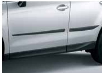
BODY SIDE MOULDING