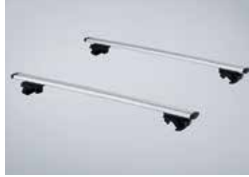
ROOF CROSS BARS