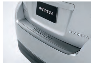
CARGO STEP PANEL - RESIN