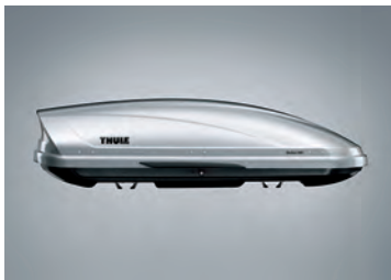
THULE MOTION 200 SILVER LUGGAGE POD