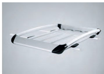
LUGGAGE RACK (SMALL / LARGE)