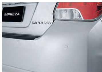
PARKING ASSIST (REAR)