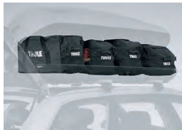
THULE GO PACK SET