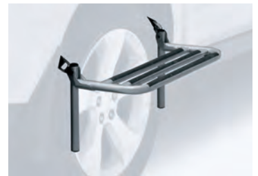
SIDE STEP UP