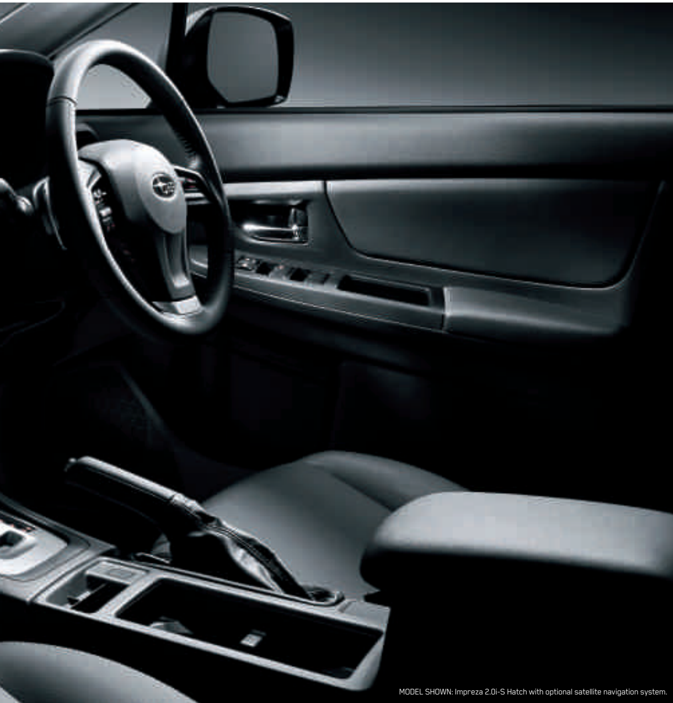
MODEL SHOWN: Impreza 2.0i-S Hatch with optional satellite navigation system.