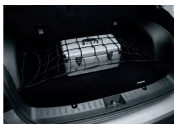
CARGO NET (FLOOR)