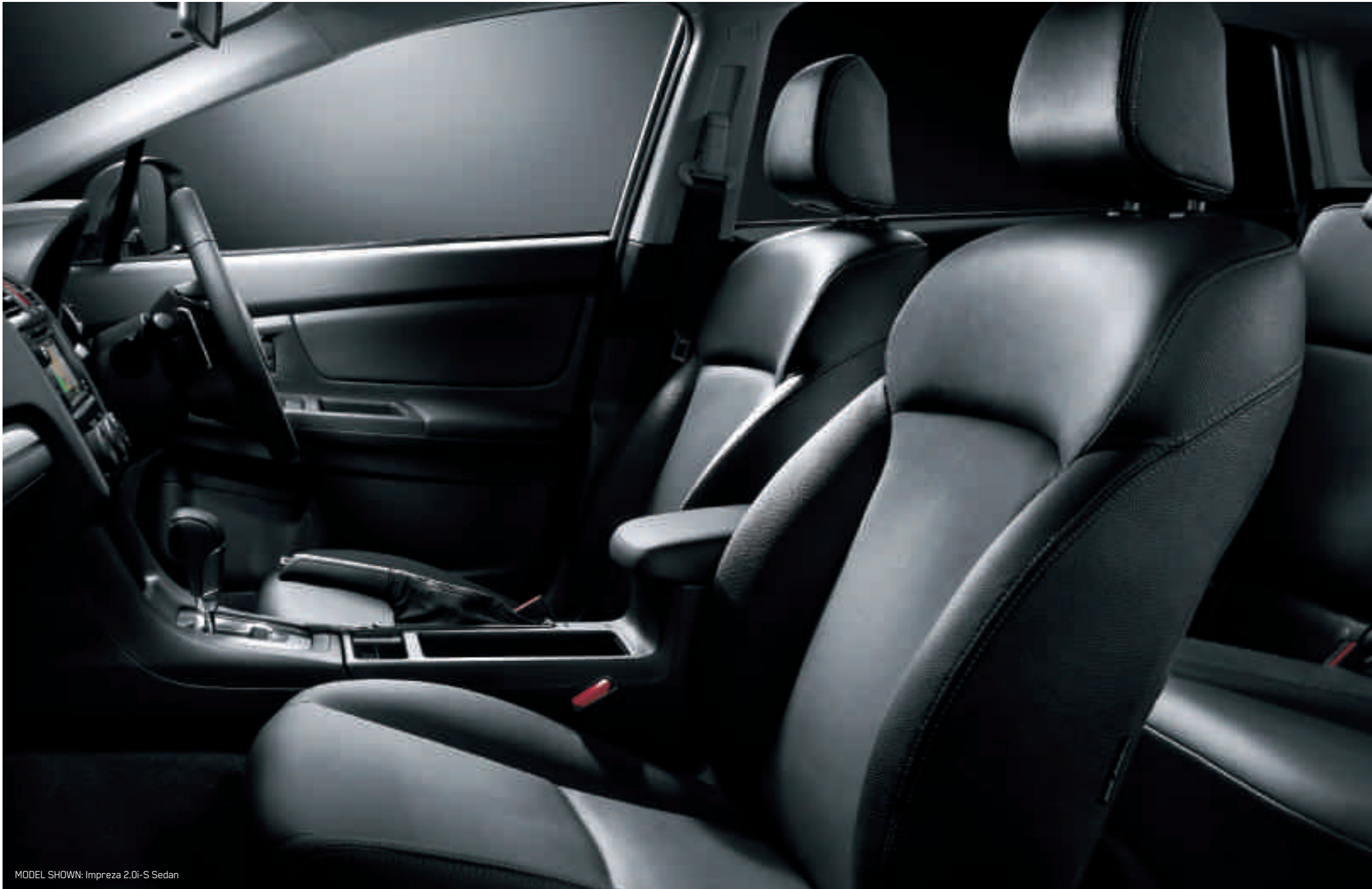
MODEL SHOWN: Impreza 2.0i-S Sedan