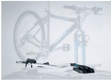
BICYCLE HOLDER (FORK MOUNTED)