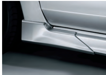
AERO MUDFLAP - FRONT (IMPREZA 2.0i-S ONLY)