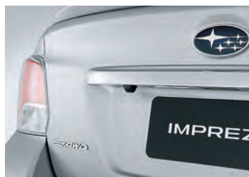
REAR REVERSE CAMERA