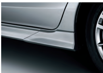
SIDE STRAKE (2.0i-S ONLY)