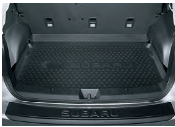
CARGO TRAY - HATCH