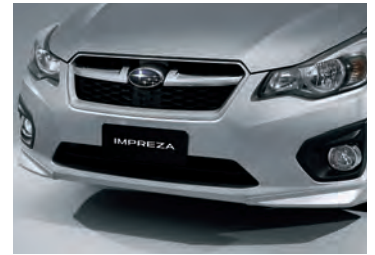
FRONT BUMPER SKIRT