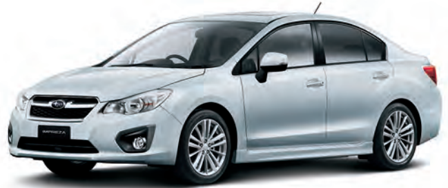
ICE SILVER METALLIC