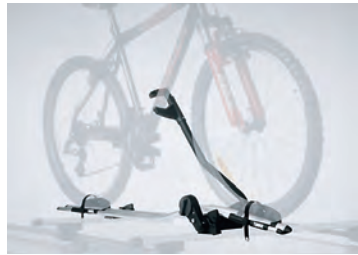
BICYCLE HOLDER (UPRIGHT)