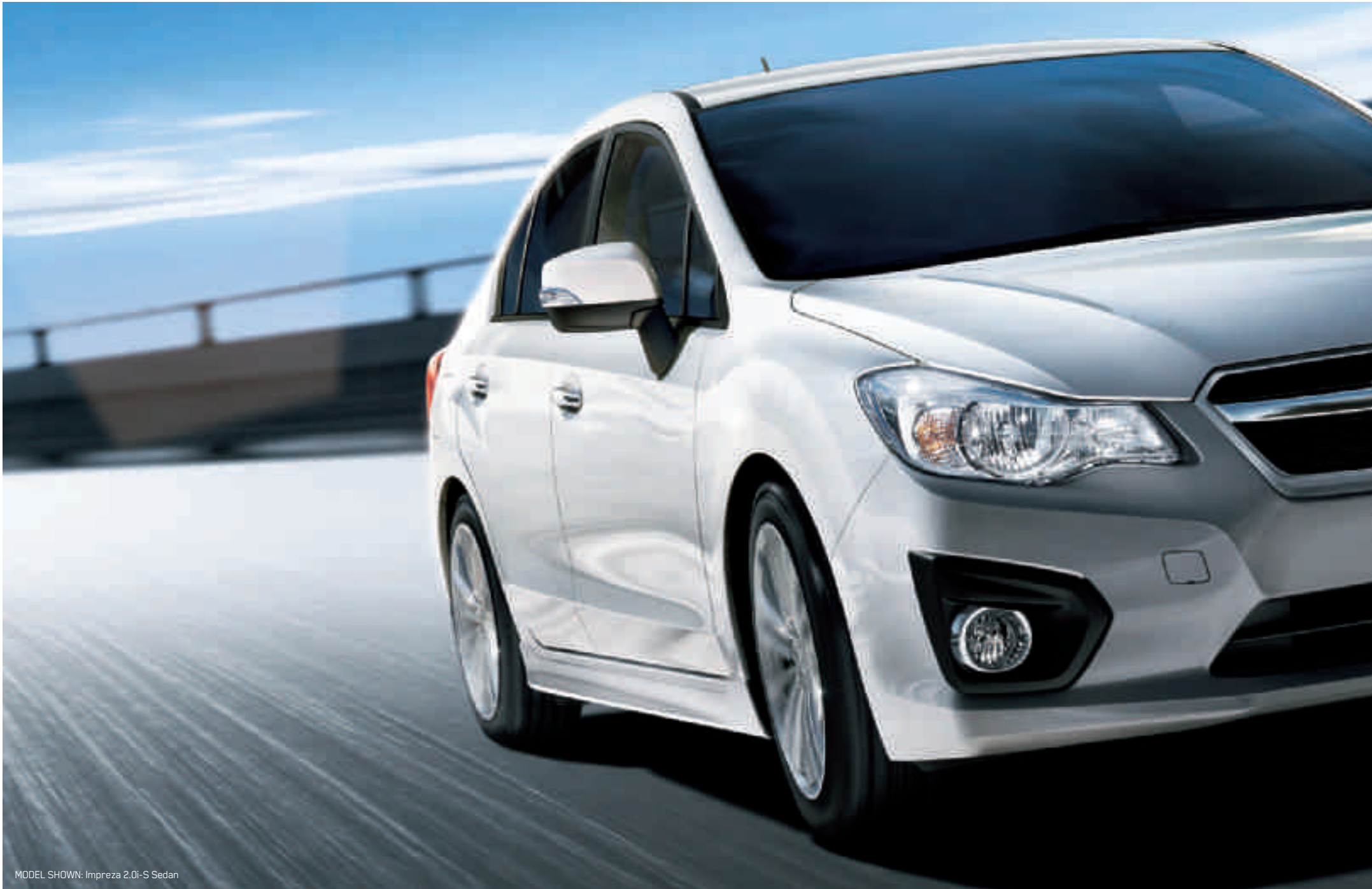
MODEL SHOWN: Impreza 2.0i-S Sedan