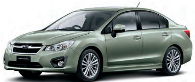
JASMINE GREEN METALLIC 1