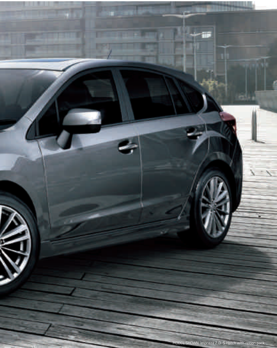
MODEL SHOWN: Impreza 2.0i-S Hatch with option pack