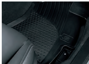
RUBBER MAT SET