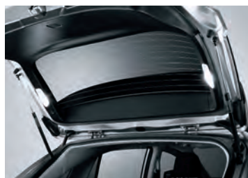
REAR HATCH LIGHT