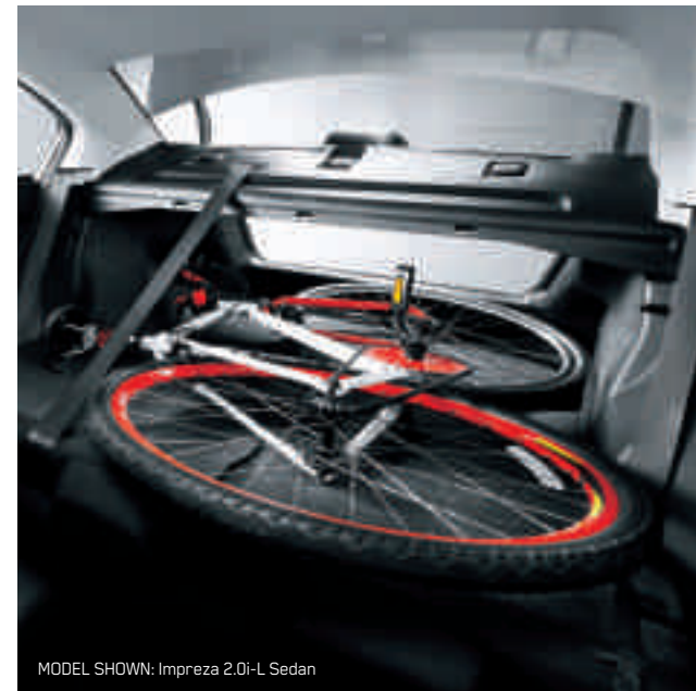
MODEL SHOWN: Impreza 2.0i-L Sedan