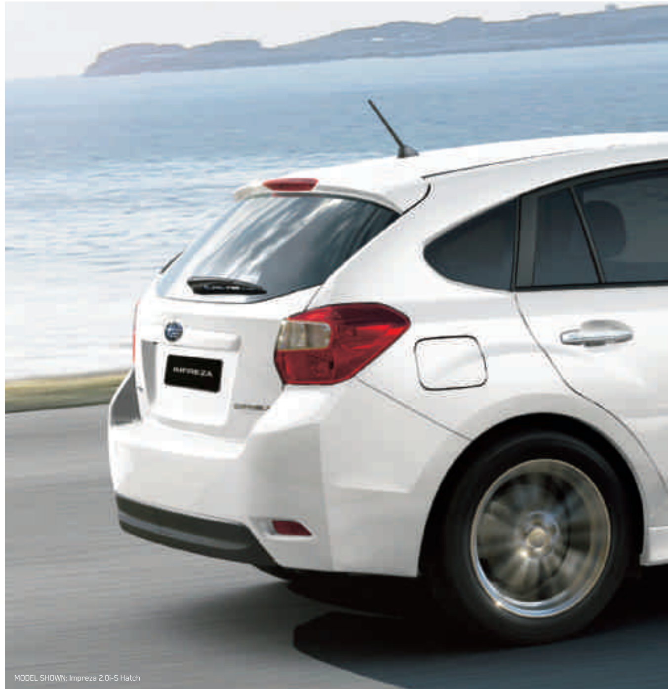
MODEL SHOWN: Impreza 2.0i-S Hatch

IN DESIGNING THE IMPREZA, SUBARU REALLY DID THINK OUTSIDE THE BOX. THEY THOUGHT LATERALLY. THEY DREAMED BIG. AND THEN THEY CREATED A SMALL CAR BOASTING SUBARU'S RENOWNED BOXER ENGINE, COUPLED WITH CUTTING-EDGE TECHNOLOGY, FEATURES AND STYLE. DIFFERENT FROM THE GROUND UP, IT'S THE SMALL CAR THAT STANDS OUT FROM THE CROWD.