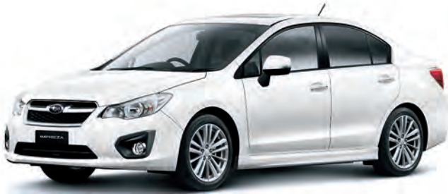
SATIN WHITE PEARL

All colours available in sedan and hatch models.