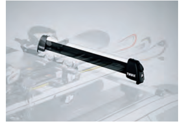
UNIVERSAL LOCKING ARMS