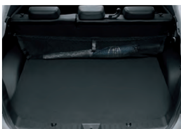
CARGO NET (REAR SEAT BACK)