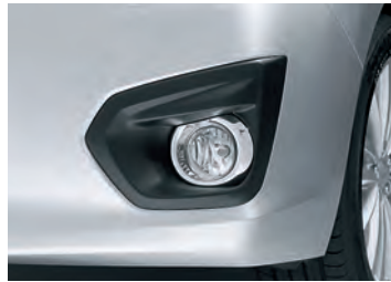
FOG LAMP KIT