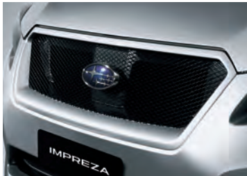
FRONT MESH GRILLE