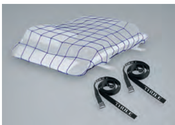
NET AND STRAPS FOR LUGGAGE RACK