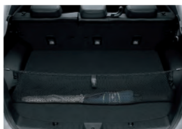
CARGO NET (REAR TAILGATE)