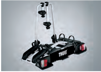
TOW BALL MOUNTED BIKE CARRIER (TWO BIKES)