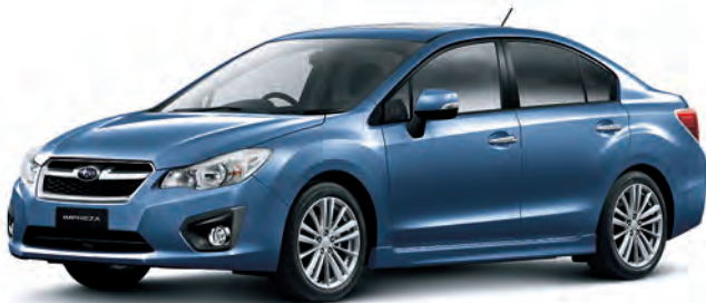
MARINE BLUE PEARL