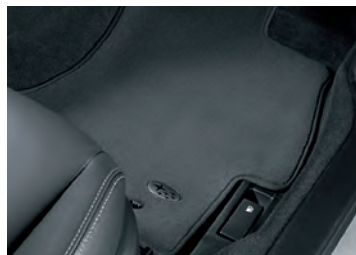
CARPET FLOOR MATS