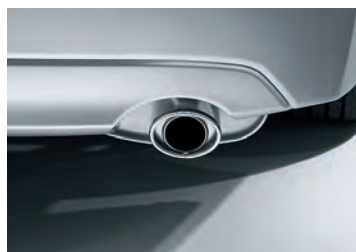
CHROME EXHAUST EXTENSION