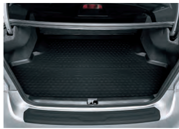
CARGO TRAY - SEDAN