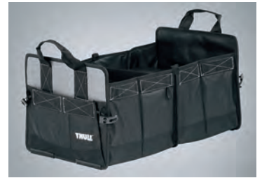
THULE GO BOX