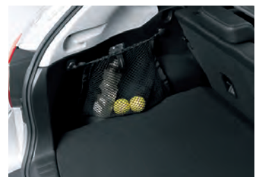
CARGO NET (SIDES)