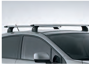
ROOF CROSS BARS