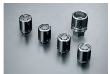
WHEEL LOCK NUTS