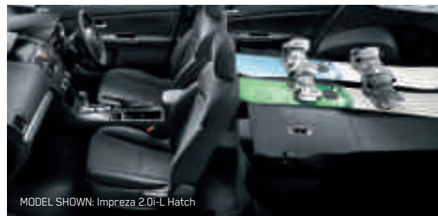
MODEL SHOWN: Impreza 2.0i-L Hatch