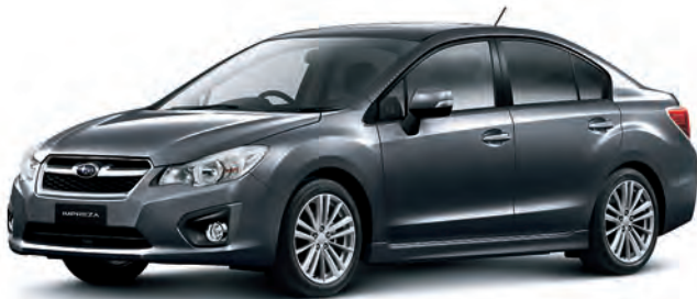
DARK GREY METALLIC