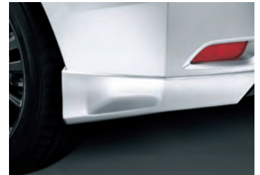
AERO MUDFLAP - REAR (IMPREZA 2.0i-S ONLY)