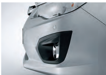
PARKING ASSIST (FRONT)