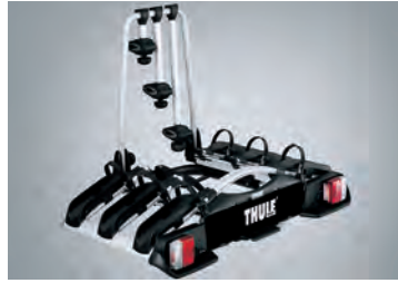
TOW BALL MOUNTED BIKE CARRIER (THREE BIKES)