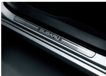
SIDE SILL PLATE