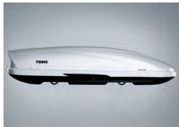
THULE MOTION 800 SILVER LUGGAGE POD