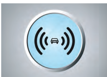
SECURITY ALARM SYSTEM