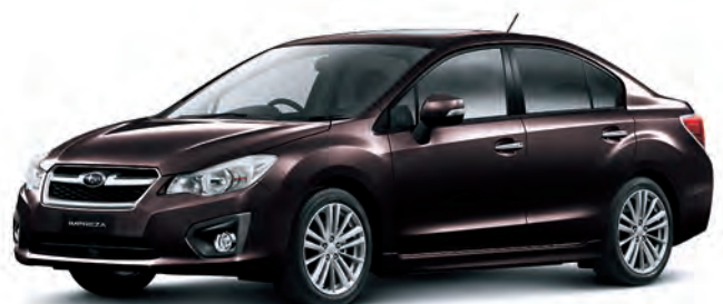
DEEP CHERRY PEARL