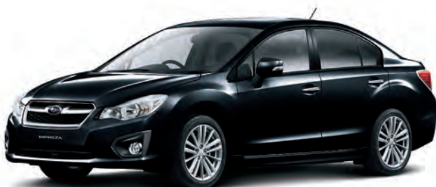
CRYSTAL BLACK SILICA