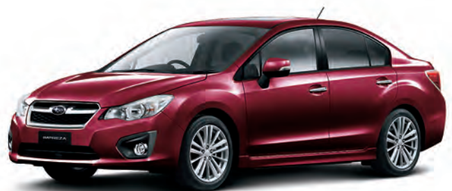
VENETIAN RED PEARL