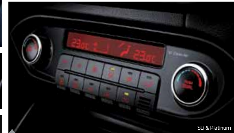
SLi & Platinum