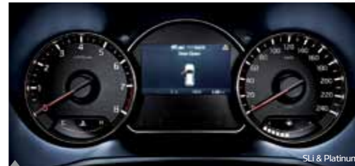
SLi & Platinum