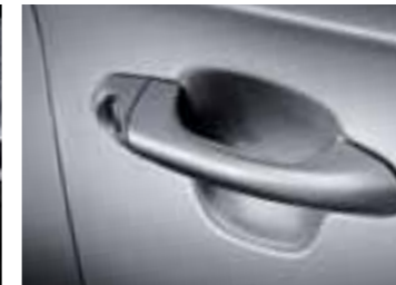
Outside door handle Body colour grip-type handles are standard on the Si model, and for a more classic look, SLi & Platinum models come with chrome-finished handles.