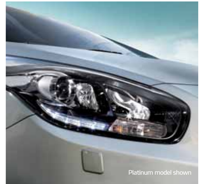
Platinum model shown