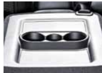
2 nd row centre table A conveniently located centre table with three cup holders for back seat passengers to use.