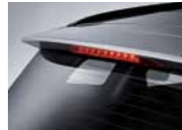
Rear spoiler / High-mounted stop lamp Standard on all models, the rear spoiler adds a sporty touch to the exterior design while a high-positioned stop lamp ensures that you are clearly visible to drivers behind you.