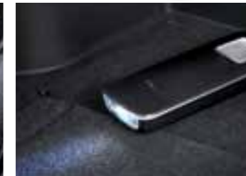
Portable flashlight When mounted on the wall socket, this handy detachable flashlight automatically recharges while also serving as an interior lamp for the cargo area. (Platinum)