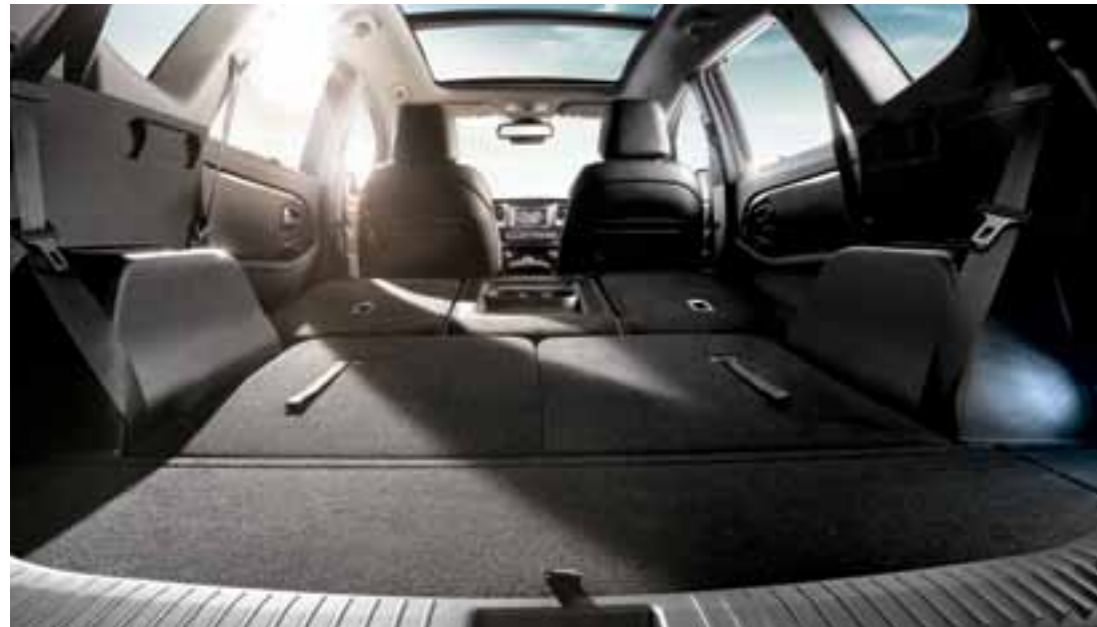
Spacious cargo room A walk-in sliding function on the outer 2 nd row seats enable occupants to easily access the 3 rd row seats with a light touch of a lever, while the luggage flat configuration for the 2 nd and 3 rd row seats provides expansive space for hauling all types of cargo. (Platinum model shown)

We believe that the true measure of a groundbreaking car can be found in the details. And we're sure you'll be pleased to discover the numerous delightful surprises to be found in every nook and cranny of the all new Rondo.