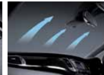
Auto defogging system A sensor automatically initiates a defogging process when condensation is detected on the windows to ensure optimal visibility in humid climates. (SLi & Platinum)