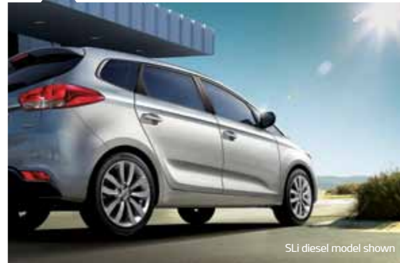
SLi diesel model shown

The all new Rondo offers elegant refinement and state-of-the-art technologies. Enjoy daily commuting and movie nights out with the kids in ultimate comfort and style.