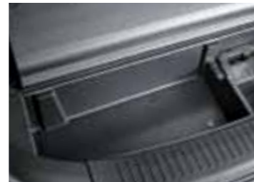
Cargo under storage compartment A compartment located under the floor at the rear of the vehicle is the perfect place to store away emergency safety and cleaning supplies. The cargo screen can also be stored when not in use.