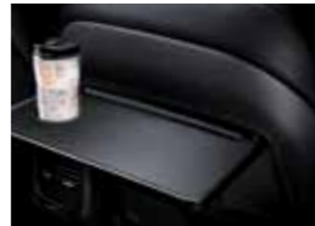
Fold-up tray The backs of both driver and front passenger seats are fitted with convenient trays that feature an additional cup holder for extra convenience of the 2 nd row seat occupants. (SLi & Platinum)