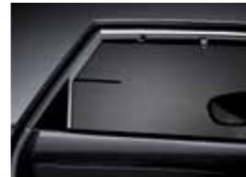
2 nd row sun blind The manually retractable sunshades for the 2 nd row windows provide protection from harsh sun glare and help to keep the cabin cool. (Platinum)

The smart key unlocks the doors as soon as you touch the door handle so that you never have to worry about fumbling around for keys. (Platinum only)