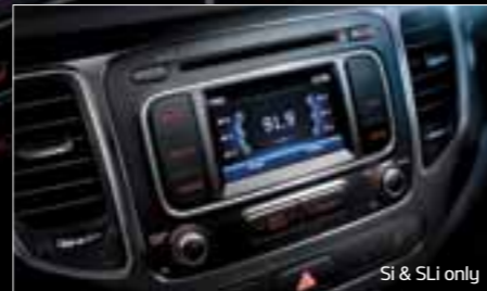
Si & SLi only

A high-fidelity 6-speaker audio system featuring radio, CD and MP3 playback can be conveniently controlled using the large, high visibility touch screen display.