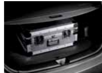
Cargo security screen Create a separate partitioned-off space at the rear of the vehicle to stow away any personal belongings that you want to hide from prying eyes.