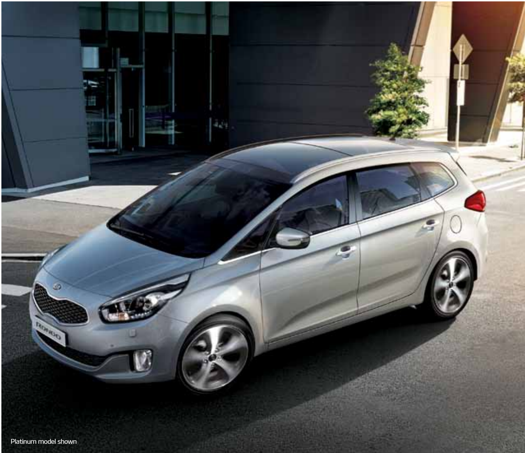
Platinum model shown