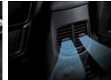
Rear air ventilation Back seat passengers can also enjoy warm or cool air circulation thanks to rear air vents positioned at the back of the centre console.