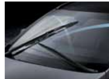
Opposed-type wiper system Unlike conventional wiper systems, the wiper blades are mounted on opposite sides of the windshield and move in the opposite direction for maximum visibility even in heavy rain and snow.