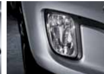
Fog lamps The fog lamps are stylishly integrated with the air intake holes of the front bumper using black housing to accentuate the car's athletic stance.