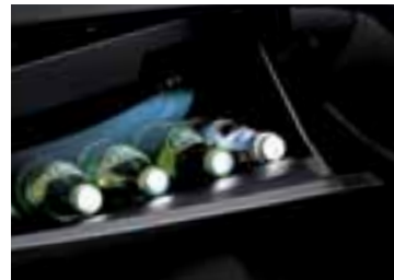
Cooled glove box The large 8L glove box has a cooling function that comes in handy when storing perishable items or cold drinks, especially on long journeys. (Platinum)