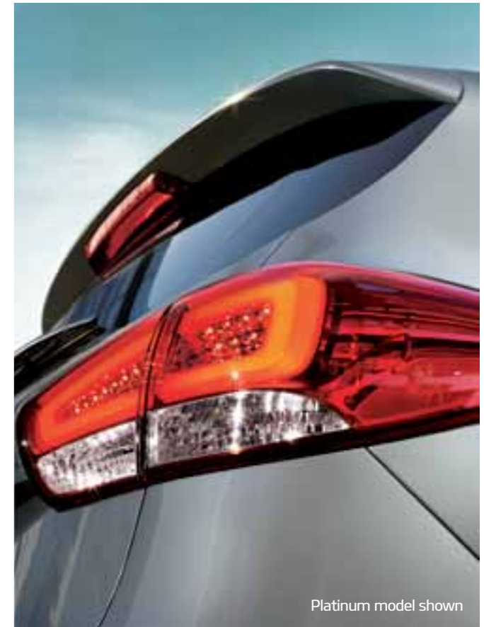
Platinum model shown