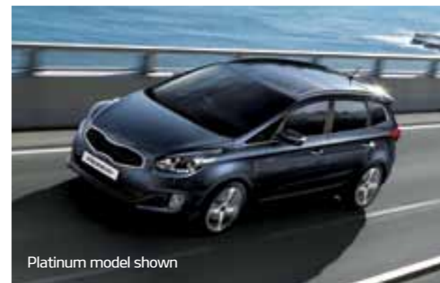
Platinum model shown

With distinctive European styling, coupled with maximum versatility and cutting-edge safety and convenience features, the all new Rondo is a truly innovative family car.