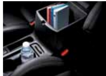
Center console Two drinks can be securely stored within easy reach while a center fascia undertray and large storage compartment under the center armrest provide plenty of space for storing personal items. (Platinum model shown)