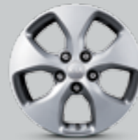
205/55R 16" Alloy Wheel Si

A choice of three newly-designed wheels gives the all new Rondo maximum curb appeal.