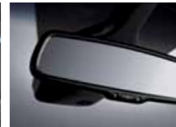
ECM mirror Distracting headlamps behind you are a thing of the past thanks to the auto-dimming, wide-angle electrochromic mirror. (SLi & Platinum)