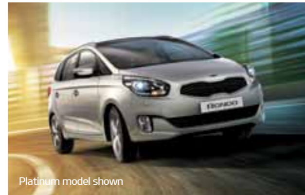
Platinum model shown