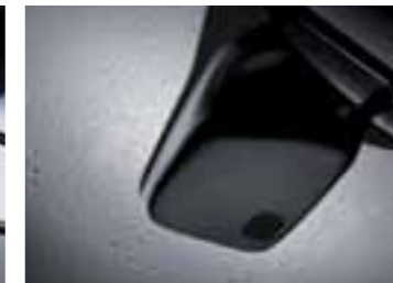
Rain sensor The windscreen wipers are automatically activated as soon as moisture is detected for greater convenience and visibility. (SLi & Platinum)