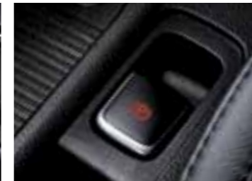
EPB (electronic parking brake) Engage the parking brake simply by pressing a button and take all of the guesswork out of knowing whether it's properly engaged or not. (Platinum)