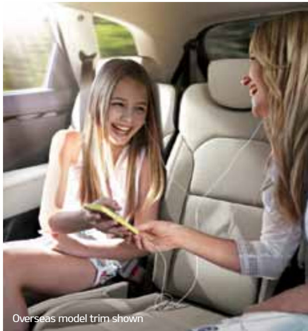
Overseas model trim shown

Kia's engineers not only succeeded in creating an interior cabin that boasts expansive roominess but they considered the use of space down to the very last detail. Designed to facilitate active family lifestyles, you'll soon discover why the all new Rondo is much more than just a People Mover.