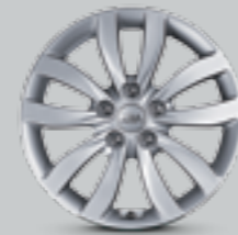
225/45R 17" Alloy Wheel SLi