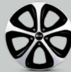
225/45R 18" Alloy Wheel Platinum