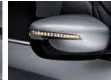
Side mirror Wing-type electric folding two-tone side mirrors feature LED turn signal lamps and puddle lamps for added safety and convenience. (SLi & Platinum)