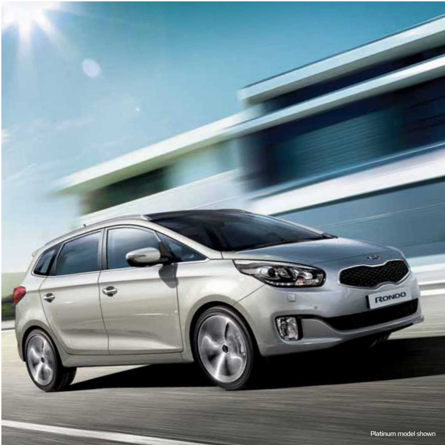
Platinum model shown