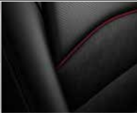
Black leather/black suede* (Akari)