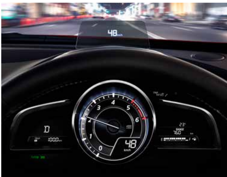
ACTIVE DRIVING DISPLAY