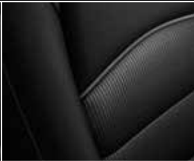
Black/grey cloth (Maxx)