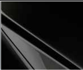
Jet Black Mica