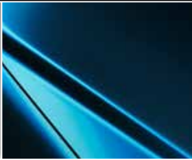
Dynamic Blue Mica