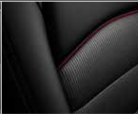
Black Maztex/grey cloth (sTouring)