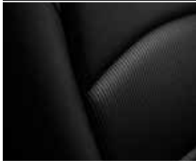
Black/grey cloth (Neo)