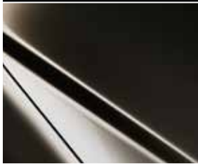
Titanium Flash Mica ■