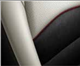
Pure white leather/ black suede* ■ (Akari)