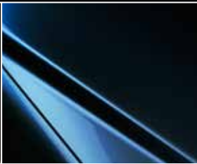
Deep Crystal Blue Mica ■