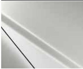
Crystal White Pearl Mica