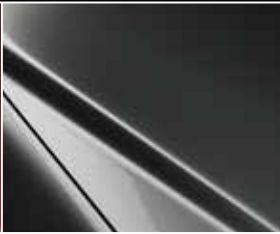
Meteor Grey Mica ■