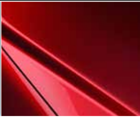
Soul Red Metallic ■