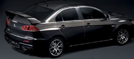
Phantom Black (M)