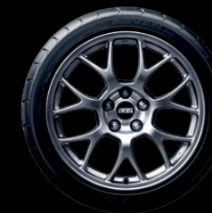
18" BBS forged aluminium wheels