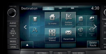
Mitsubishi Multi Communication System