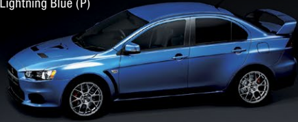
Lightning Blue (P)