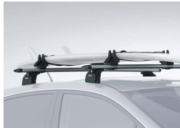
SURFBOARD CARRIER 1