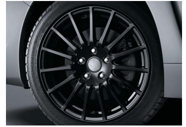
17-INCH ALLOY WHEELS