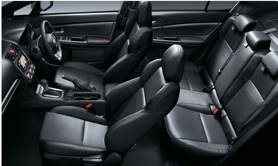
BLACK LEATHER 1 : SUBARU WRX PREMIUM