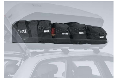
THULE GO PACK SET