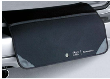
BOOT LIP AND BUMPER PROTECTOR