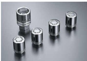
WHEEL LOCK NUTS