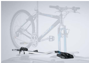
BICYCLE HOLDER 1 (FORK MOUNTED)