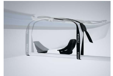
WATERCRAFT HOLDER 1