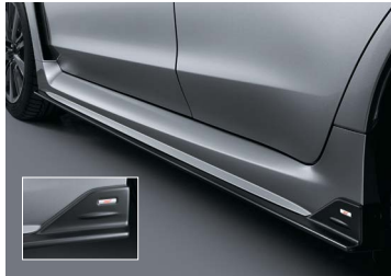
SIDE UNDER SPOILER