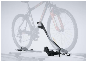
BICYCLE HOLDER 1 (UPRIGHT)