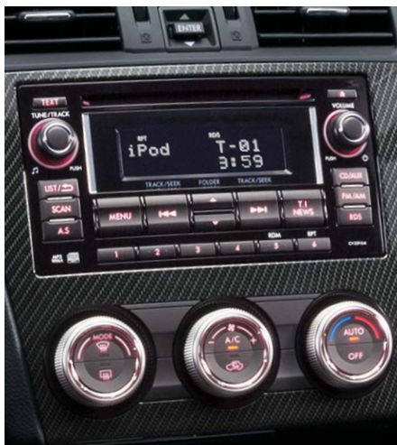
SINGLE IN-DASH CD PLAYER: SUBARU WRX