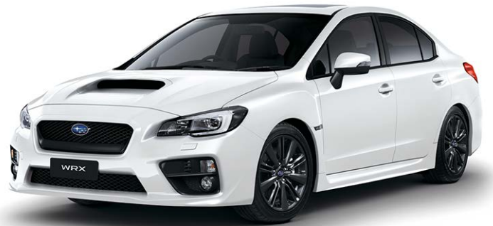
CRYSTAL WHITE PEARL