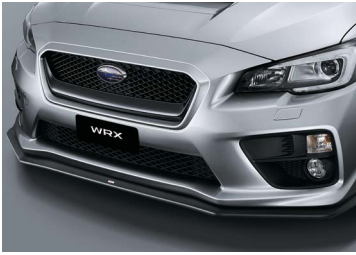
FRONT LIP SPOILER