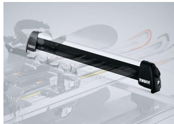
UNIVERSAL LOCKING ARMS 1