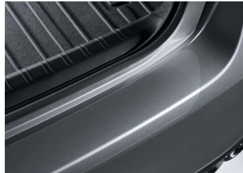
REAR BUMPER APPLIQUE