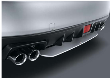
REAR UNDER SPOILER