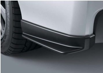
REAR SIDE UNDER SPOILER