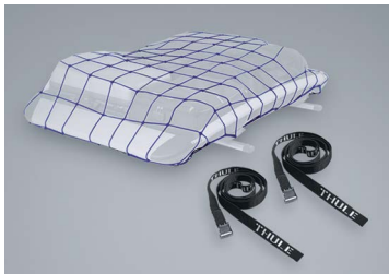
NET AND STRAPS FOR LUGGAGE RACK