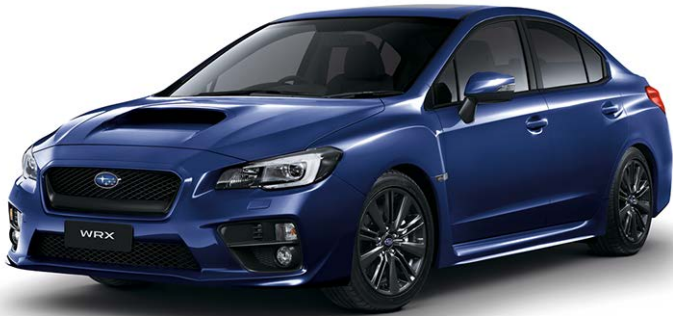
GALAXY BLUE SILICA