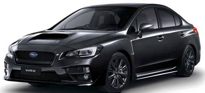
CRYSTAL BLACK SILICA