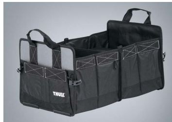
THULE GO BOX