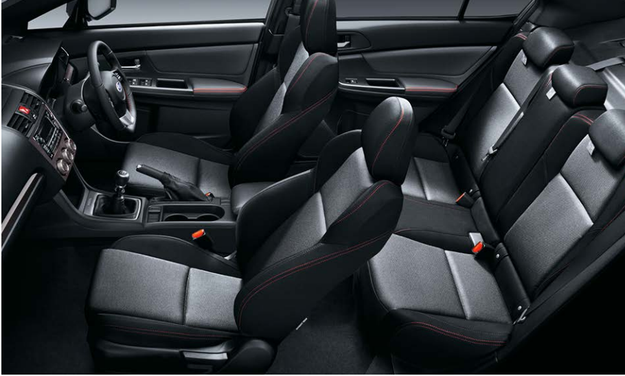
BLACK CLOTH: SUBARU WRX