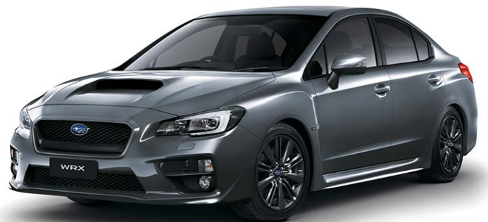
DARK GREY METALLIC