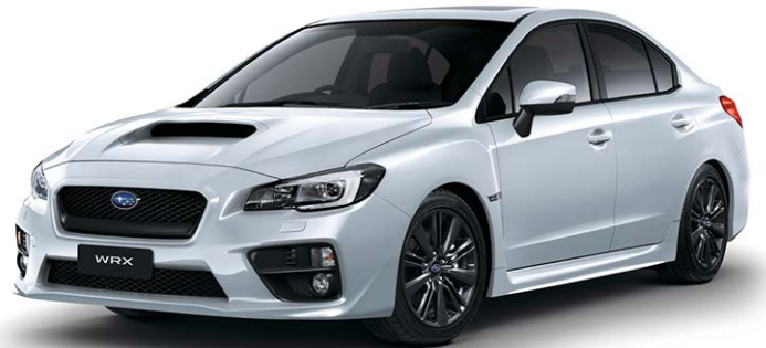
ICE SILVER METALLIC