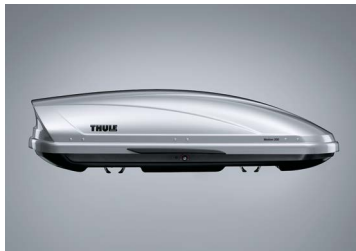
THULE MOTION 200 SILVER LUGGAGE POD 1