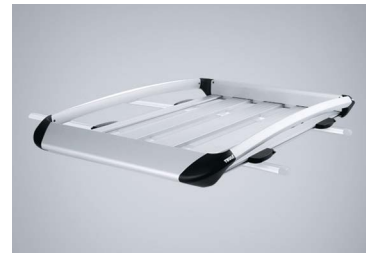
LUGGAGE RACK 1 (SMALL)