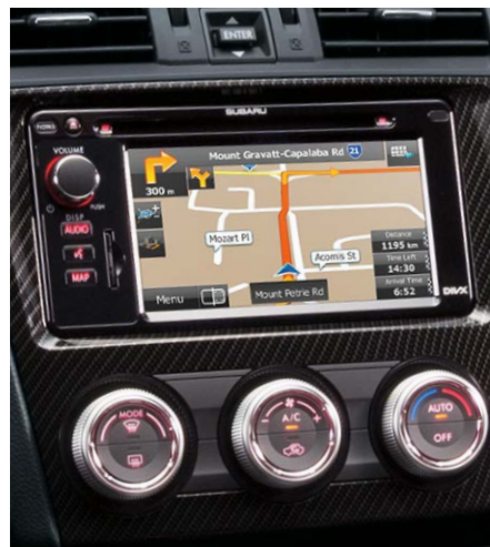
MULTI-INFORMATION IN-DASH SATELLITE NAVIGATION SYSTEM: SUBARU WRX PREMIUM