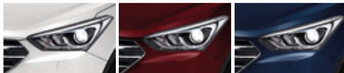
CREAMY WHITE NCW (SOLID) RED MERLOT VR6 (PEARL) OCEAN VIEW W8U (METALLIC)

Colours are indicative only and may vary due to the printing process. *Highlander only.