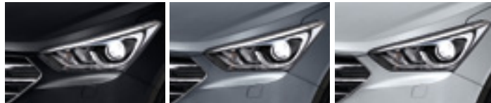
PHANTOM BLACK PKA (MICA) TITANIUM SILVER T6S (METALLIC) SLEEK SILVER N3S (METALLIC)