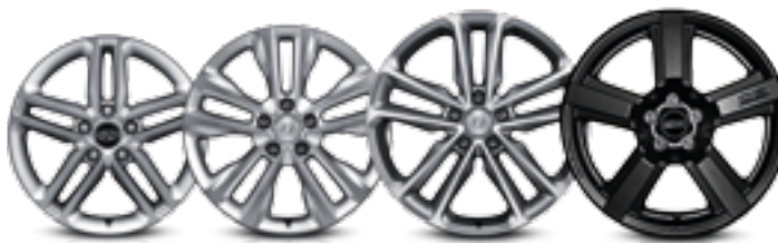
17" Alloy Wheel 18" Alloy Wheel 19" Alloy Wheel 19" Black OZ Wheel

17-inch alloy wheels (Standard on Active variant)