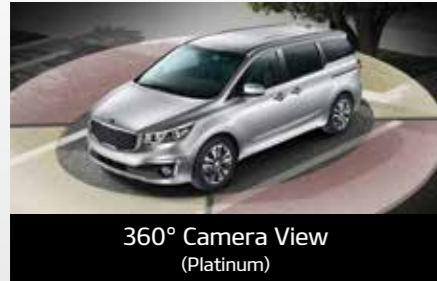
360° Camera View (Platinum)