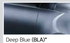
Deep Blue (BLA)*