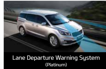
Lane Departure Warning System (Platinum)