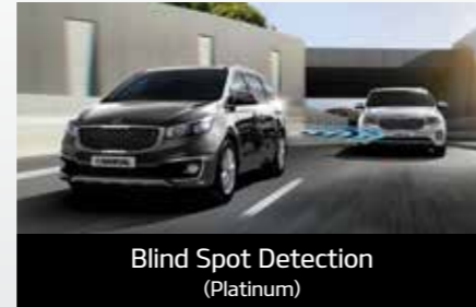
Blind Spot Detection (Platinum)