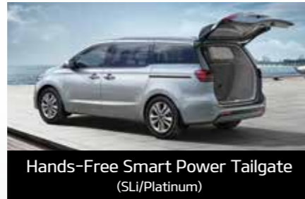
Hands-Free Smart Power Tailgate (SLi/Platinum)