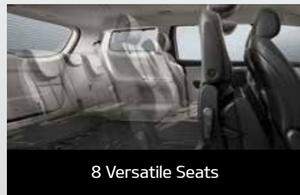
8 Versatile Seats