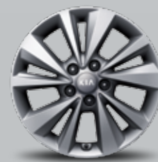
17" Alloy Si