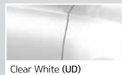
Clear White (UD)