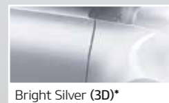
Bright Silver (3D)*