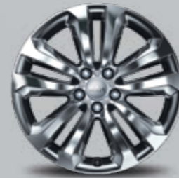
19" Alloy (chrome finish) Platinum

For full terms and conditions on Kia's 7 Year Unlimited Km warranty, visit www.kia.com.au . Note: 7 year/150,000km warranty for vehicles used for the following: rental vehicles, hire cars, taxis, courier vehicles, driving school vehicles, security vehicles, bus and tour vehicles. *Leather trim includes some leather-like material on selected high impact surfaces. YES Essentials® is a registered trademark of Sage Automotive Interiors.