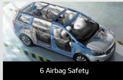
6 Airbag Safety