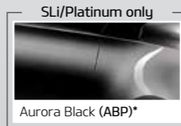
Aurora Black (ABP)*

Consult your dealer on colour availabilities for each model. *Premium paint at additional cost.