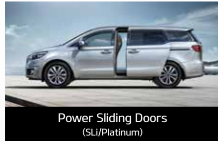
Power Sliding Doors (SLi/Platinum)