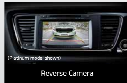
(Platinum model shown)