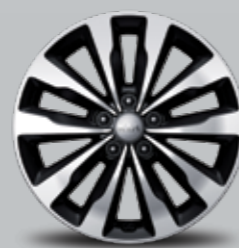
18" Alloy (machine finish) SLi