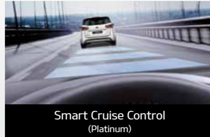
Smart Cruise Control (Platinum)