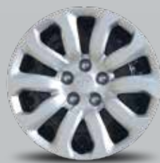
17" Steel S