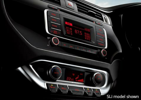
SLI model shown

While the ergonomically designed cockpit enhances driver comfort, the dashboard's intuitive design ensures an impressive array of technology and features are always within reach. The controls of the centre fascia are logically arranged for intuitive fingertip operation.