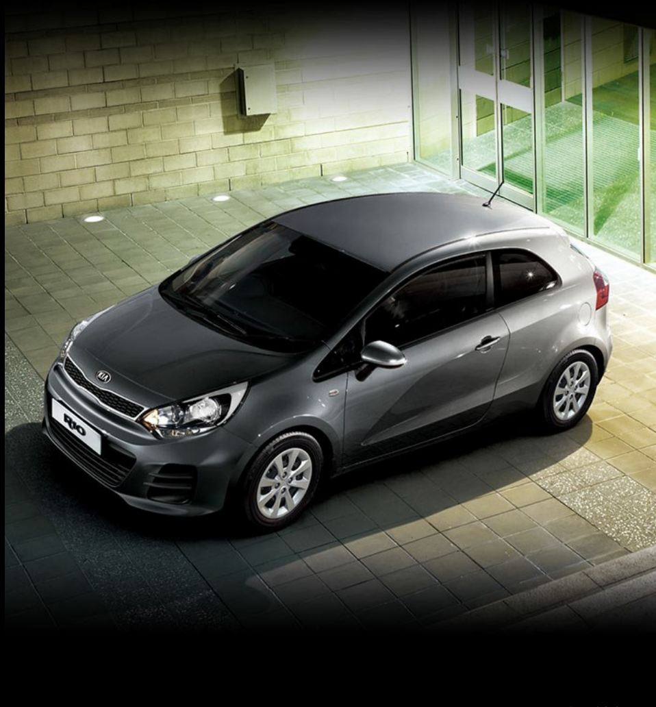
S model shown