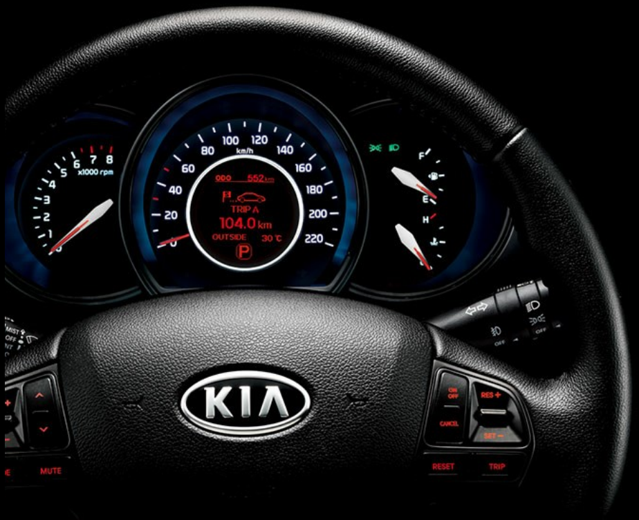
Sport model shown