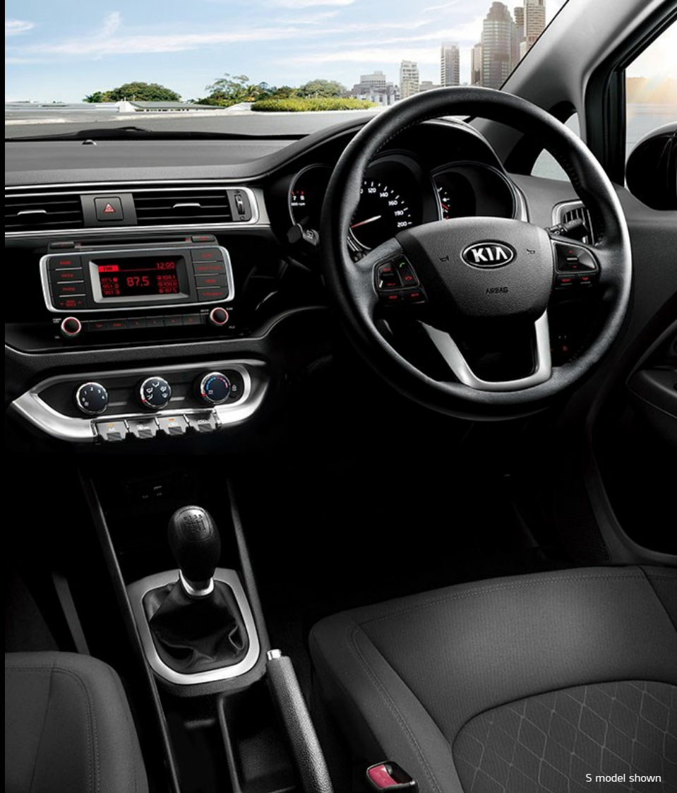
S model shown