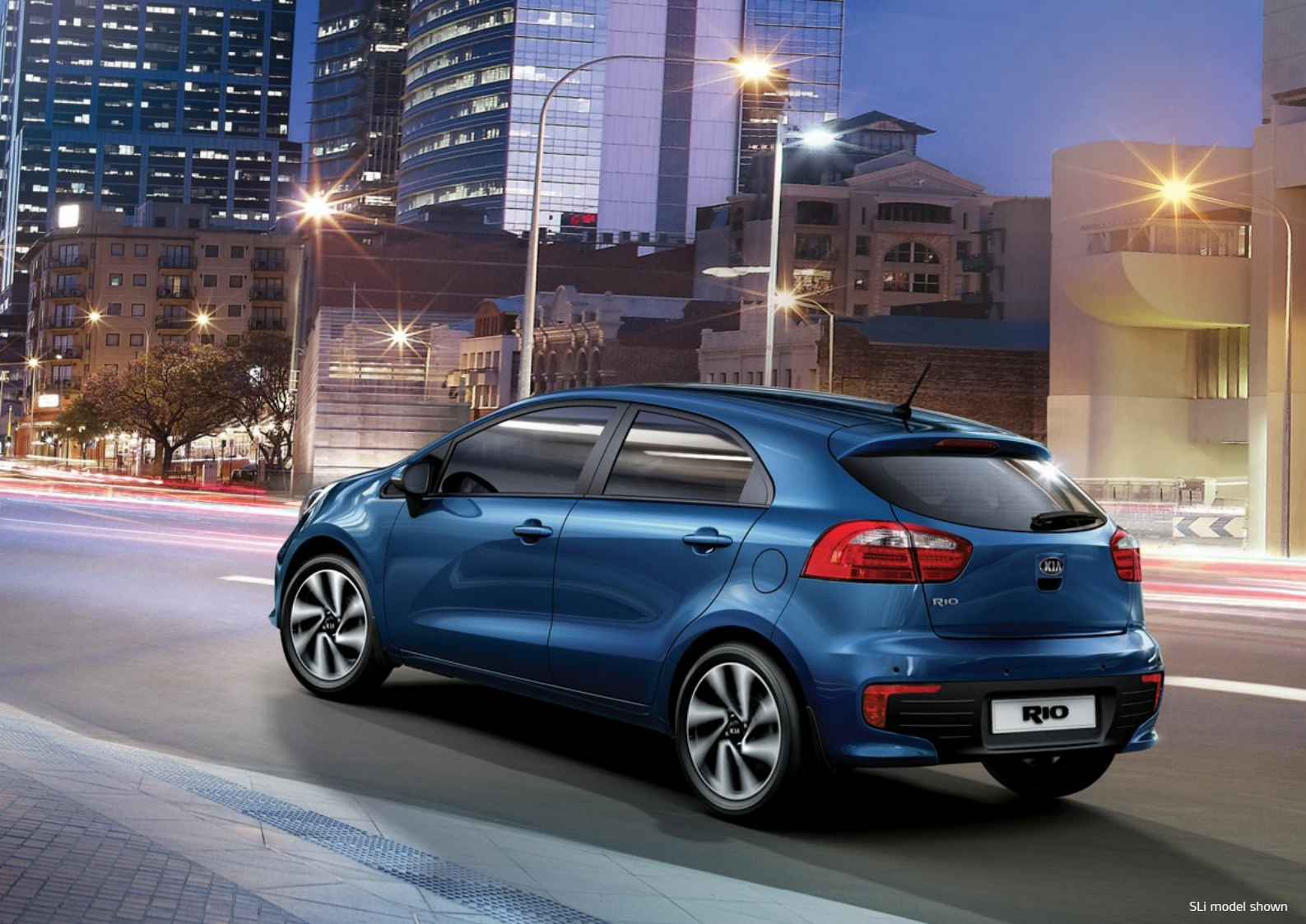
SLi model shown