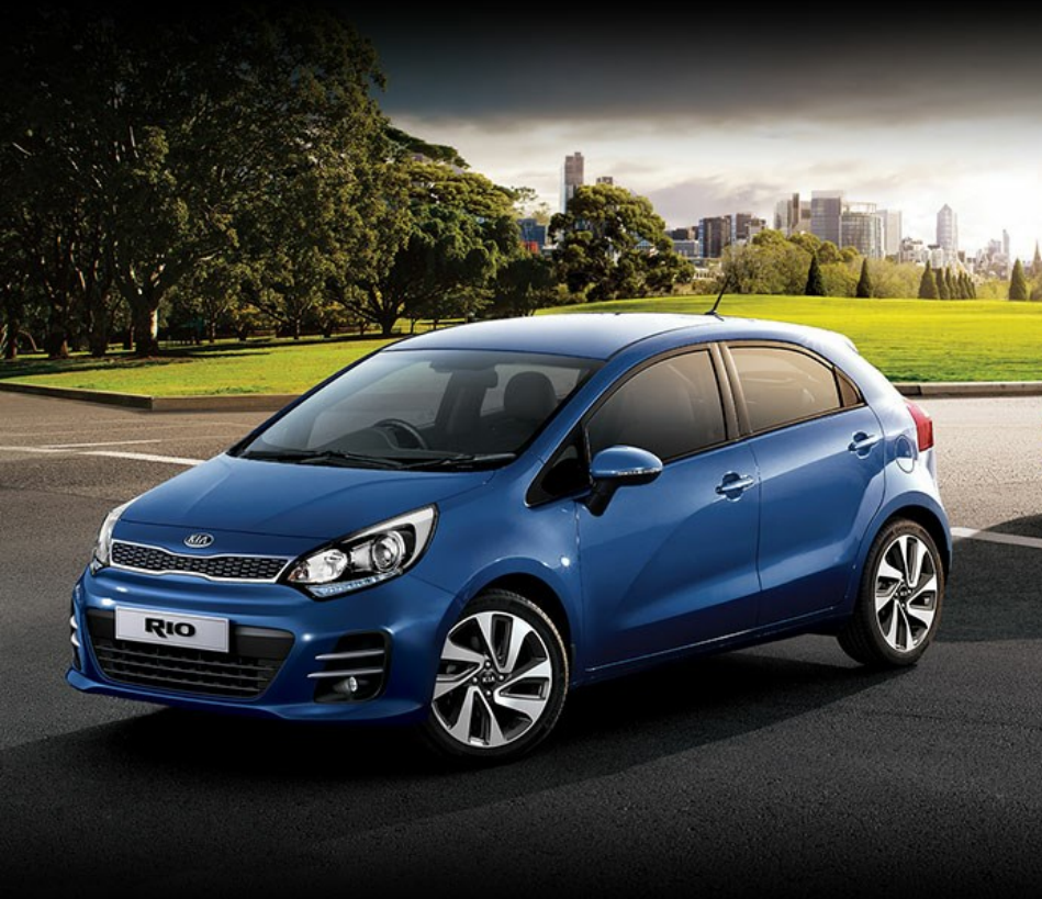
SLi model shown