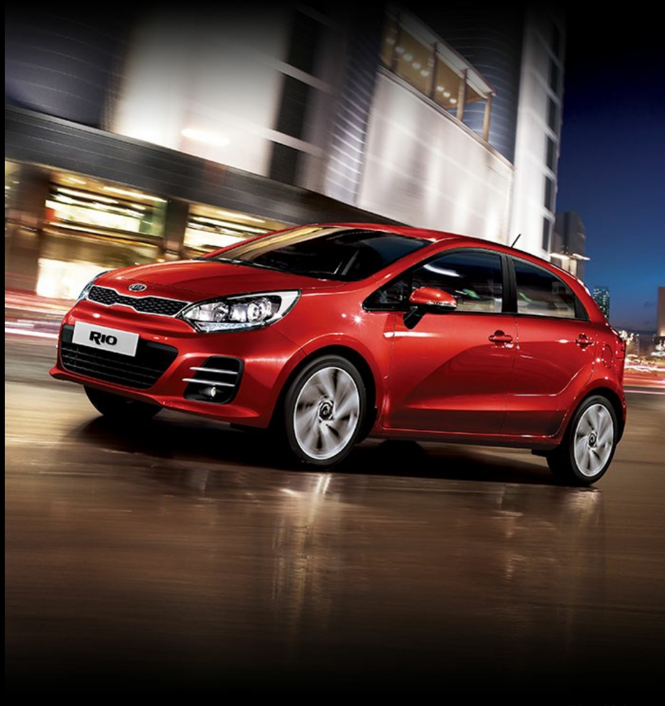
SLi model shown