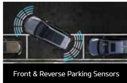
Front & Reverse Parking Sensors