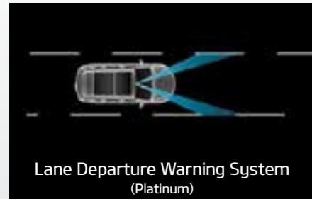
Lane Departure Warning System (Platinum)