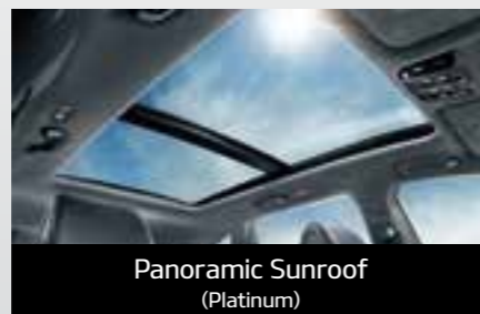
Panoramic Sunroof (Platinum)