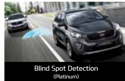
Blind Spot Detection (Platinum)