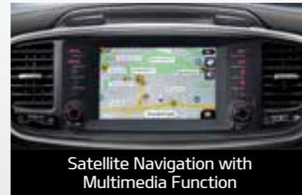
Satellite Navigation with Multimedia Function