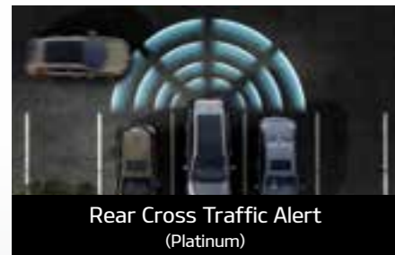
Rear Cross Traffic Alert (Platinum)