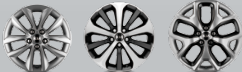
17" Alloy (Si) | 18" Alloy (Machine finish) (SLi) | 19" Alloy (Shadow chrome) (Platinum)

For full terms and conditions on Kia's 7 Year Unlimited Km warranty, visit www.kia.com.au . Note: 7 year/150,000km warranty for vehicles used for the following: rental vehicles, hire cars, taxis, courier vehicles, driving school vehicles, security vehicles, bus and tour vehicles. *Leather trim includes some leather-like material on selected high impact surfaces.