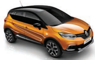
Atacama Orange + Diamond Black (XWB) M