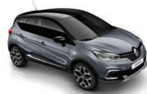
Oyster Grey + Diamond Black (XNK) M