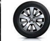
16" two-tone 'Discover' alloy wheels