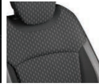
Overseas model shown Ivory removable upholstery