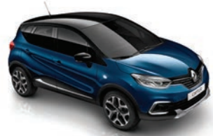
Ocean Blue + Diamond Black (XWD) M