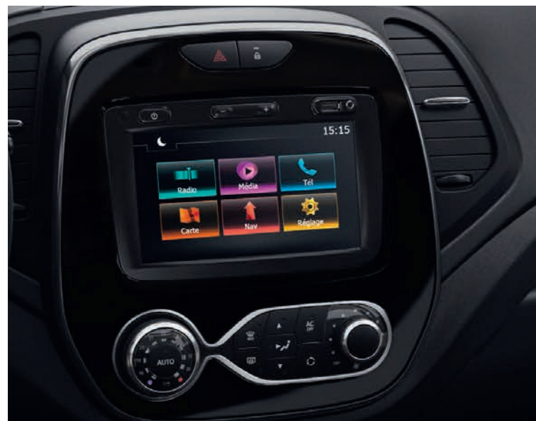
Media Nav Evolution*

Renault Captur offers you two fully touch-sensitive multimedia systems: Media Nav Evolution* and R-LINK Evolution^.