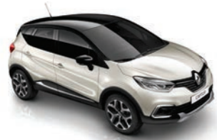
Ivory White + Diamond Black (XND) S