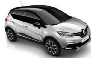
Mercury Grey + Diamond Black (XNM) M