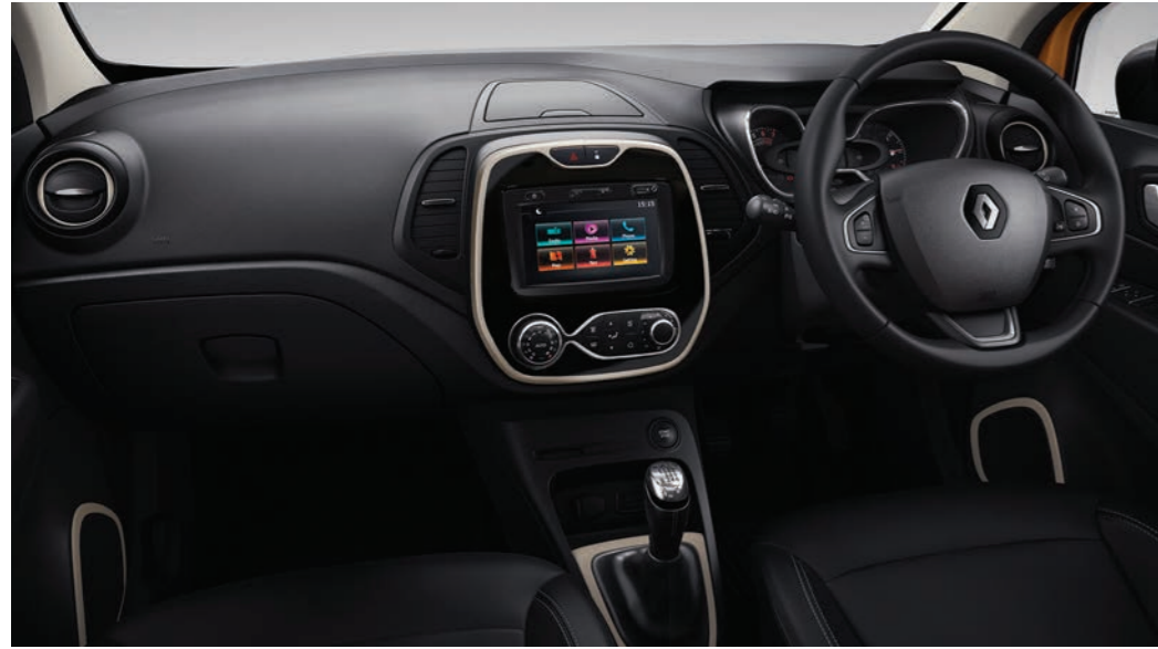
Contrasting interior decor