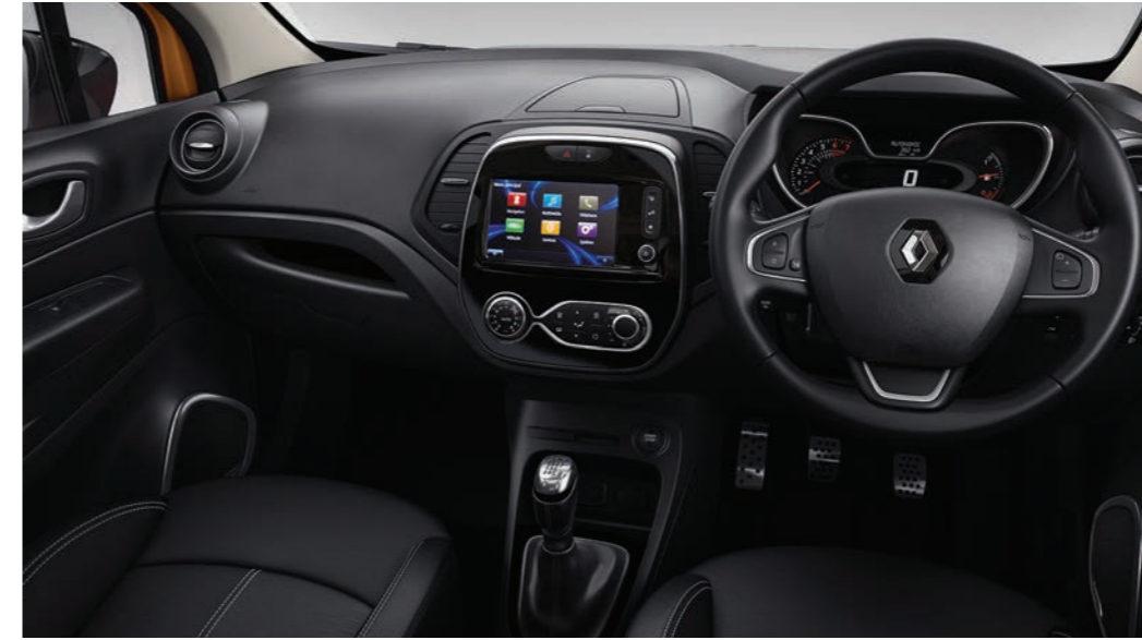
Contrasting interior decor