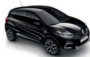
Diamond Black (GNE)*M