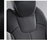
Overseas model shown Fixed dark charcoal leather seats