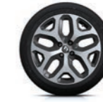
17" two-tone 'Emotion' alloy wheels