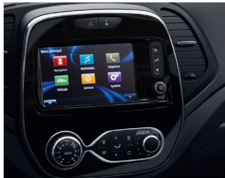
With its 7" touchscreen, intuitive voice control** and steering wheel-mounted controls, Renault R-LINK Evolution^ lets you access innovative, practical features, including TomTom navigation, multimedia, a telephone system and vehicle data.

*Standard on Zen. Not available on Intens.