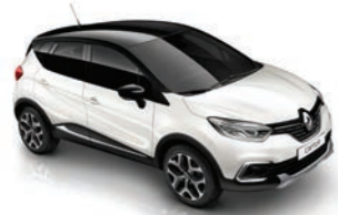
Pearl White + Diamond Black (XUI) M