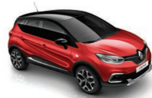
Flame Red + Diamond Black (XPA) M