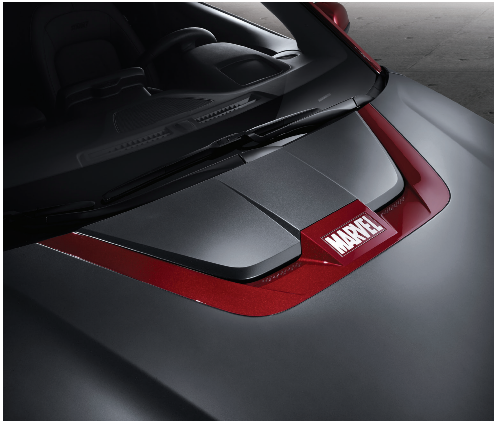
V-shape hood bevel with Marvel logo