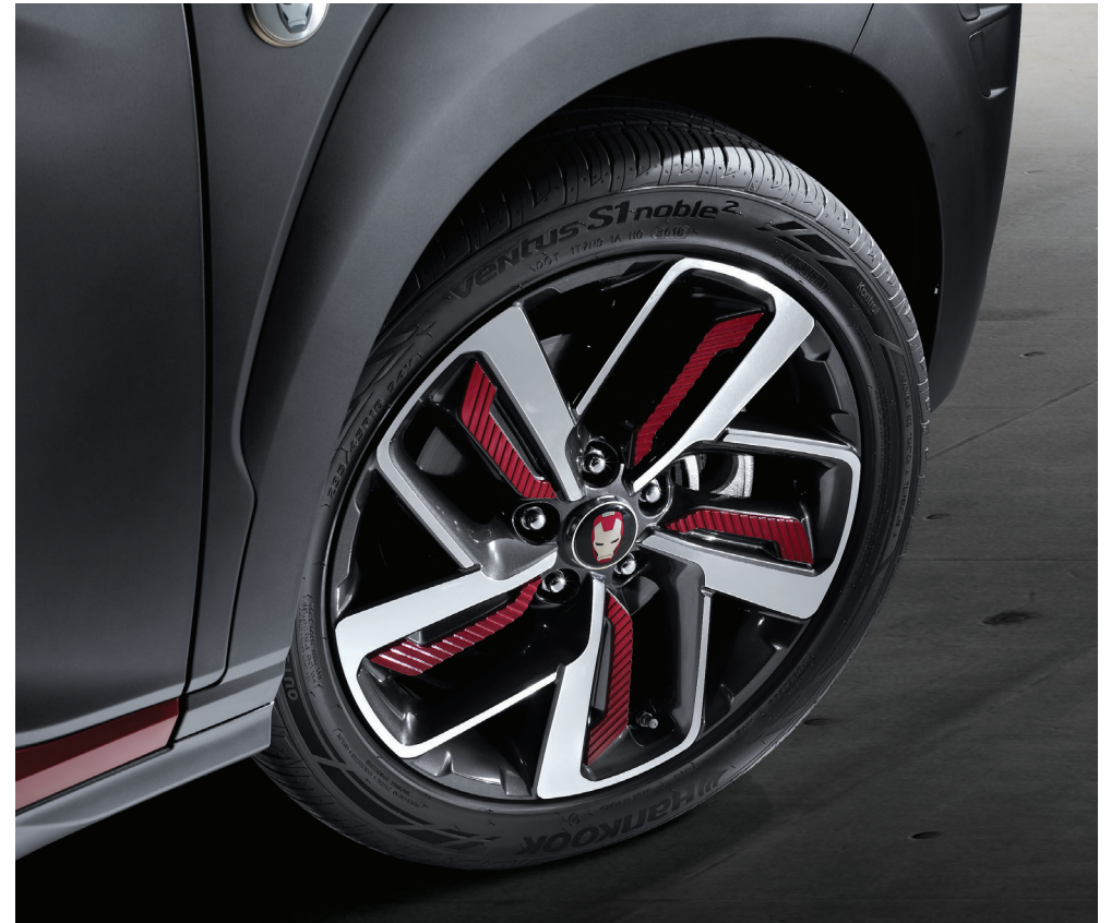
Iron-grip dual-tone 18-inch alloy wheels