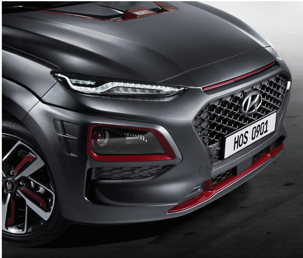
Iron Man Exosuit cues throughout, on front and rear bumpers, dark chrome grille, headlight bezels, LED Daytime Running Lights

Matte metallic gray body color is matching the original Iron Man suit when the character first appeared in 1963 in the Marvel Comics series "Tales of Suspense." The shade of red used for the most recent Iron Man suit was applied as a point color for the vehicle.