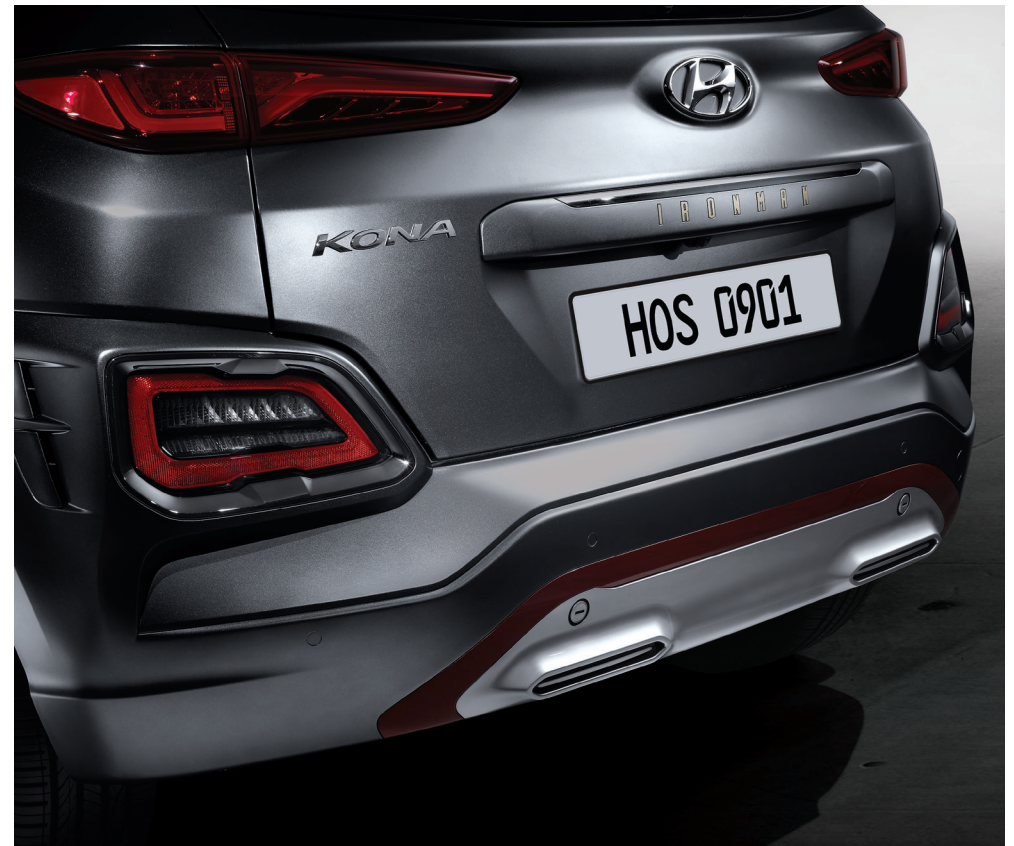
Rear garnish with Iron Man letter emblem & red two-tone skid plate