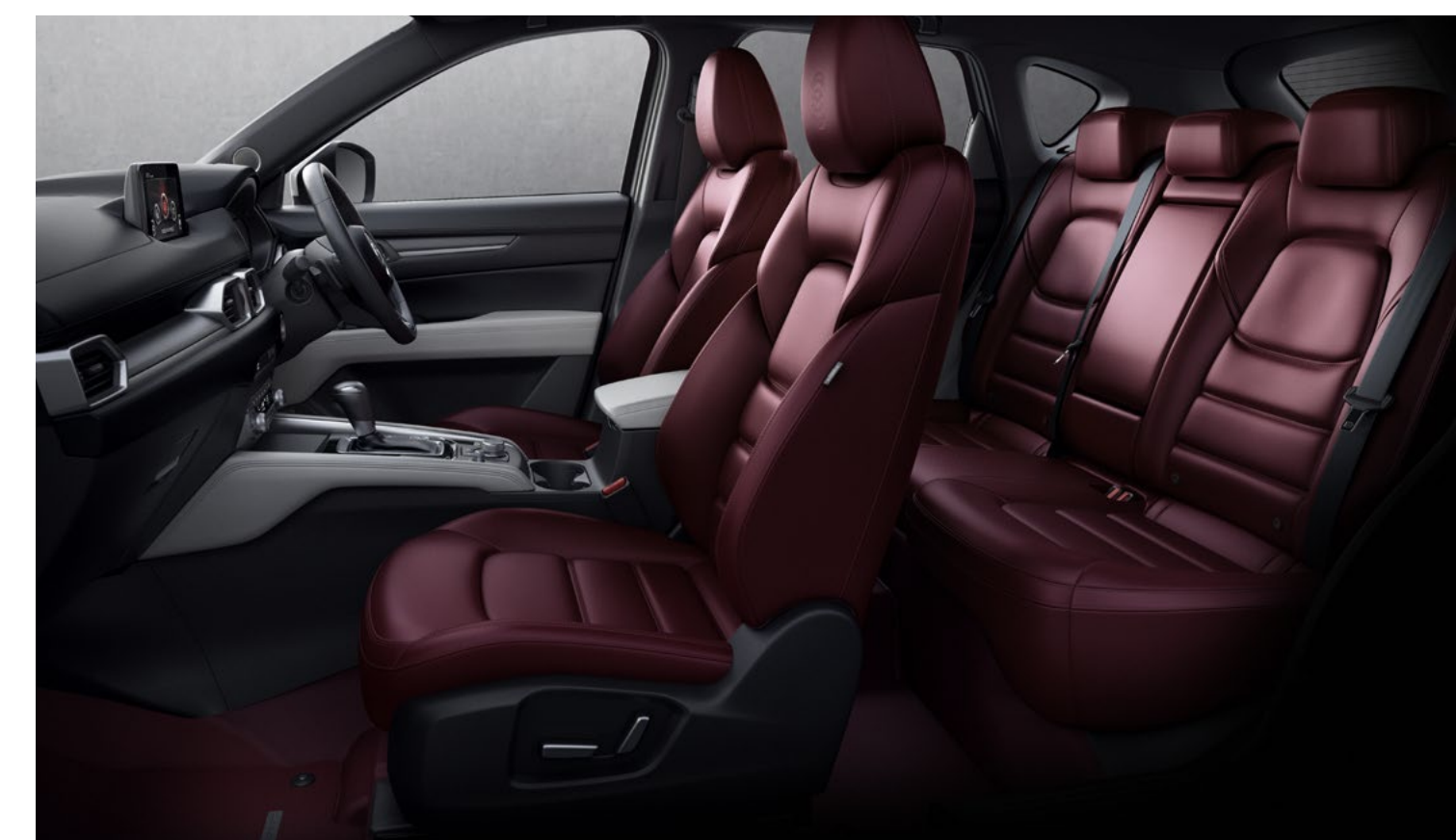
Overseas model shown.

CLICK HERE TO LEARN MORE ABOUT 100 YEARS OF MAZDA