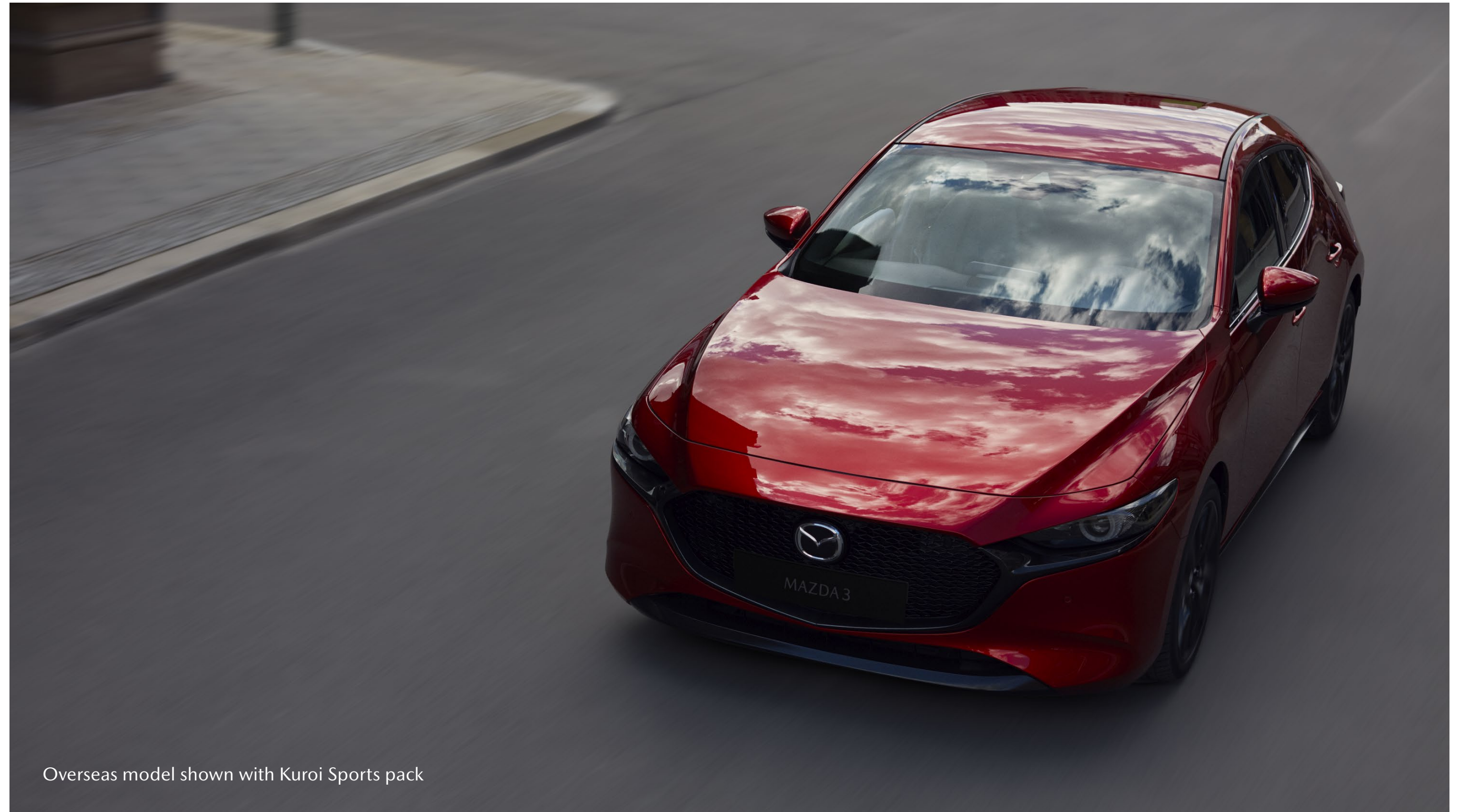
Overseas model shown with Kuroi Sports pack

The combination of these two systems takes Mazda3 Skyactiv-X M Hybrid to a new level of efficiency without compromising the Zoom-Zoom driving experience.