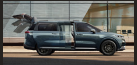
One-Touch Remote Smart Loading (SLi & Platinum)