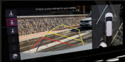
360° Camera View (SLi & Platinum)