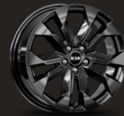
19" Black Alloy (Platinum)