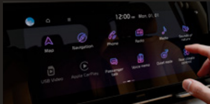
12.3" colour LCD touchscreen (Si, SLi & Platinum)