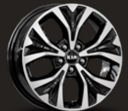
18" Alloy (Si & SLi)