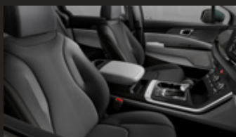
Off Black Cloth Trim (S & Si)