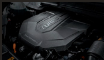
148kW 2.2L I4 Turbo Diesel