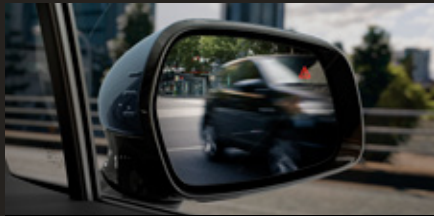
Blind Spot Collision Avoidance Assist 1