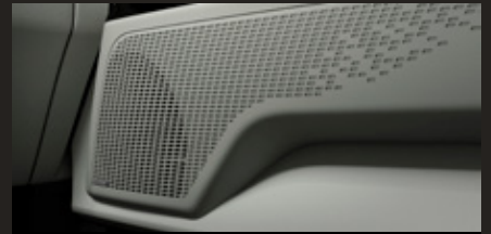
12 Speakers BOSE® Premium Sound System (Platinum)