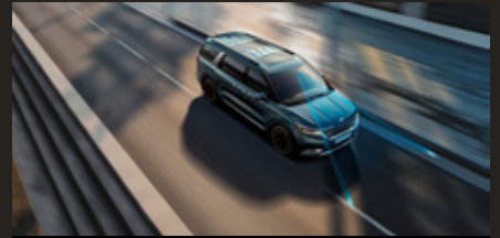
Lane Keeping Assist 1