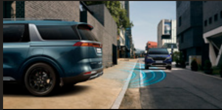
Rear Cross Traffic Alert (RCTA) 1