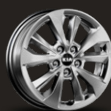
17" Alloy (S)