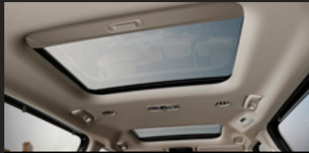
Dual Sunroof (Platinum)