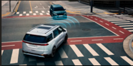
Autonomous Emergency Braking (AEB) 1 (With Junction Assist)