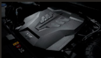
216kW 3.5L V6 Petrol