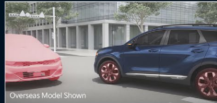
Overseas Model Shown Autonomous Emergency Braking*1 (with Junction Assist)