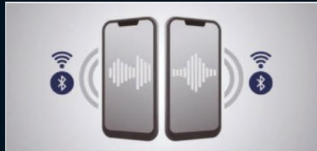
Bluetooth® Multi-Connection Functionality*2