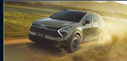
Tuned for Australian Roads