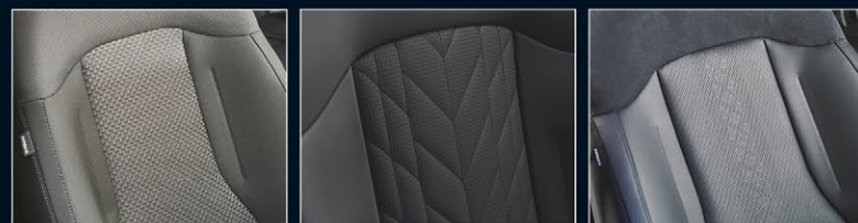
Black Cloth Trim (S, SX) Black Quilted Artificial Leather (SX+) Black Leather Appointed*5 with Artificial Suede Upper (GT-Line)