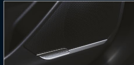
8 Speaker Harman Kardon Premium Sound System (SX+, GT-Line)