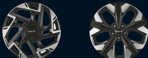
19" Alloy (SX+) 19" Alloy (GT-Line)