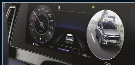
Blind Spot View Monitor*1 (GT-Line)