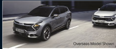
Overseas Model Shown Blind Spot Collision Avoidance Assist with Rear Cross Traffic Collision Avoidance*1 (Not Available on M/T)