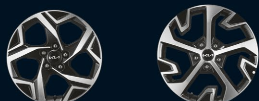
17" Alloy (S) 18" Alloy (SX)