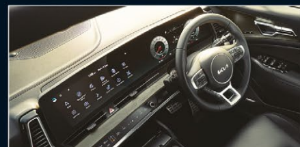
Curved Display (12.3" Digital Driver Cluster + 12.3" Touch Screen Infotainment) (GT-Line)