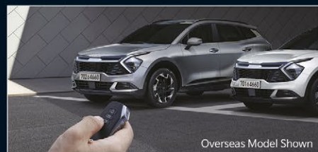
Overseas Model Shown Remote Smart Park Assist*3 (GT-Line Diesel)