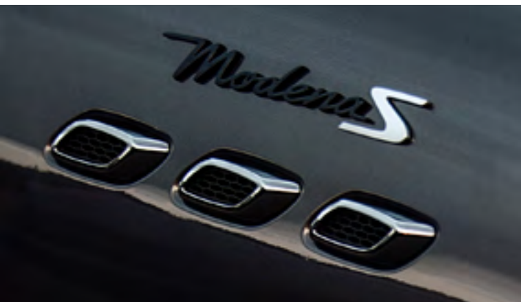
Levante - Side air vents and Modena Badge

In true Maserati grand touring tradition, the Levante offers everything you would expect of a Maserati – from snarling responsiveness to effortless long-distance refinement. At the same time, its dramatic SUV proportions are balanced with graceful lines and muscular forms that convey its dynamic purpose. From the chassis with a very low center of gravity as you glide through your top speeds, to the perfectly balanced weight distribution, through its sharp aerodynamic body. The ultimate combination of leading on-road performance and off-road capabilities.