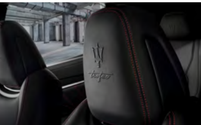
Levante Trofeo - Headrest detail