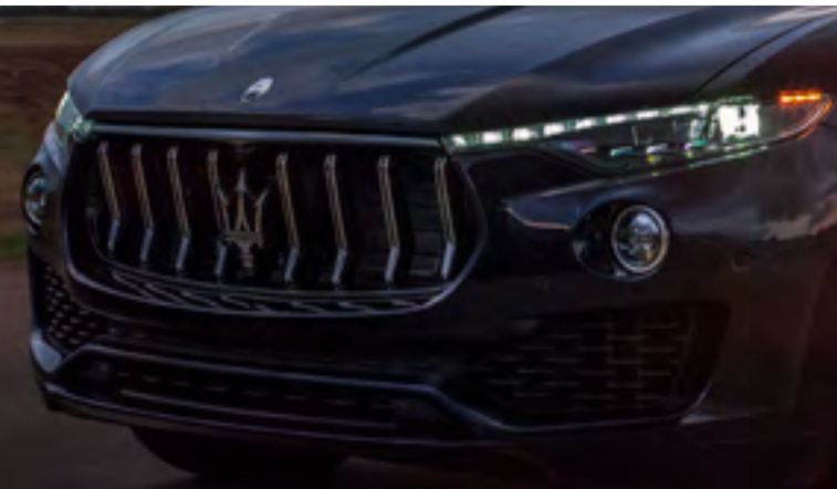
Levante GT Hybrid - Grille