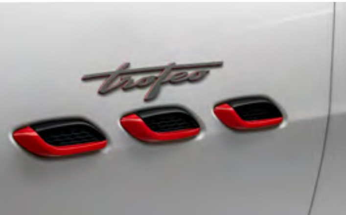
Levante Trofeo - Side air vents and Trofeo Badge