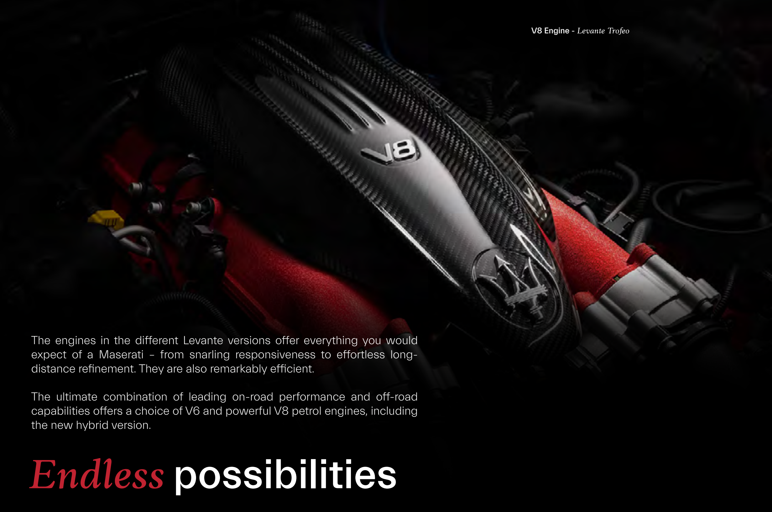
V8 Engine - Levante Trofeo