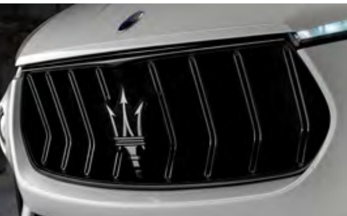
Levante Trofeo - Grille

572 HP Max power 302 km/h Max speed 4.1 sec Acceleration V8 Engine layout AWD Traction 730 Nm Max torque