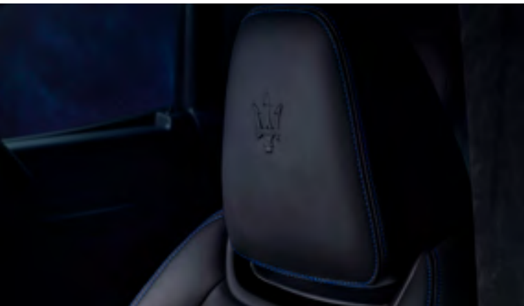
Levante GT Hybrid - Headrest detail