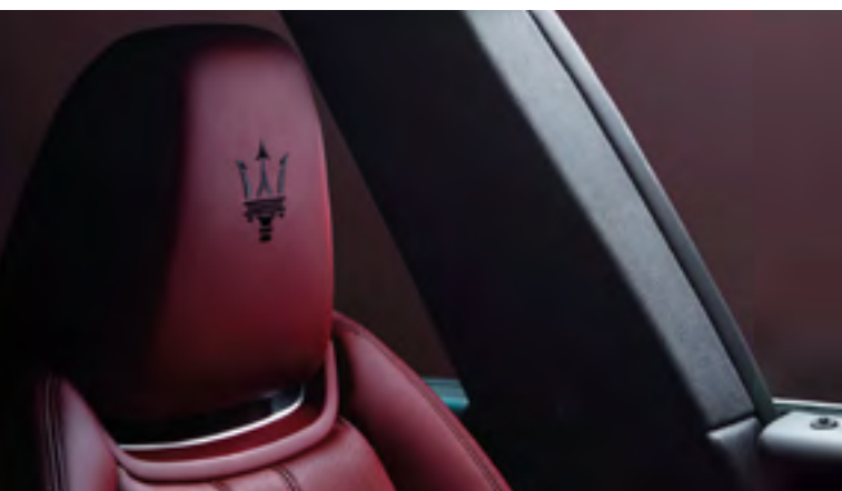
Levante - Headrest detail