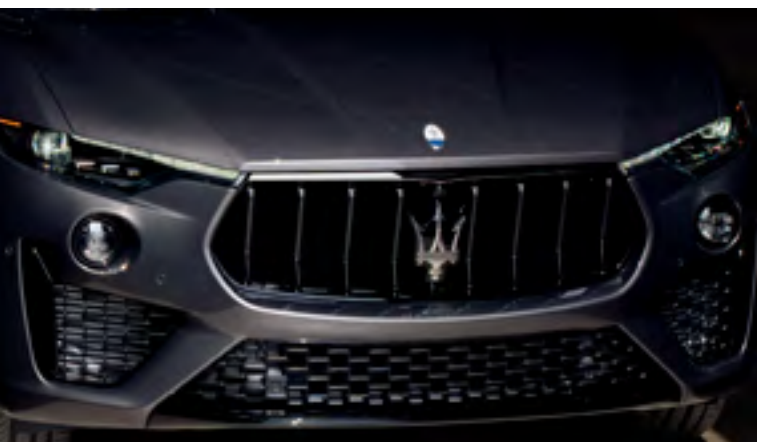
Levante - Grille