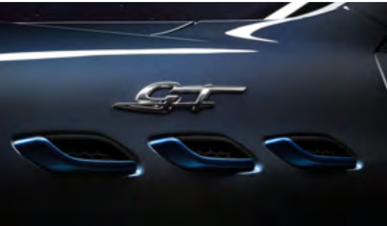
Levante GT Hybrid - Side air vents and GT Badge