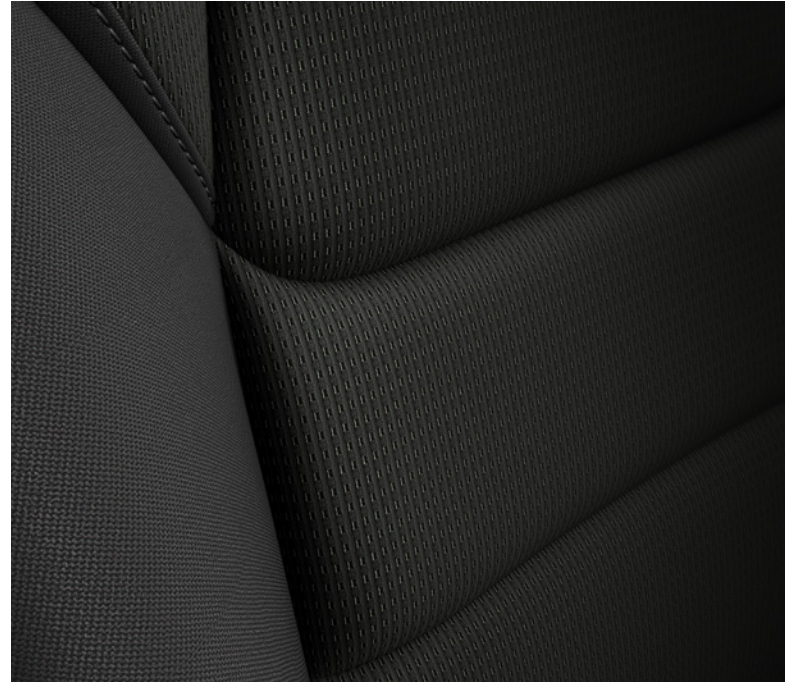
Black cloth (Maxx Sport)