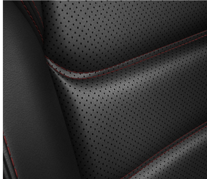
Black Leather# with contrast red stitching (GT SP)