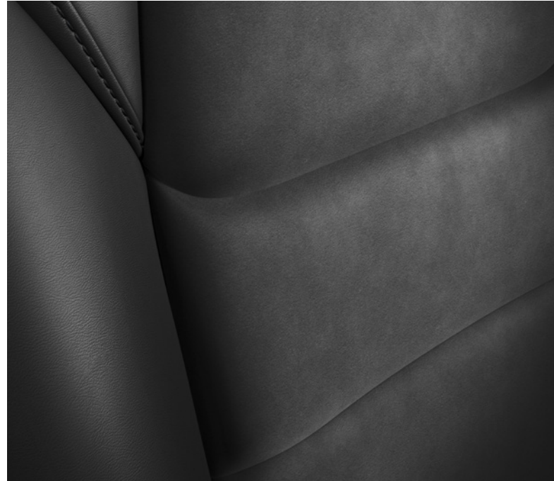
Black Maztex/Black Grand Luxe® Synthetic Suede^ (Touring)