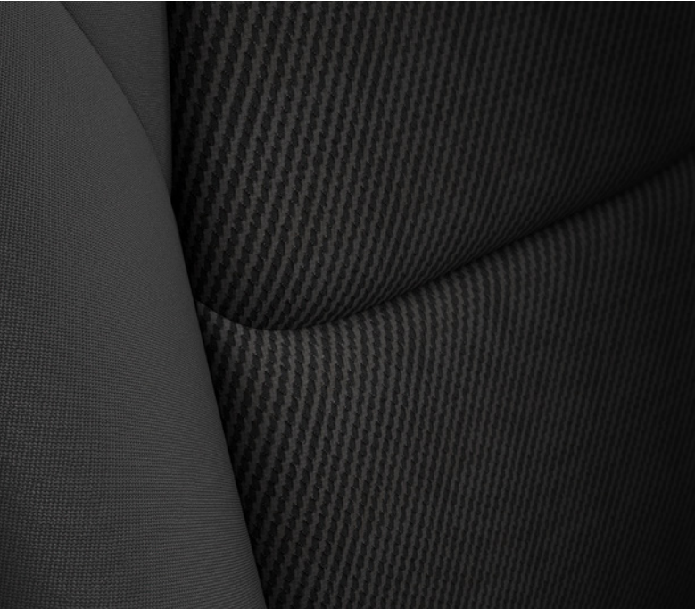
Black cloth (Maxx)