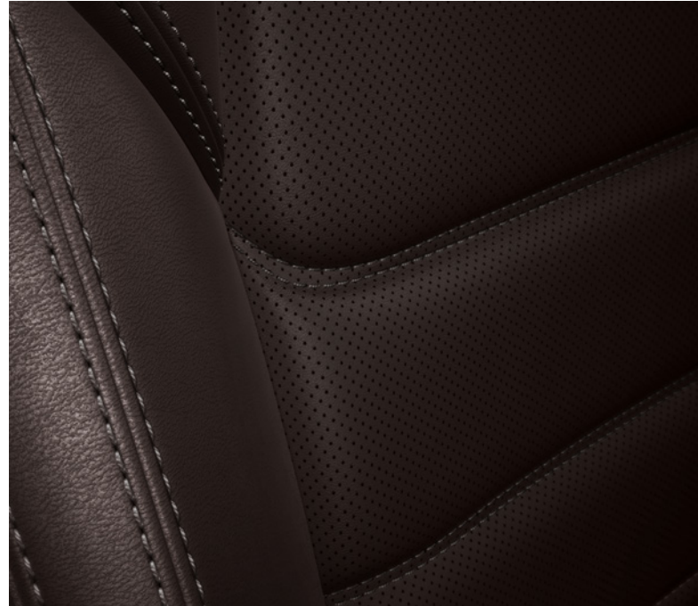
Dark Russet nappa leather# (Aker)