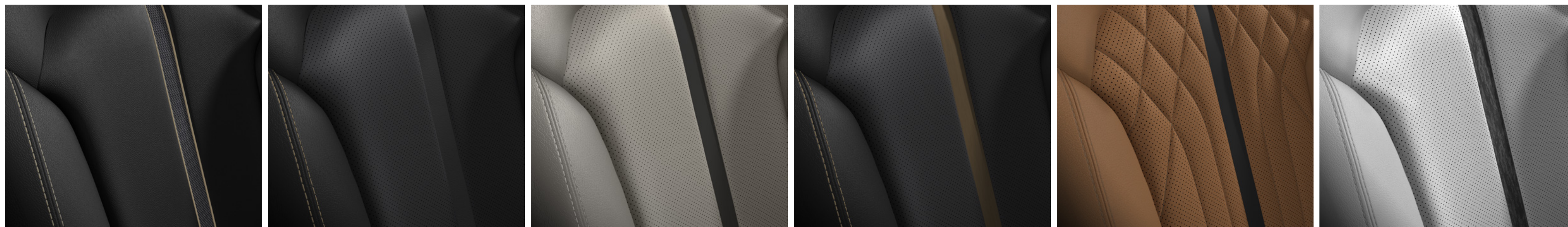
Black Maztex (Evolve)